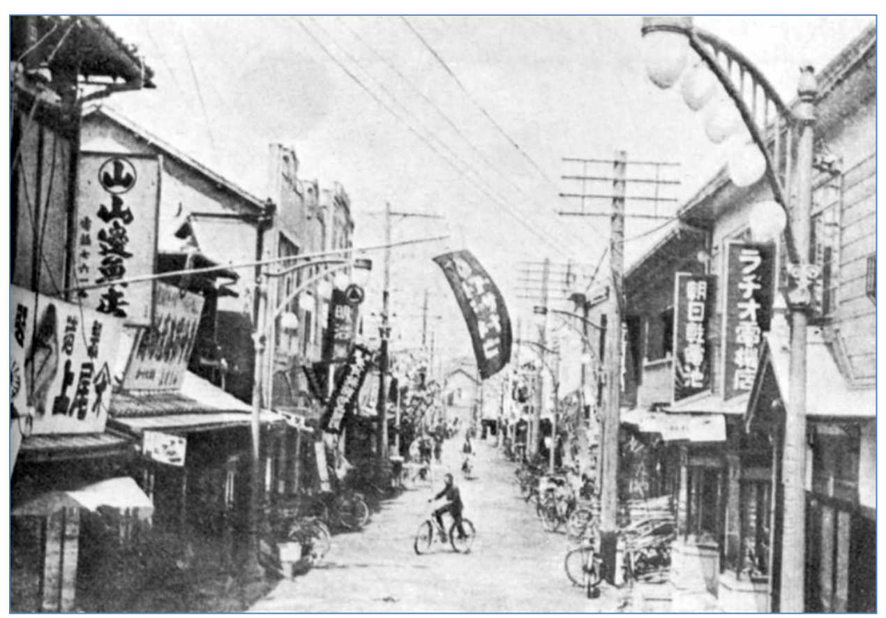
Wonsan is a port city on the east coast of what is today North Korea. The photo shows a Japanese shopping area in downtown Wonsan during the occupation

Sun Myung Moon Republished by International HQ Mission Office September 24, 2021