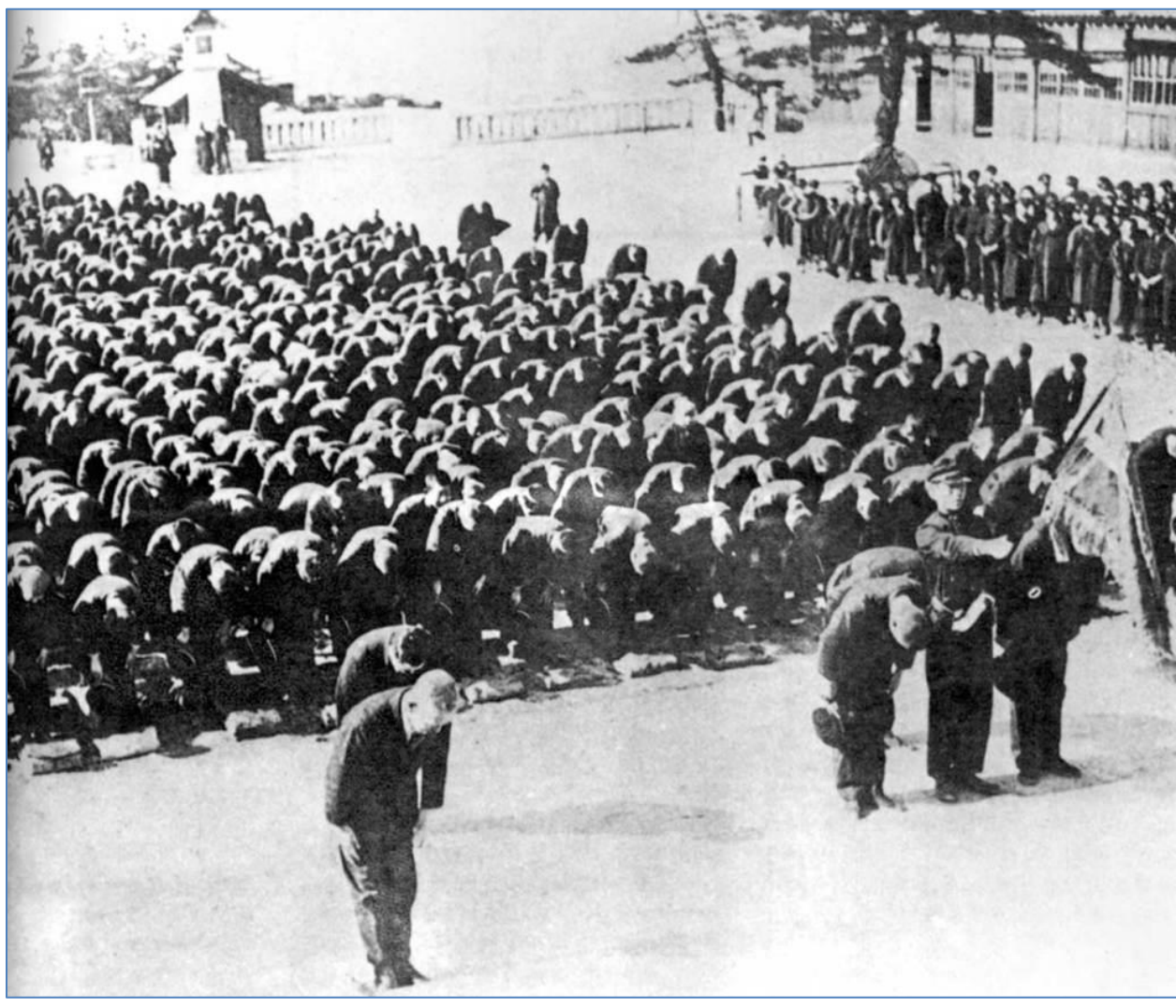
Korean schoolchildren compelled to pledge allegiance to the Japanese emperor