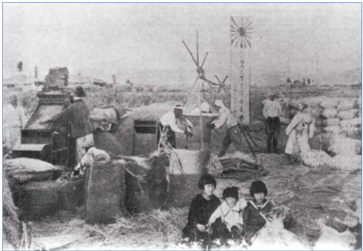
The years that Father's testimony covers were difficult ones for Korea, especially in rural areas. These photos were taken in the 1930s. The banner reminded Korean farmers of the percentage of their harvest that had to be offered to the Imperial Army

Imagine how frantic with worry she must have been. She is truly a great mother. I was not able to show filial devotion toward her. I believe my mother loved me more than any mother ever loved a son. I was unable to show her the proper respect. Why was that? I had to love you first.