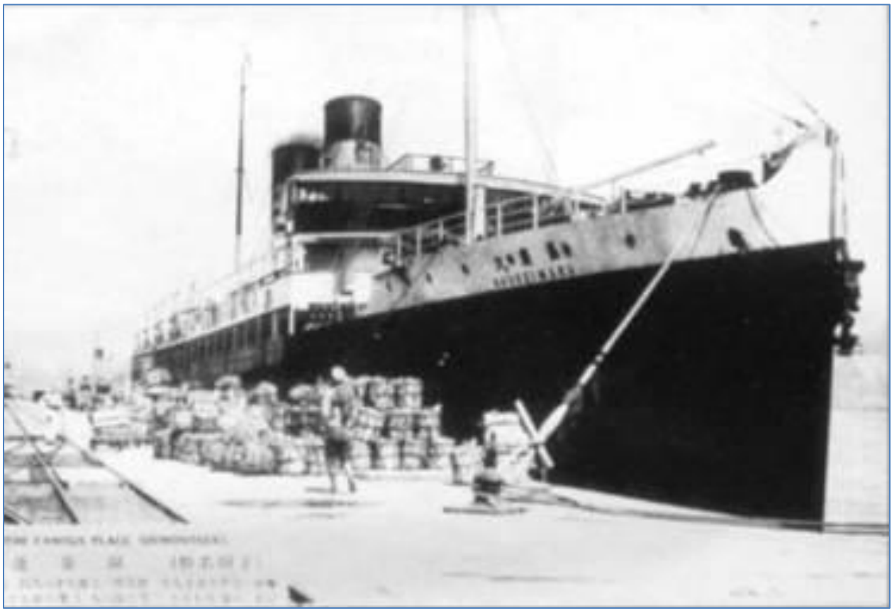
A ferry that was sunk

I had gone to Tokyo to study, but they graduated us six months early so students could do military service. Under the Japanese, students of subjects related with engineering were graduated six months early. By the time I graduated, the war [Second World War] in East Asia was in full swing. Because Japan needed people to support the military effort, they graduated us in September rather than in March.