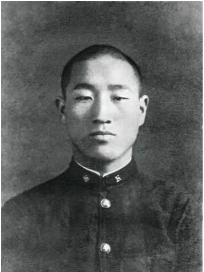
True Father in his school uniform

When the body is trained, a base for the spiritual world is established. You then become a real man who will not float away. You should be bold and confident with the authority of an eldest son.