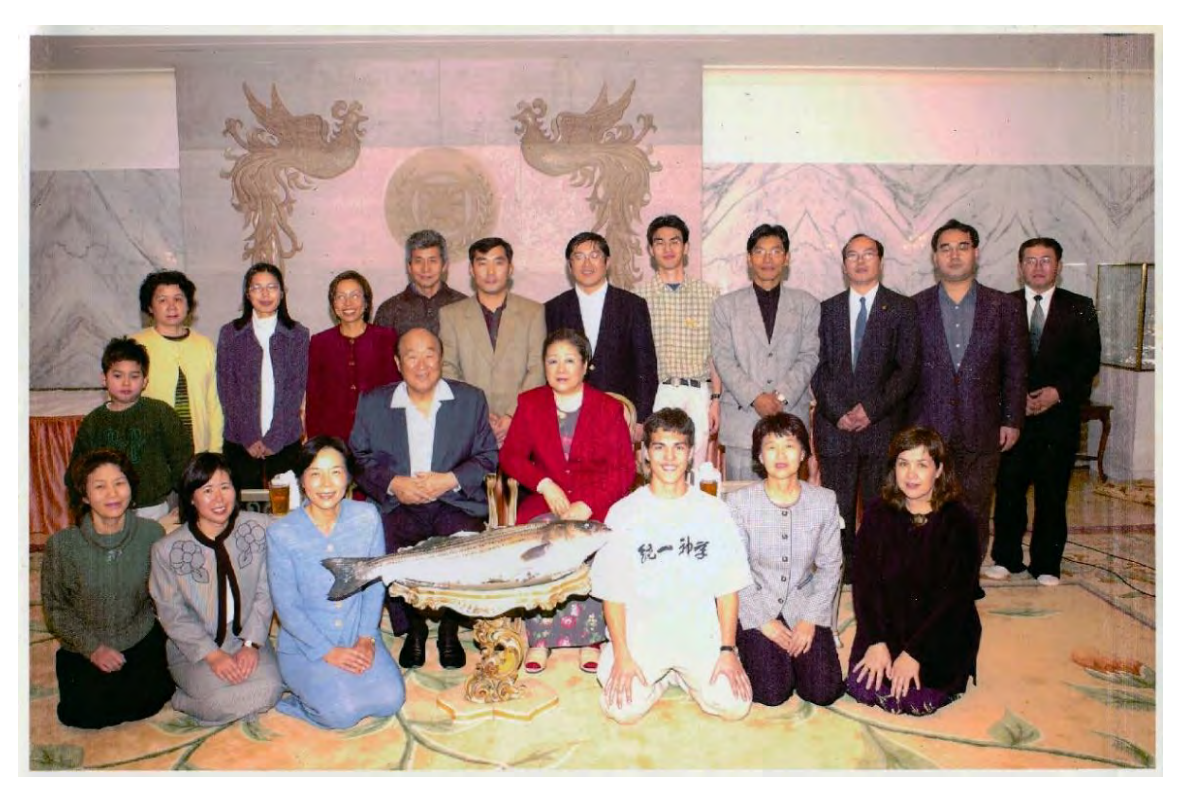
The trophy-winning striped bass from a bass fishing tournament being displayed at East Garden. I have no idea why I was there, other than I love Father so much.