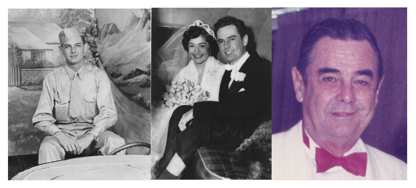
My father in the US Army.