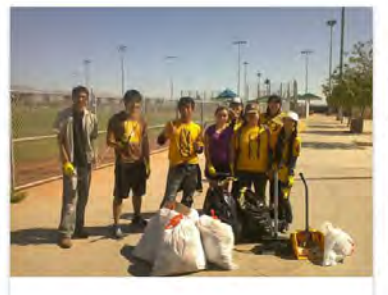
April 26, 2013 @ Lorenzi Park