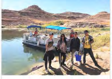
October 20, 2018 @ 33 Hole Overlook,