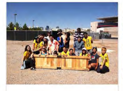
August 9, 2014 @ Rebel Recycling