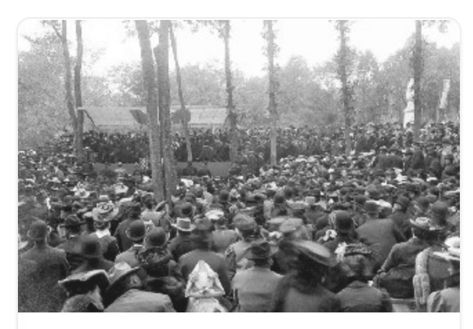
HISTORY OF ARBOR DAY