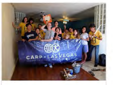
August 22, 2014 @ CARP Las Vegas House