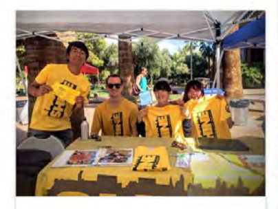
September 2, 2015 @ UNLV Involvement