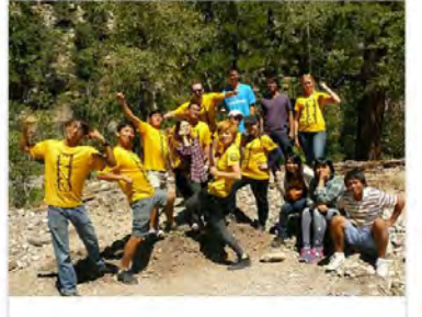
August 15, 2014 @ Mt. Charleston