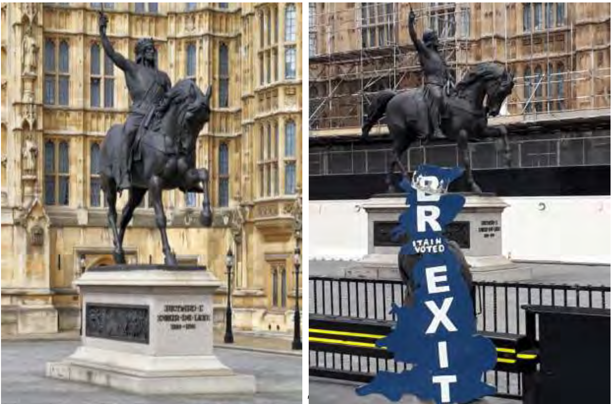
Richard 1st – Famous Christian King who fought the Muslims in the Crusades - Also known as 'Richard the Lion Heart' - Brexit Map-Man receives inspiration from the great King

Everyday after work I go to Parliament Square with my map of England on my back.