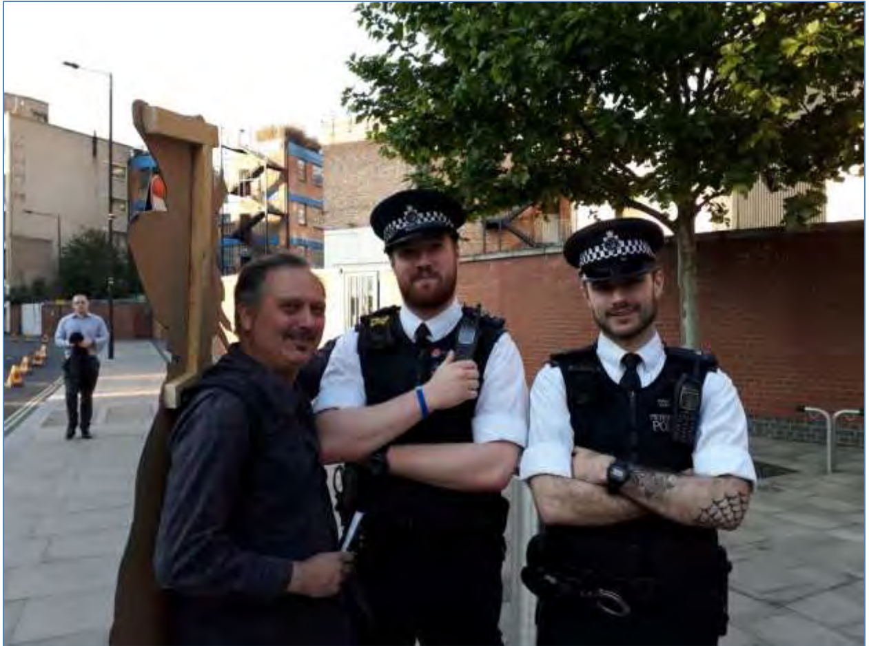
Police Love – The British Police are nice – Until you upset them!