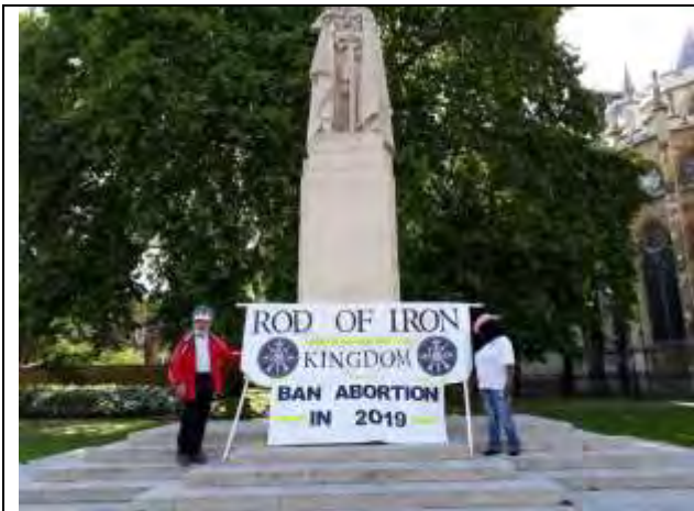
We had lots of fun and lots of positive response from people

We put it up in the middle of Parliament Square. It was Sunday so no MPs – but lots of passing people.