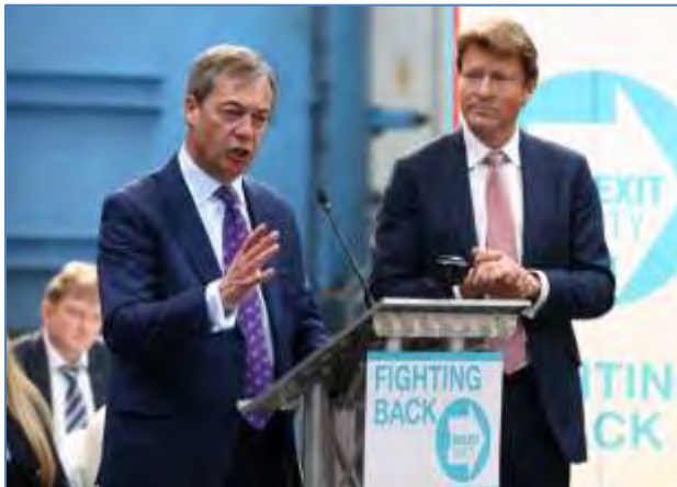
Nigel Farage and Richard Tice

I am famous in the Brexit party because of the map of Britain on my back. I met the no.2 man who is Nigel Farages' right hand man. Richard Tice. We chatted briefly when we went to a rally in the north of England. He will not forget me because I was wearing my map