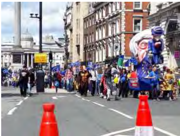
The view as the head of the rally was marching towards us