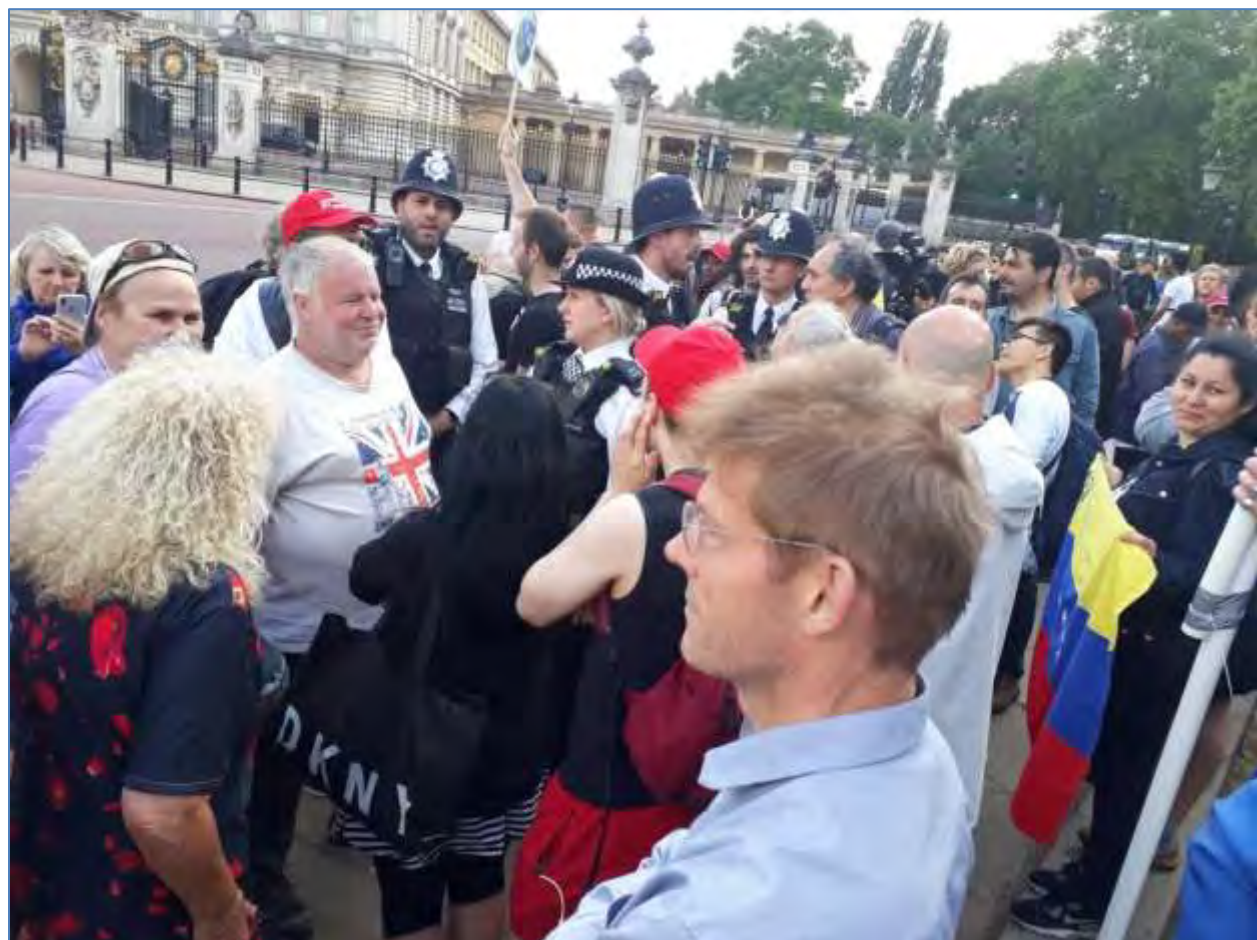
Things got heated and the Police had to step in – But the problem got solved and our leftist friends decided to leave..