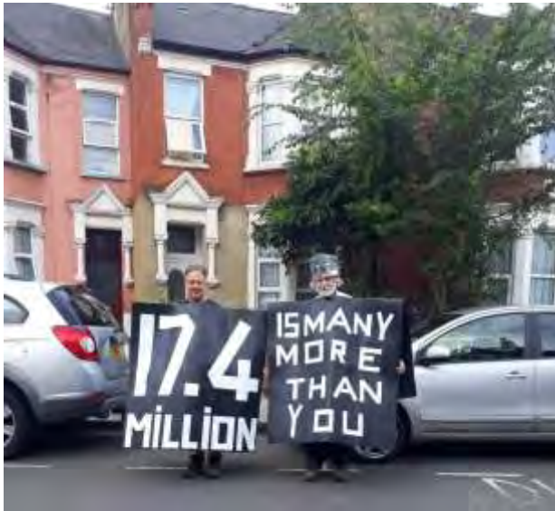
Saturday 20th July – We disrupt a Soros backed 'Stop Brexit' rally.

This was a rally organised by 'Open Britain' which is a George Soros organisation. It was supposed to be huge.