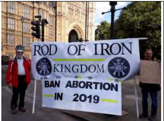
The Symbol is the Witnessing Tool

Of course people who respond to anti-abortion are often religious and either Catholic or Protestant. They always ask what is 'Rod of Iron Kingdom' so then we explain the philosophy of the Kingdom using the symbol. They never argue. It is so simple. Later I will add the domain name so that they can go to the