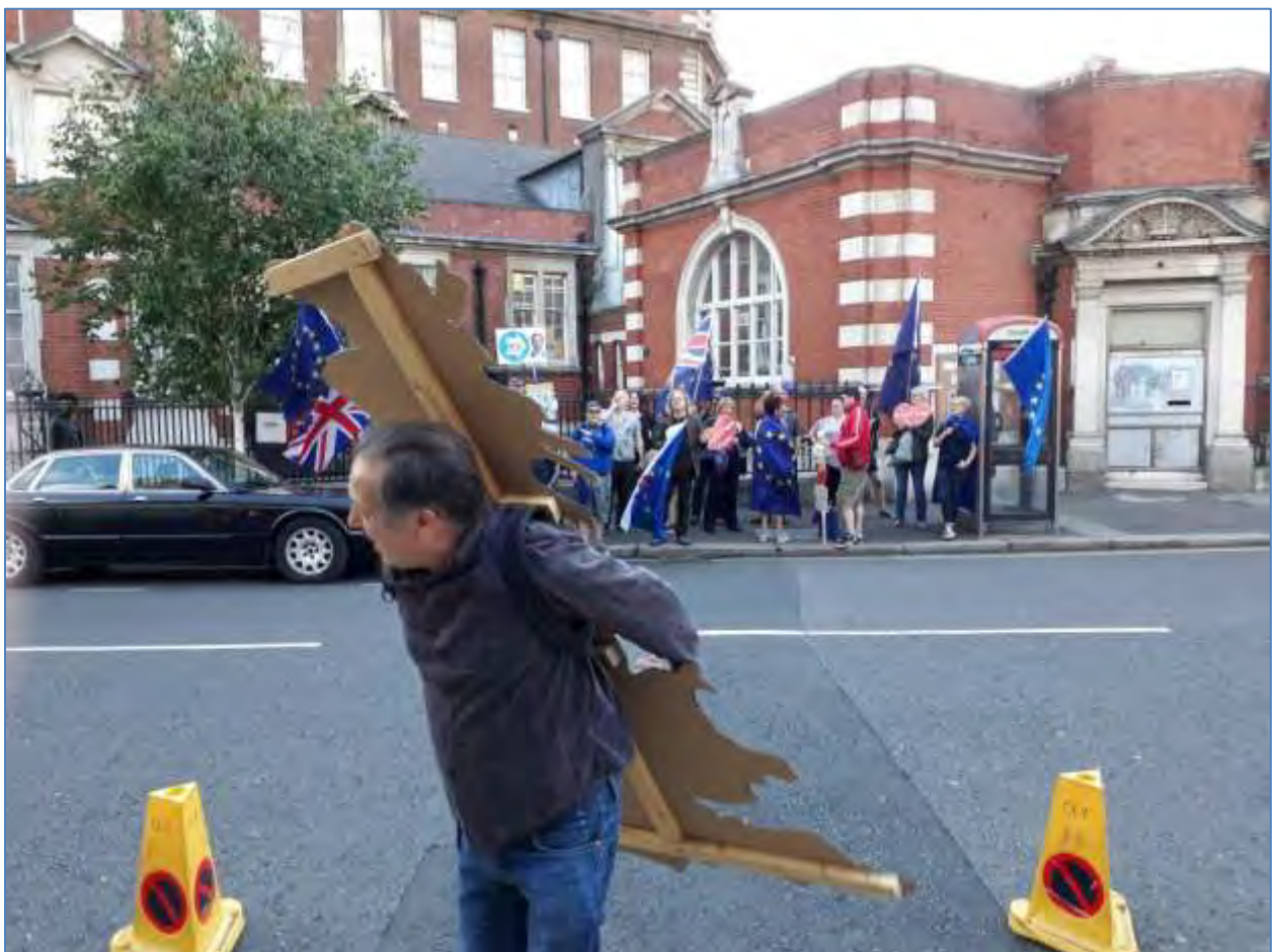
See, read this you suckers!

That means I am now 'Brexit Map-Man' I will utilise this identity from now on.