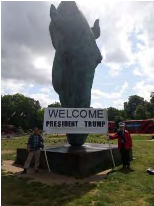
The famous upside down horse head at Marble Arch

We were blessed by Heavenly Father beyond measure for our efforts and words cannot express the joy that we both experienced through this.