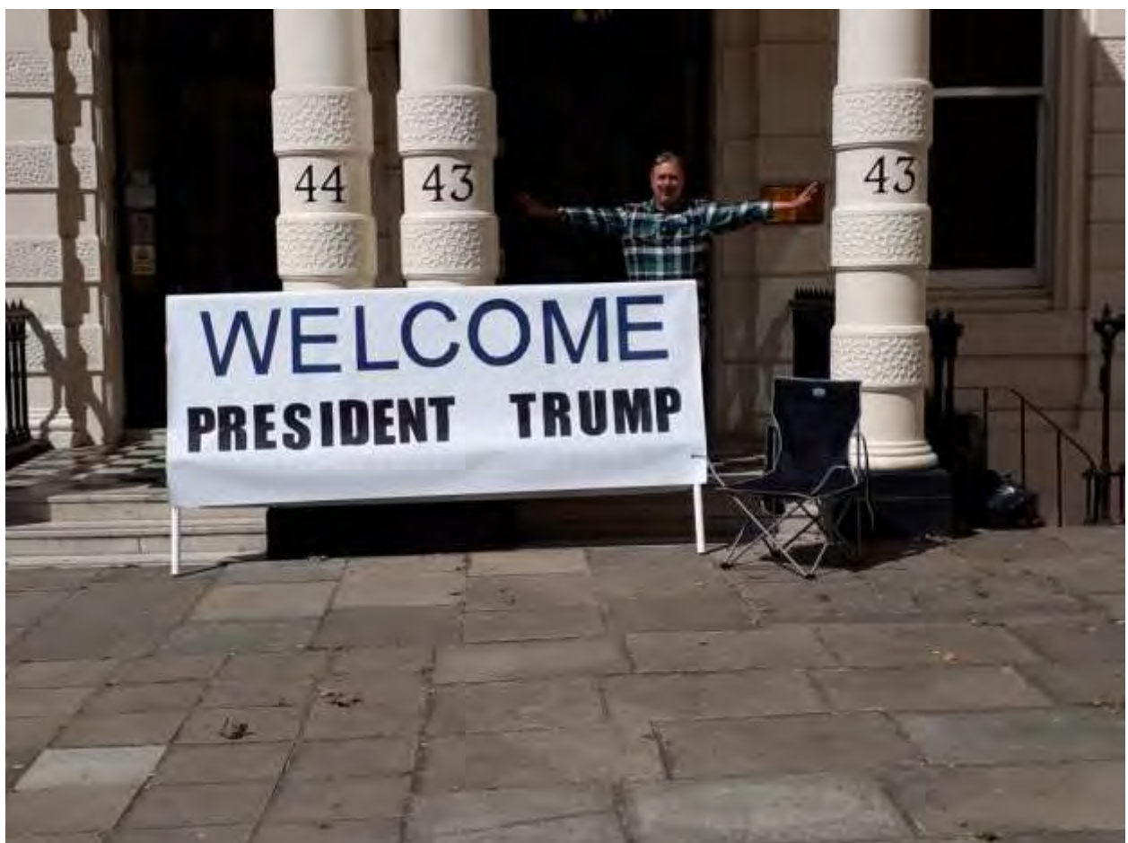
Samson destroys the pillars of the temple (luckily for God the original Samson had longer arms)