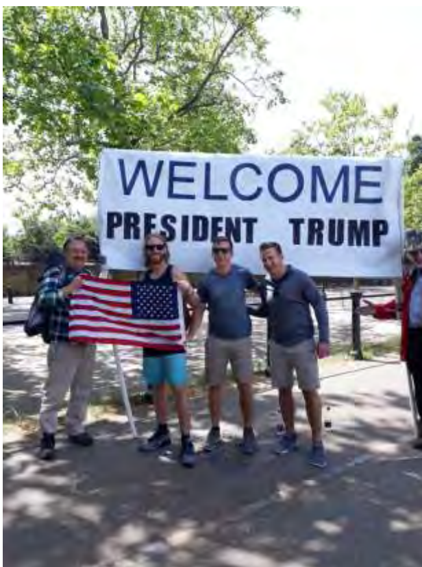
Proud Americans – Were so happy

As we walk through London we get both positive and negative reactions. Some people want photos, we have to keep stopping.