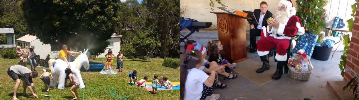
Melbourne Church Christmas Party: