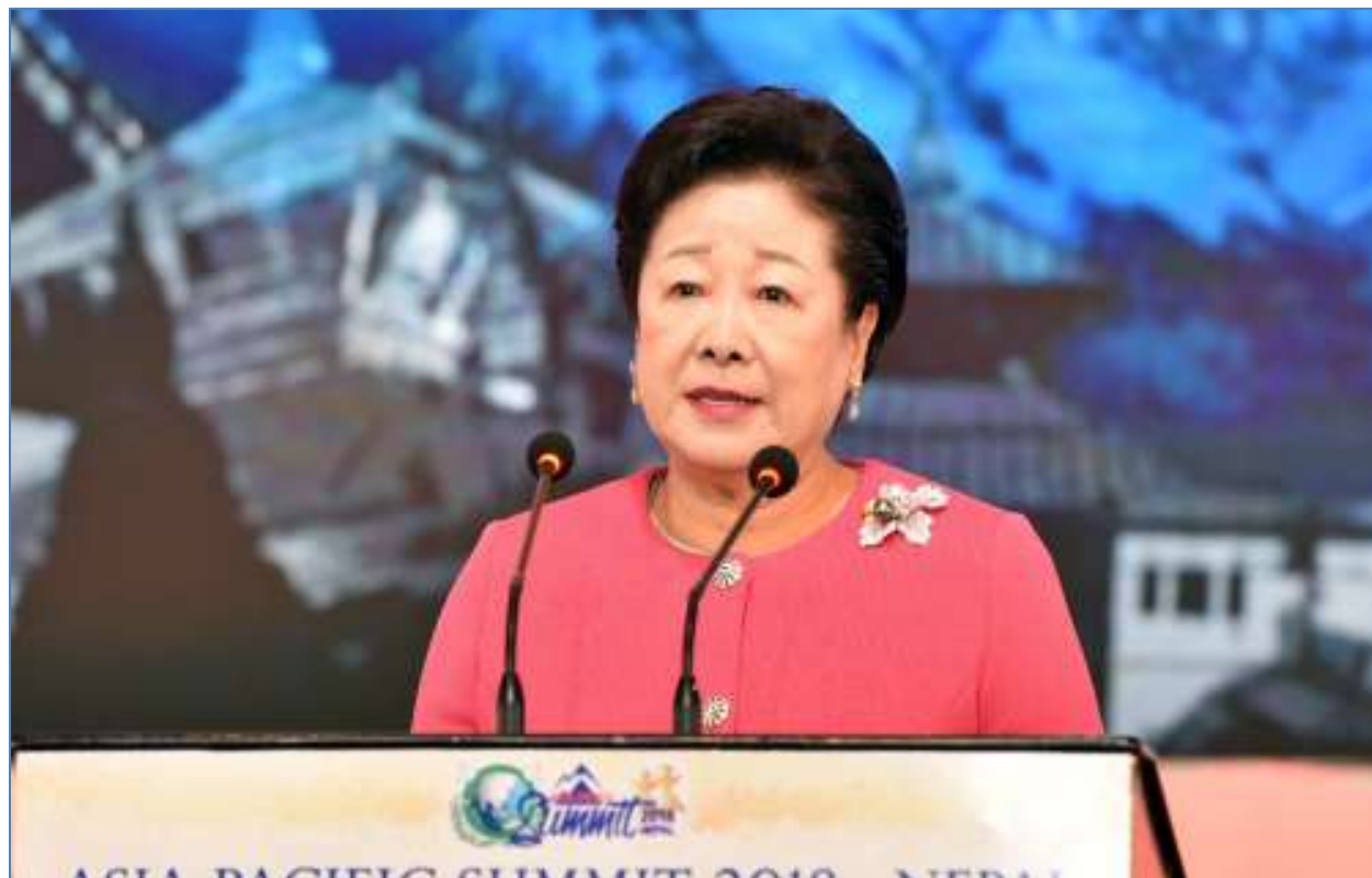
Dr. Hak Ja Han Moon addresses the Asia Pacific Summit 2018 in Kathmandu, Nepal, on Dec. 1.

True Mother (as Unificationists call Dr. Hak Ja Han Moon, wife of the late Rev. Sun Myung Moon) recently concluded her world summit tours. The first continental-level event was held in January 2018 in Senegal, Africa, and the last in December in Kathmandu, Nepal.