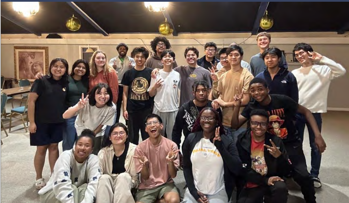
Pictured above: GPA teams and Atlanta youth

If you or someone you know is interested to apply, go to generationpeaceacademy.org/apply .