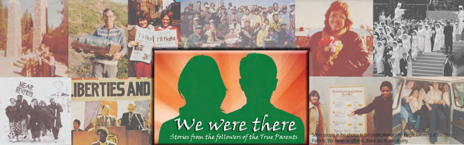
Some people in the photos in this publication are no longer followers of the True Parents. We mean no offense, these are historical only.

"We were there" is a magazine dedicated to record our experiences on the front line and attending True Parents. We encourage all brothers and sisters to write your own special stories, testimonies, or memories to share with the world and to leave these treasures for the future generations.