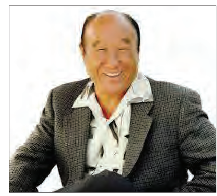
us all in the Grand Ballroom.

We were part of a new providence initiated by True Father, called the IOWC, which means, the International One World Crusade. We were missionaries, not just for the purpose of witnessing, and educating people in the Divine Principle but also to develop what was called a home church where we would also serve the community. Wherever we would be sent, we would be assigned an area of the town or city to create there a homechurch. Three days later, it was announced to us that True Parents were in town, and that Father would be speaking to