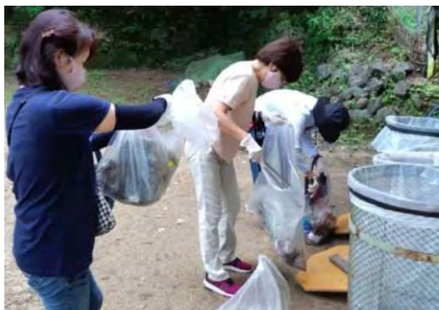
Volunteers from WFWP Japan have been cleaning up Marugame Castle in Kagawa Prefecture for seven years continuously

We know, the anti-Unification-Church camp loudly proclaims that "the damage caused by the former Unification Church is serious and continues to this day." But they have not proved this to be true.