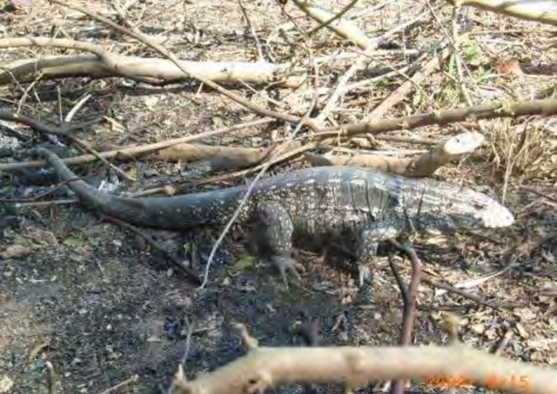
Lizard 도마뱀 蜥蜴