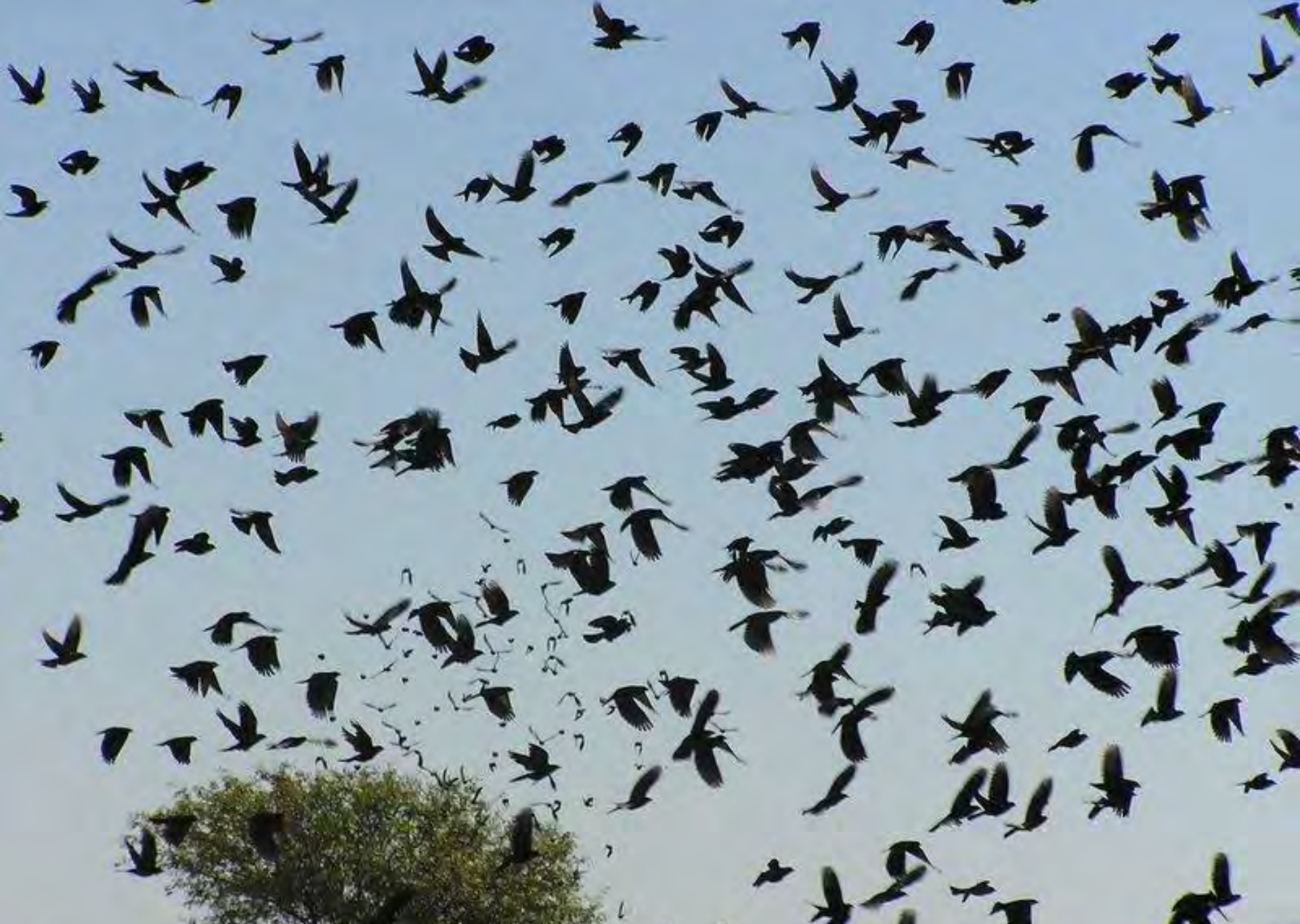
Chopi Blackbird ( Gnorimopsar chopi )