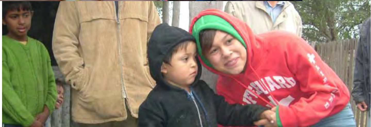
Handing gifts to local children