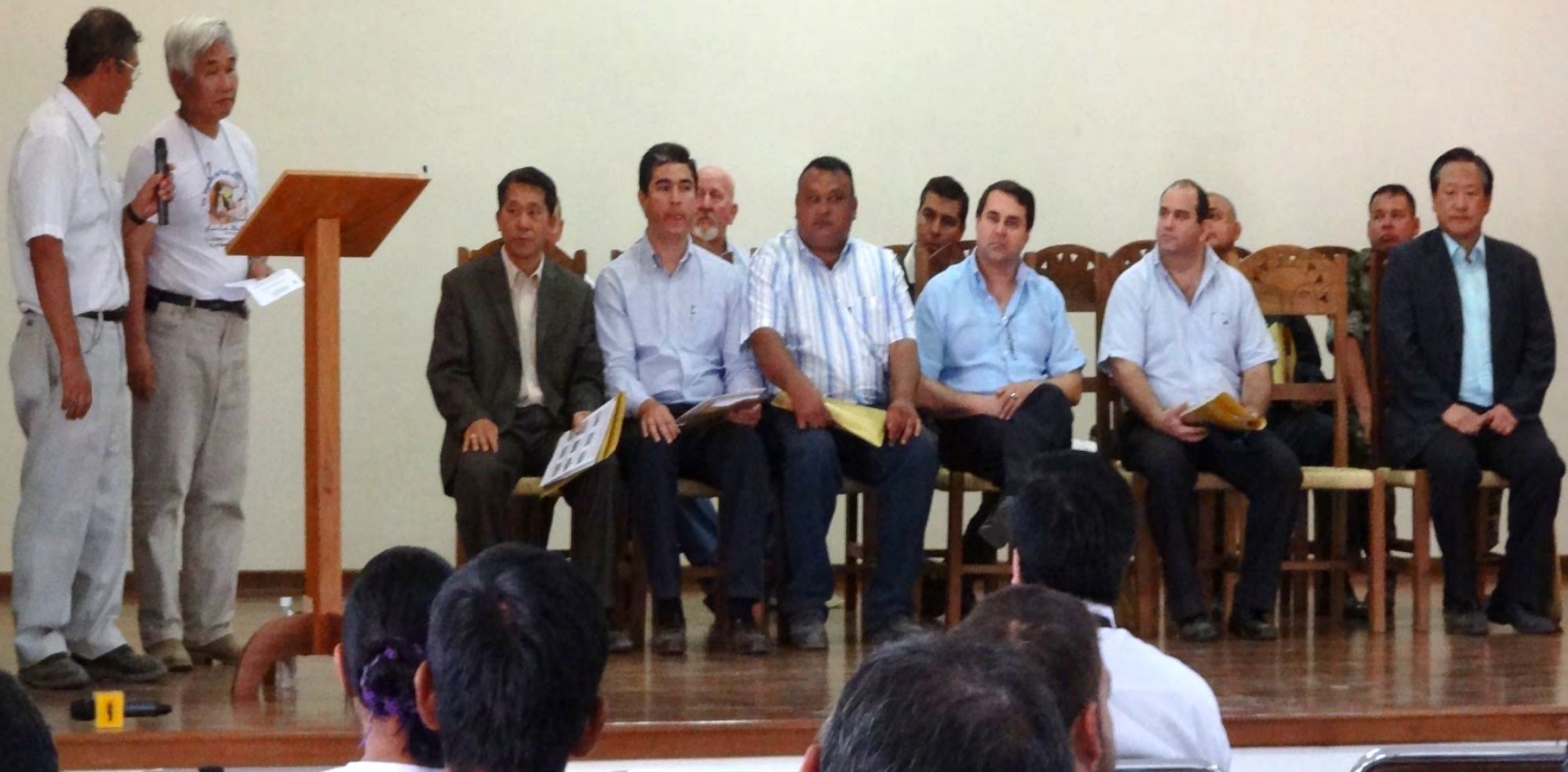
Ceremony with National President, Minister of Agriculture, Minister of Environment, local govmt. leaders (May, 2013)