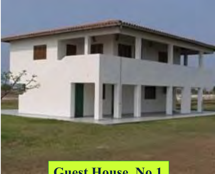
Guest House No.1