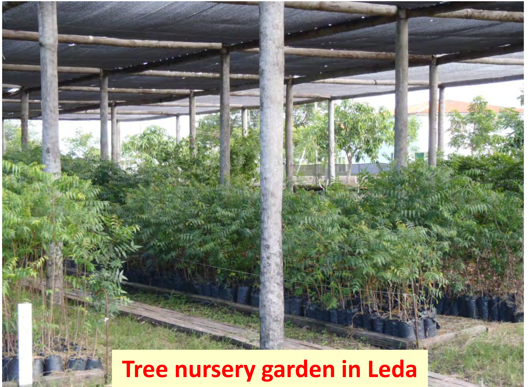
Tree nursery garden in Leda