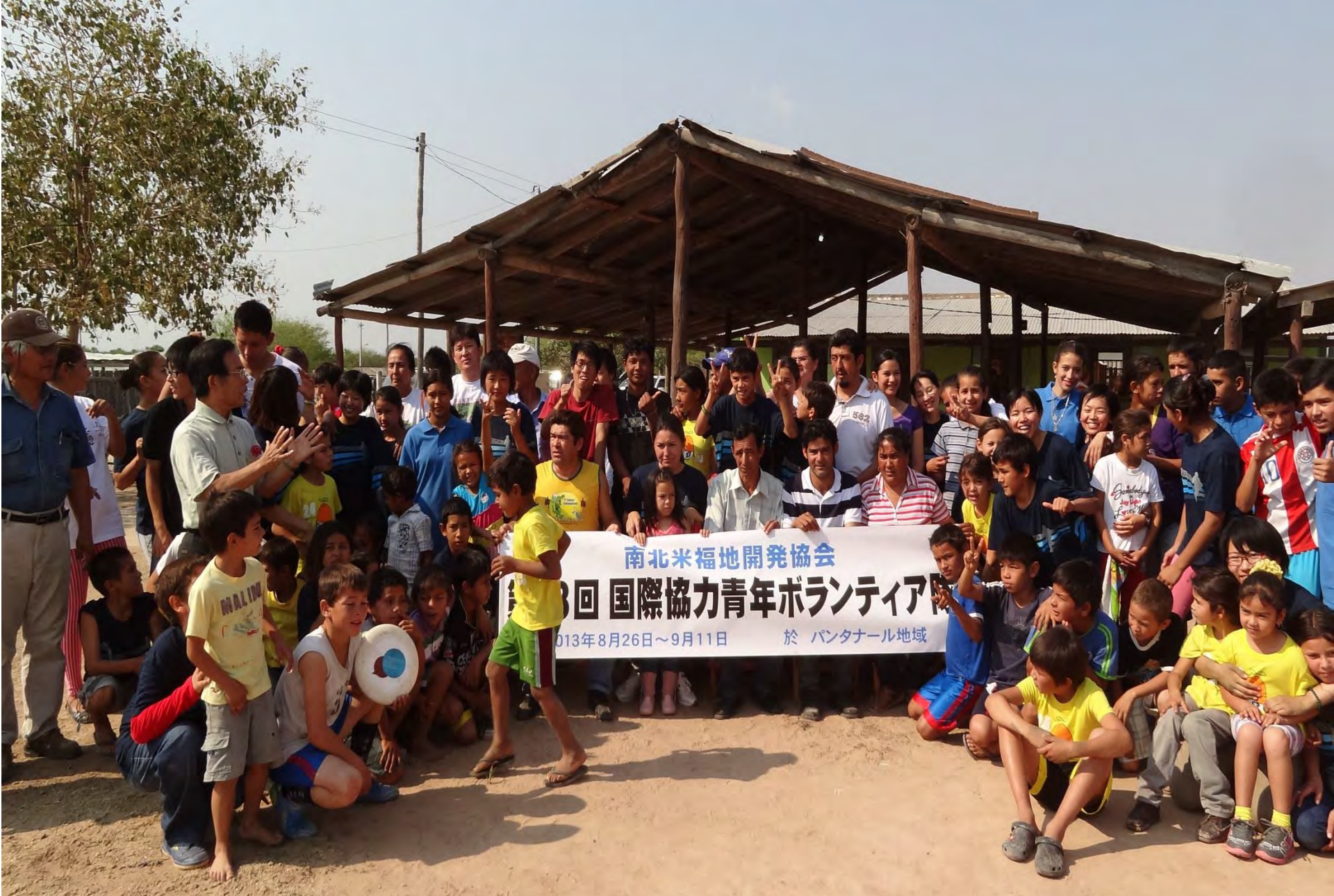
Volunteer students and local students