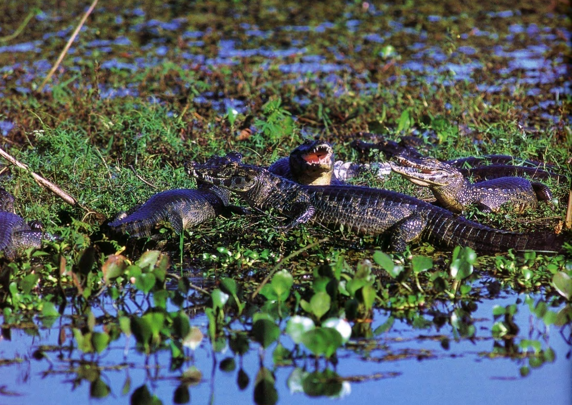
Yacare Caiman ( Caiman yacare ) 야카레카이만 巴拉圭凱門鱷