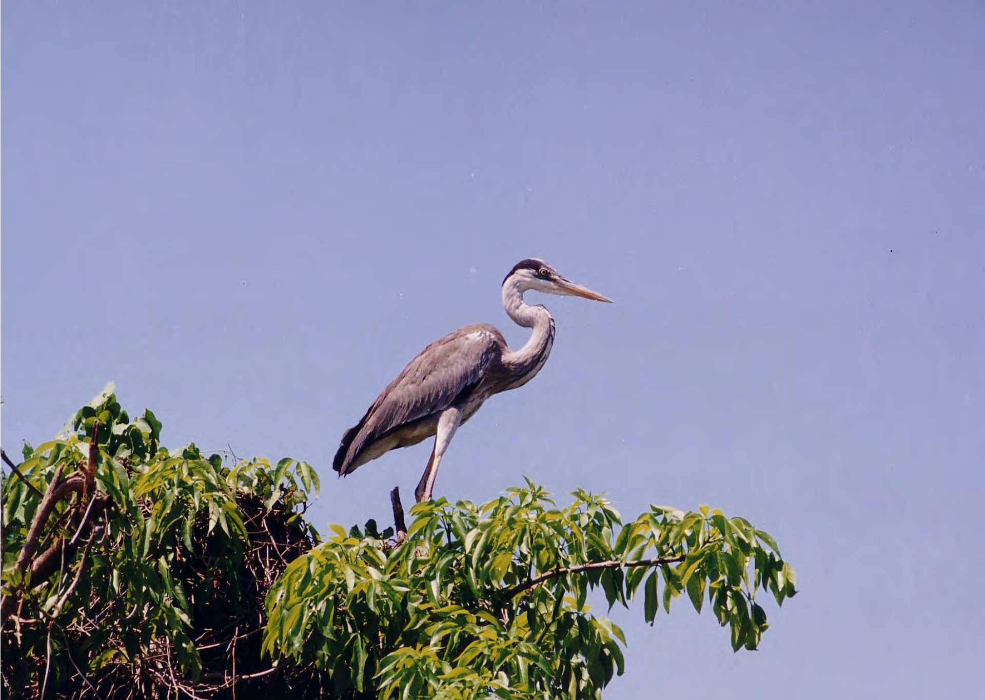
Cocoi Heron ( Ardea cocoi ) 코코이창로 黑冠白颈鹭