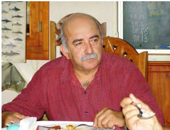
Governor of Alto Paraguay