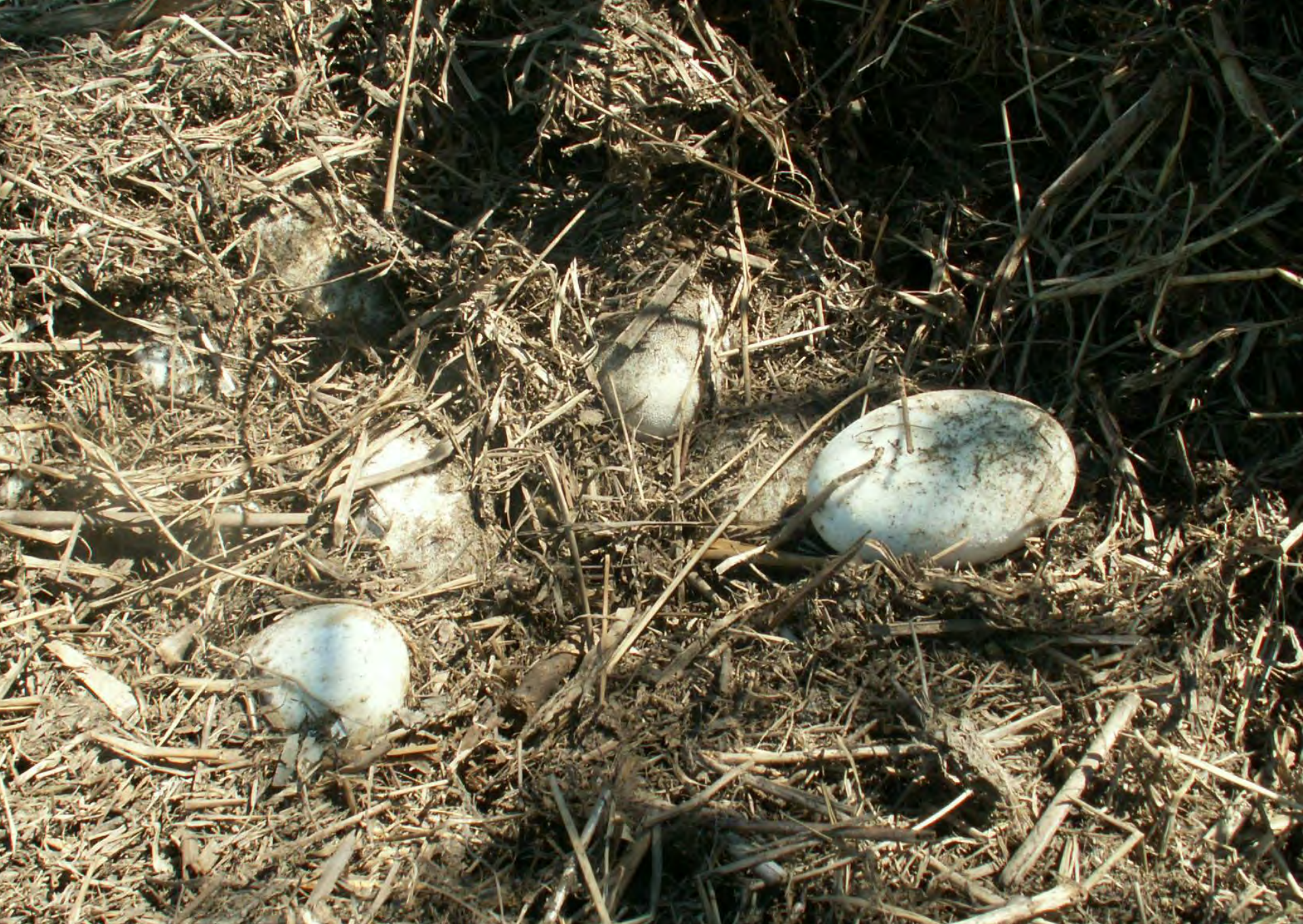
Eggs of Yacare Caiman ( Caiman yacare ) 야카레카이만 巴拉圭凱門鱷