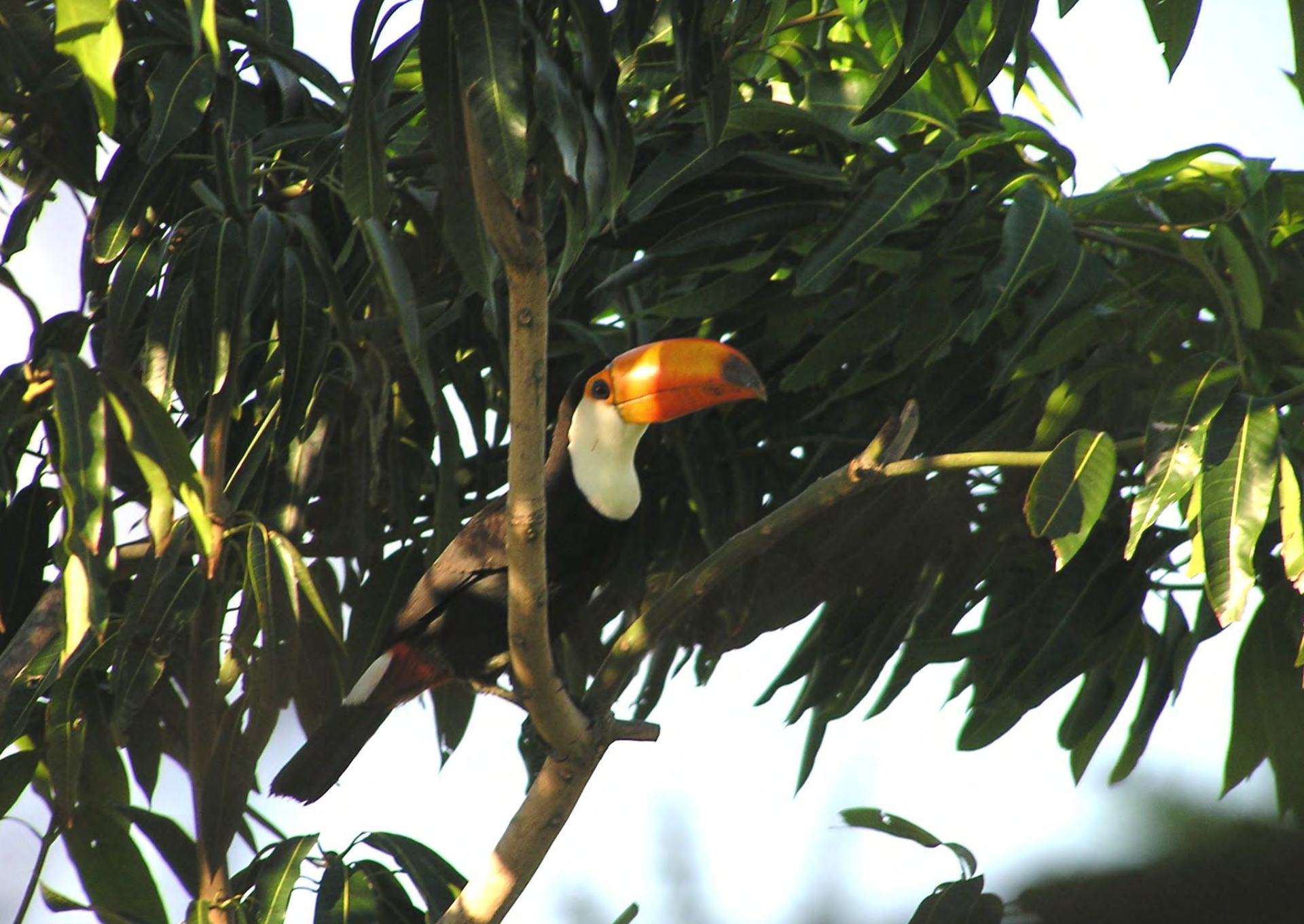
Toco Toucan ( Ramphastos toco ) 토코투칸 鸟托哥巨嘴