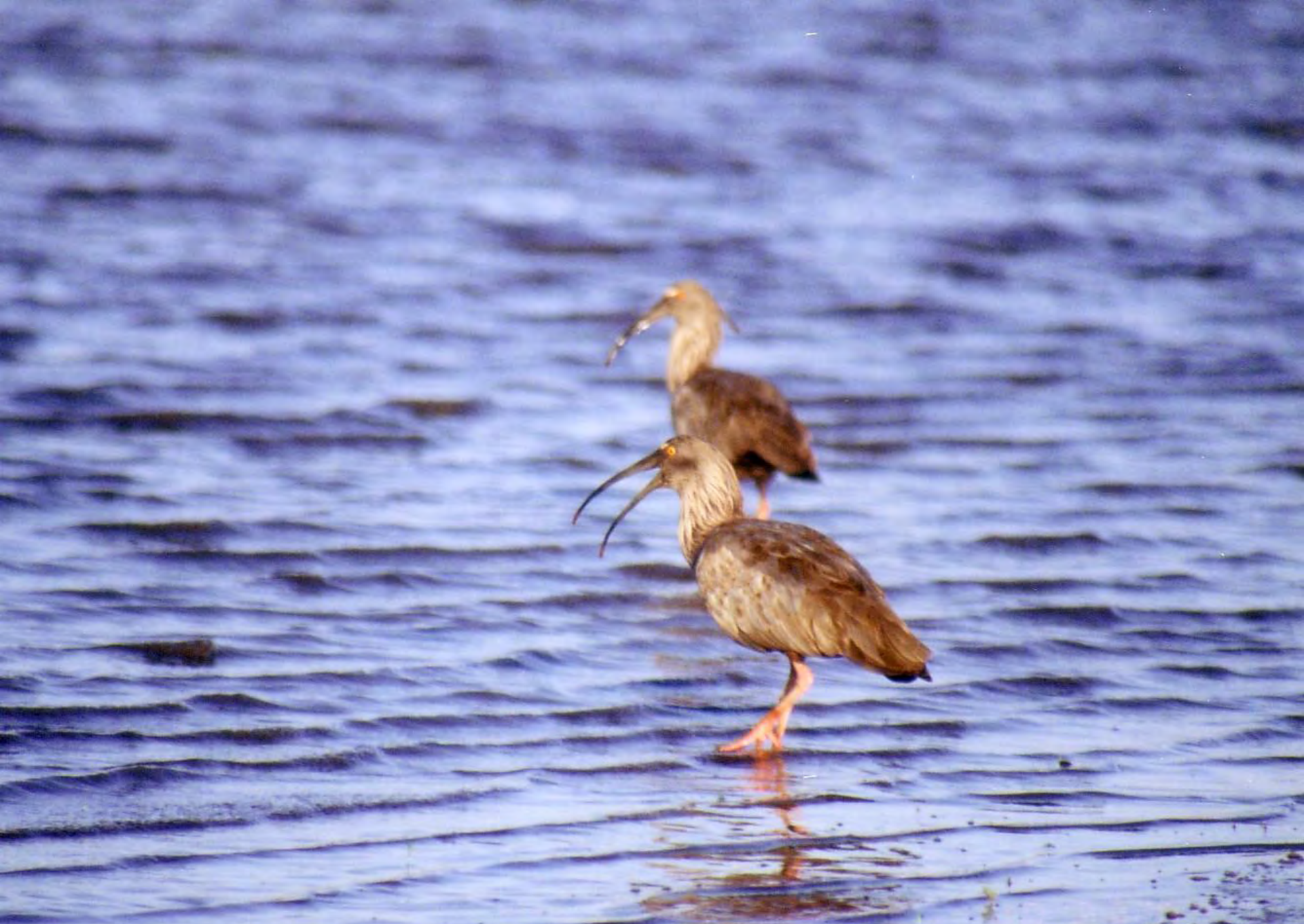
Plumbeous Ibis ( Theristicus caerulescens )