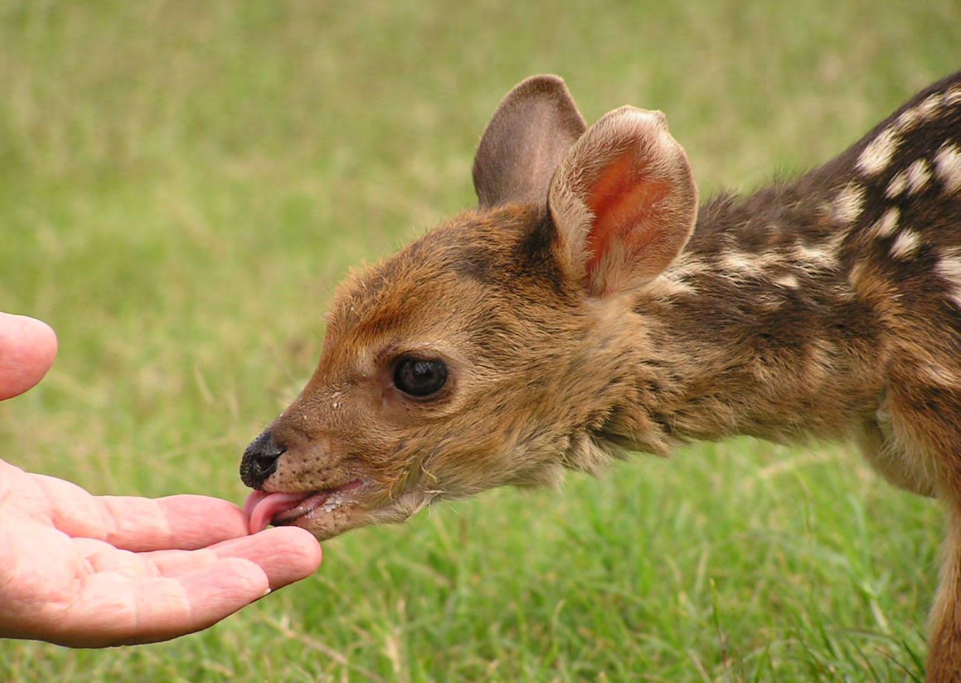
Kid of deer