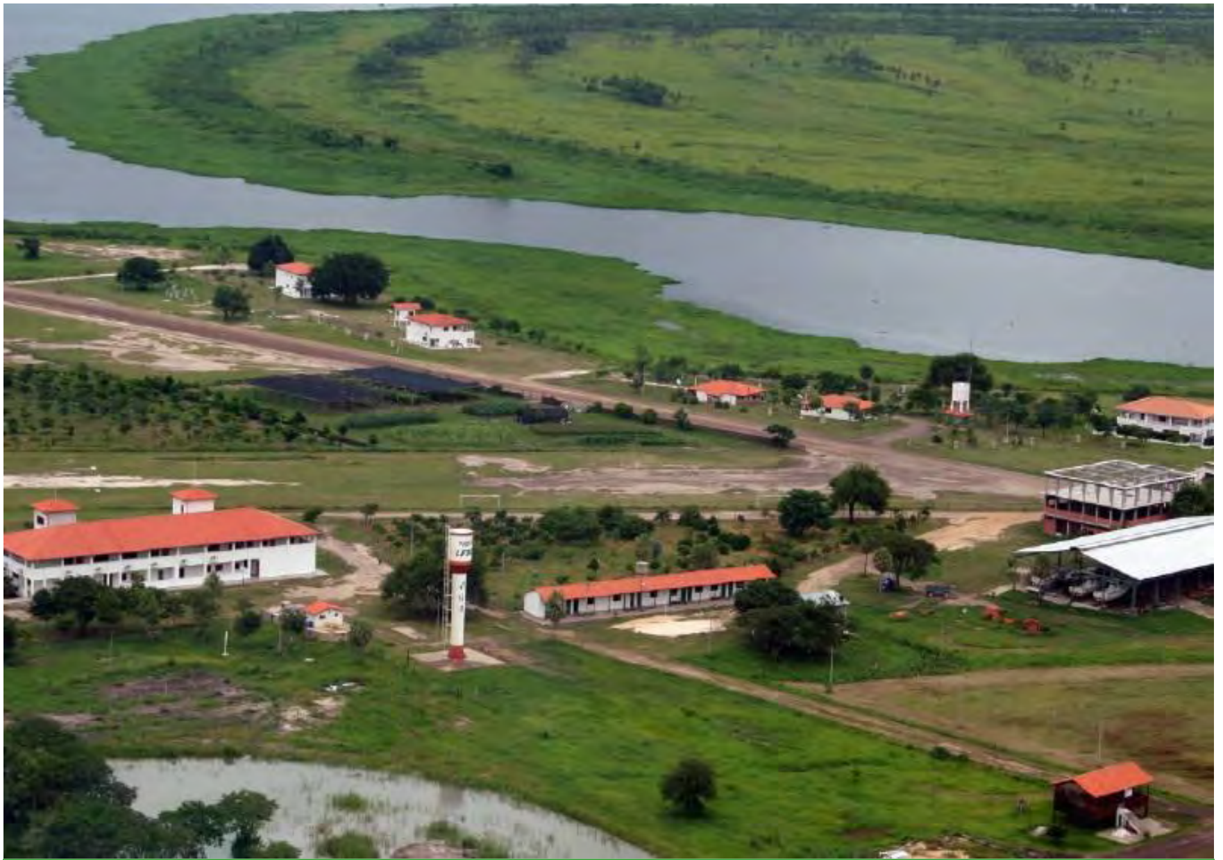
Panoramic view of Port Leda today