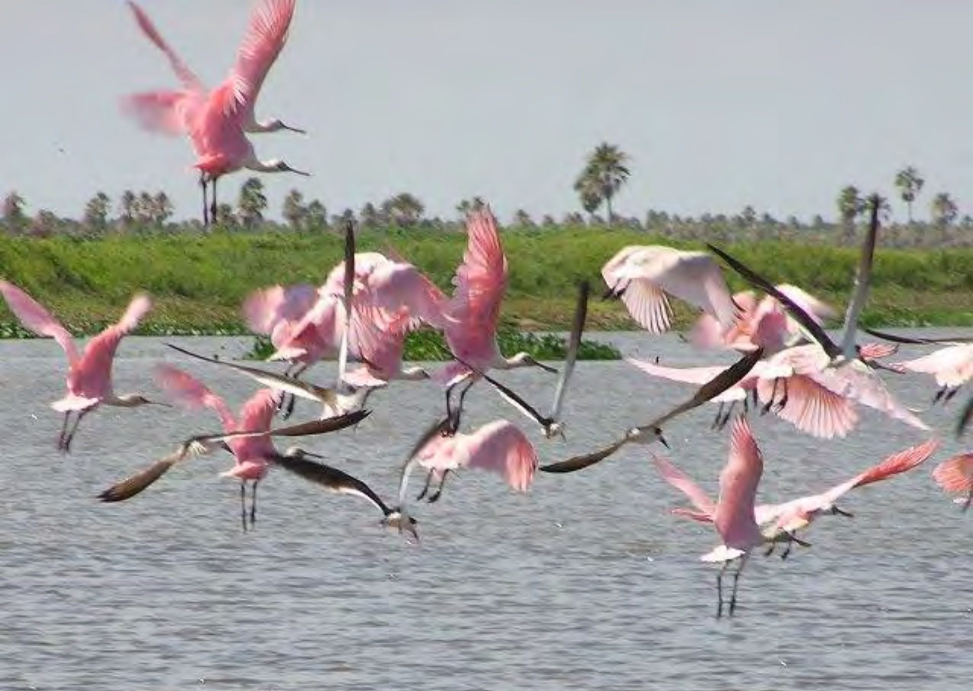
Roseate Spoonbill ( Ajaja ajaja ) 진홍저어새 玫瑰琵鹭