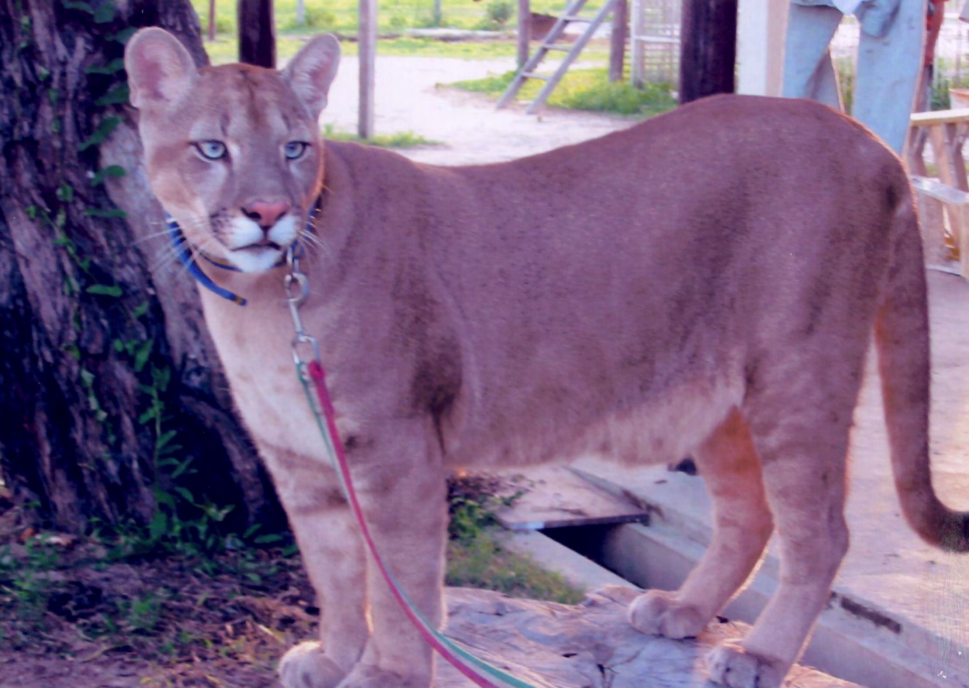
Puma also called Cougar ( Puma concolor ) 퓨마 美洲狮