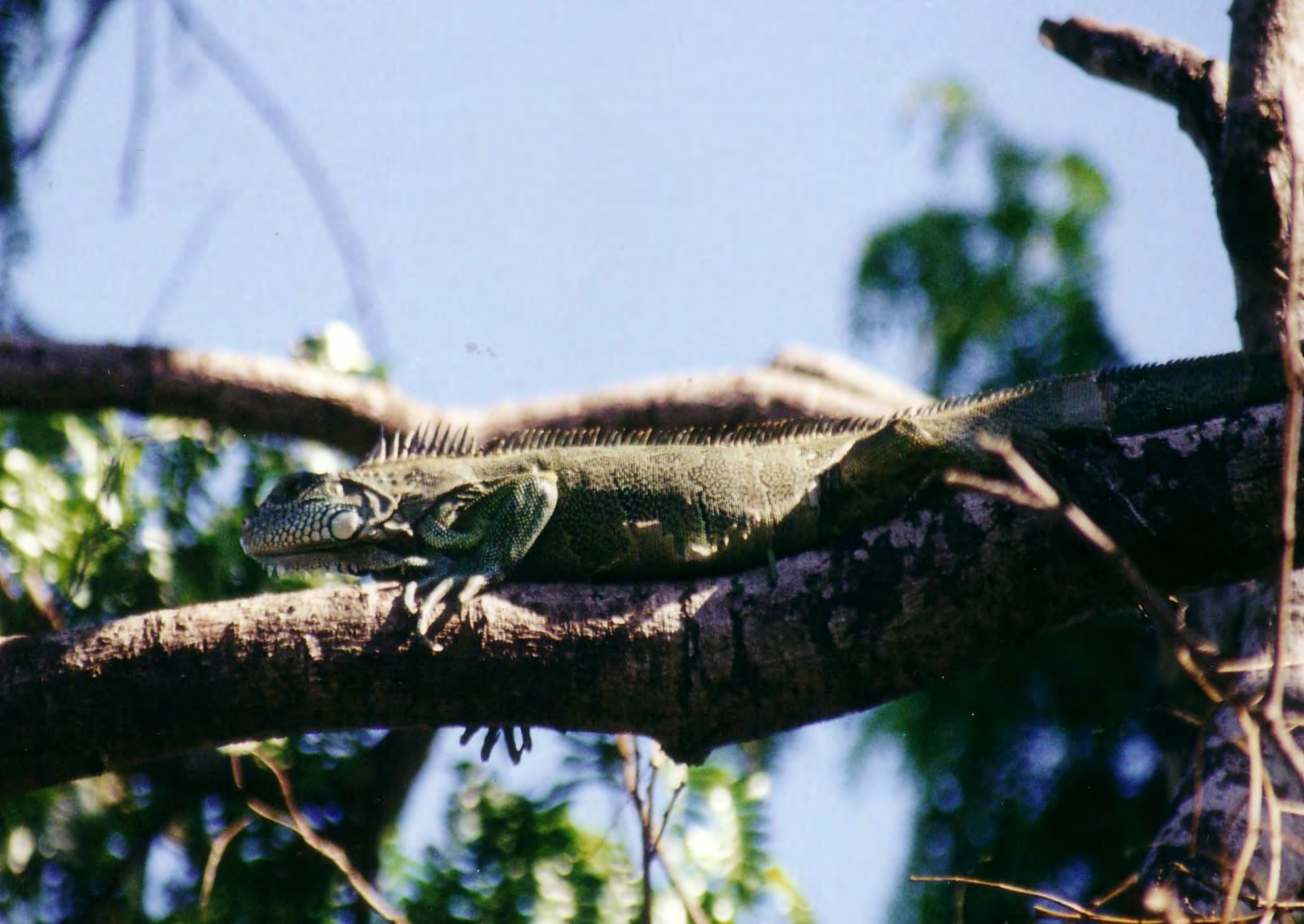
Iguana 이구아나 美洲鬣蜥