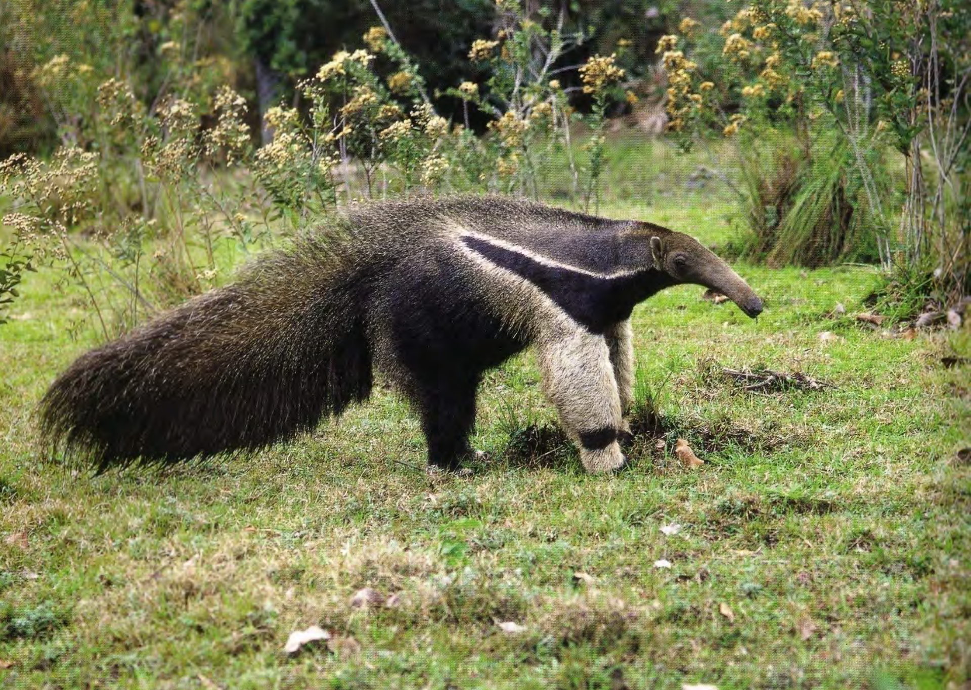
Giant anteater ( Myrmecophaga tridactyla ) 큰개미핥기 大食蟻獸