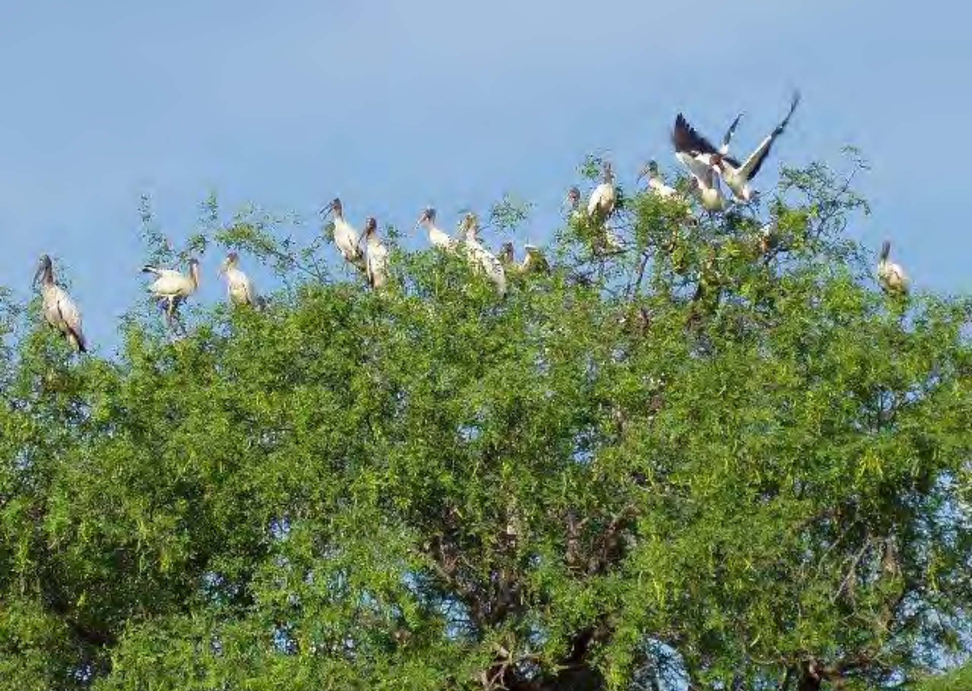
Wood Stork ( Mycteria americana ) 나무황새 林鶴