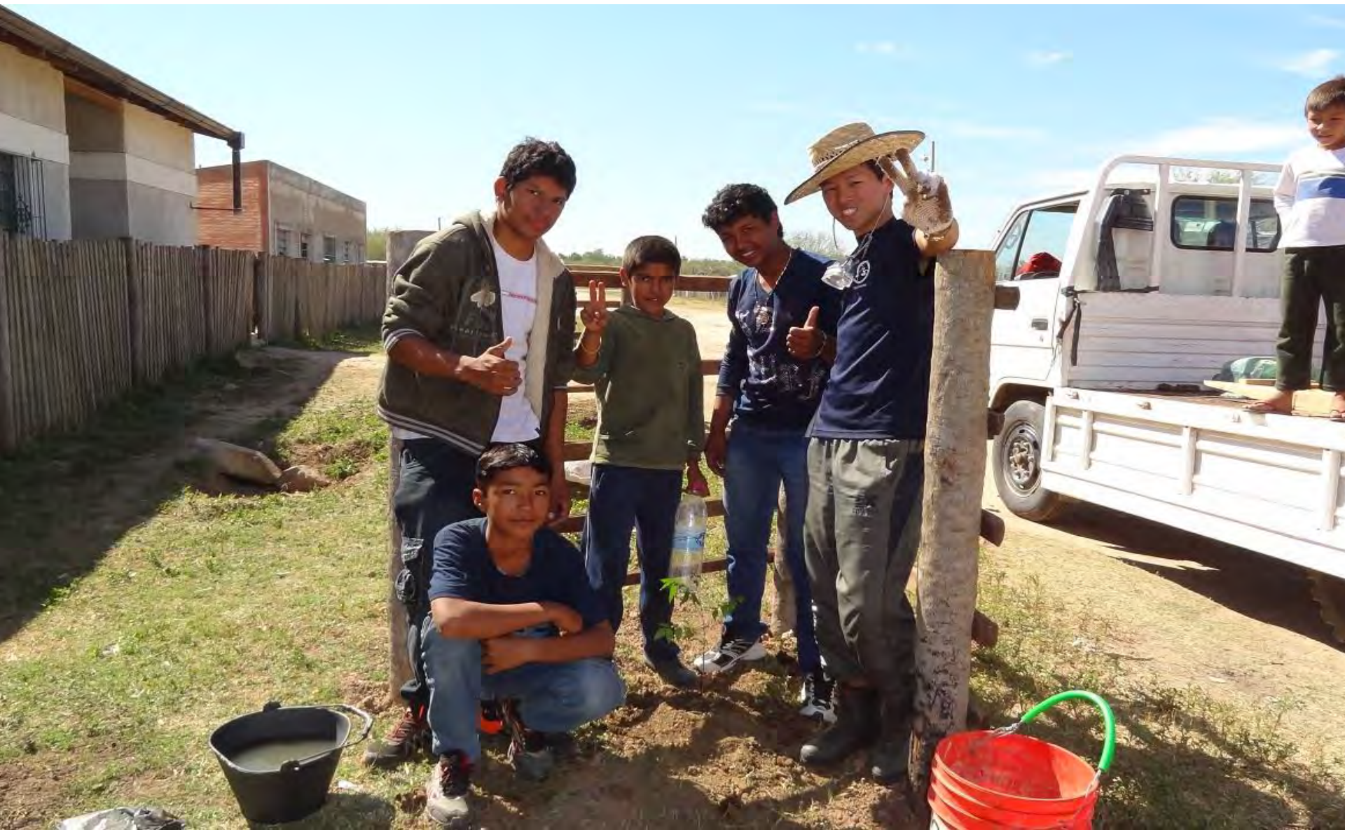
Planting trees along the street