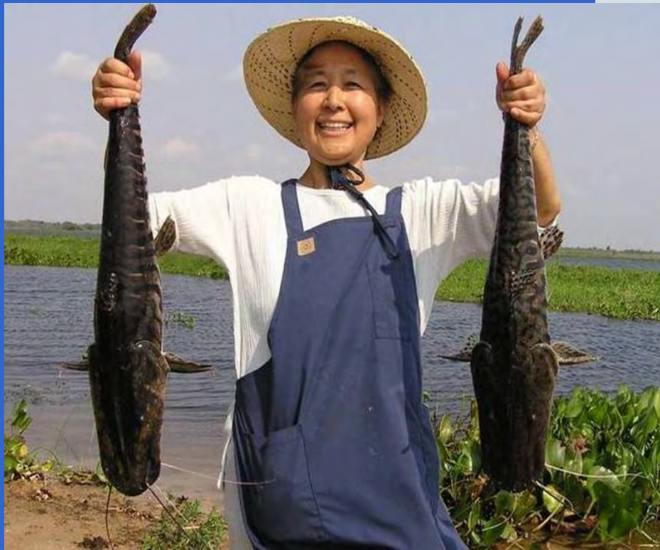
Surubi (tiger shovel-nose)