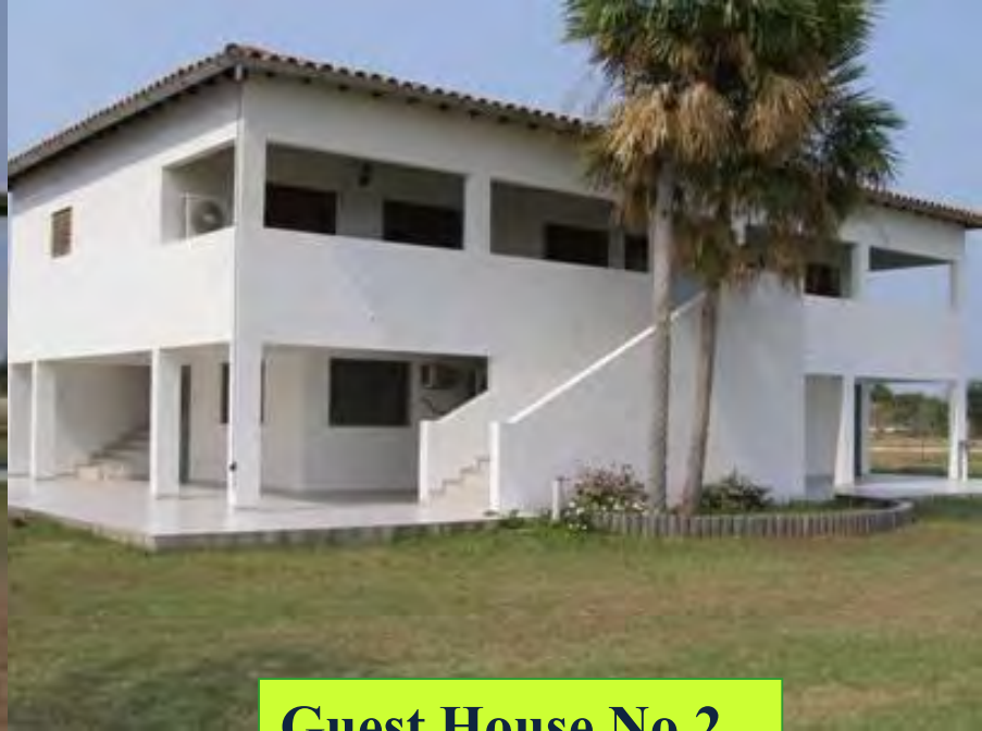
Guest House No.2