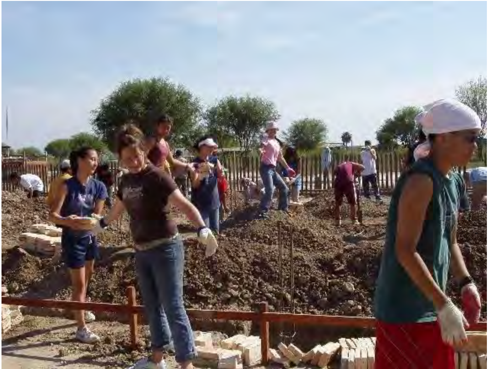
Volunteers serving for the construction of a school