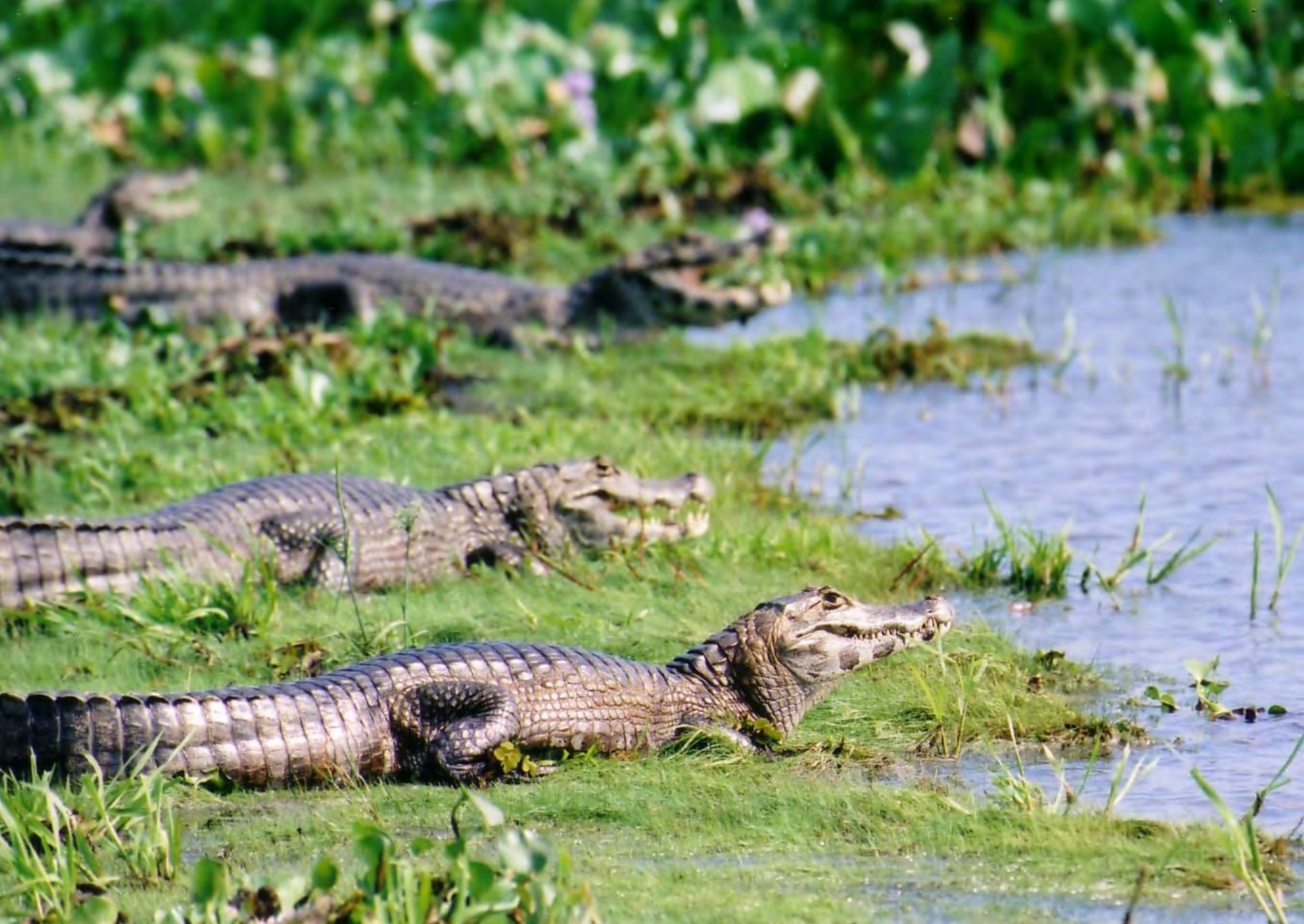
Yacare Caiman ( Caiman yacare ) 야카레카이만 巴拉圭凱門鱷