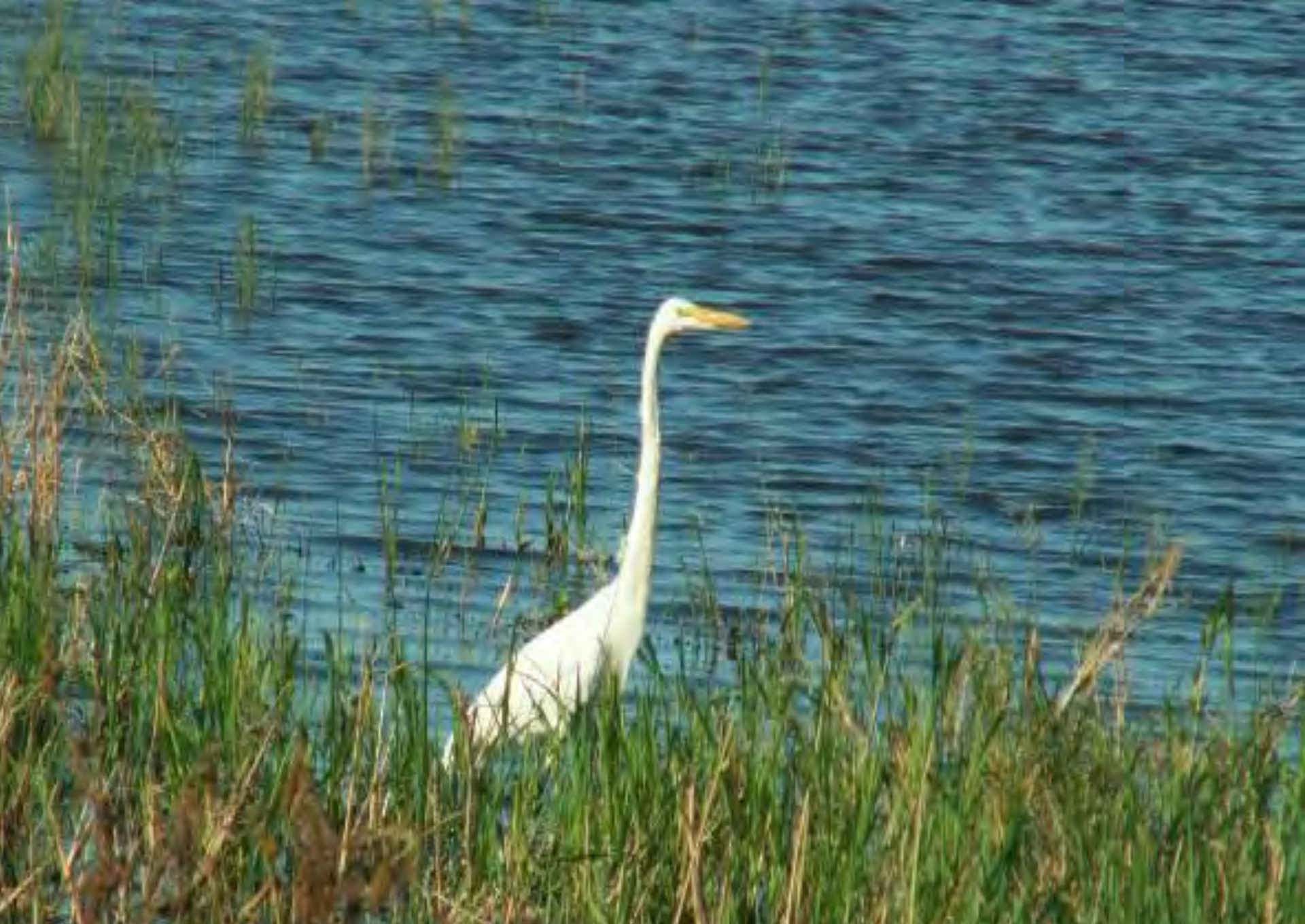
Great Egret ( Ardea alba ) 대백로 大白鷺