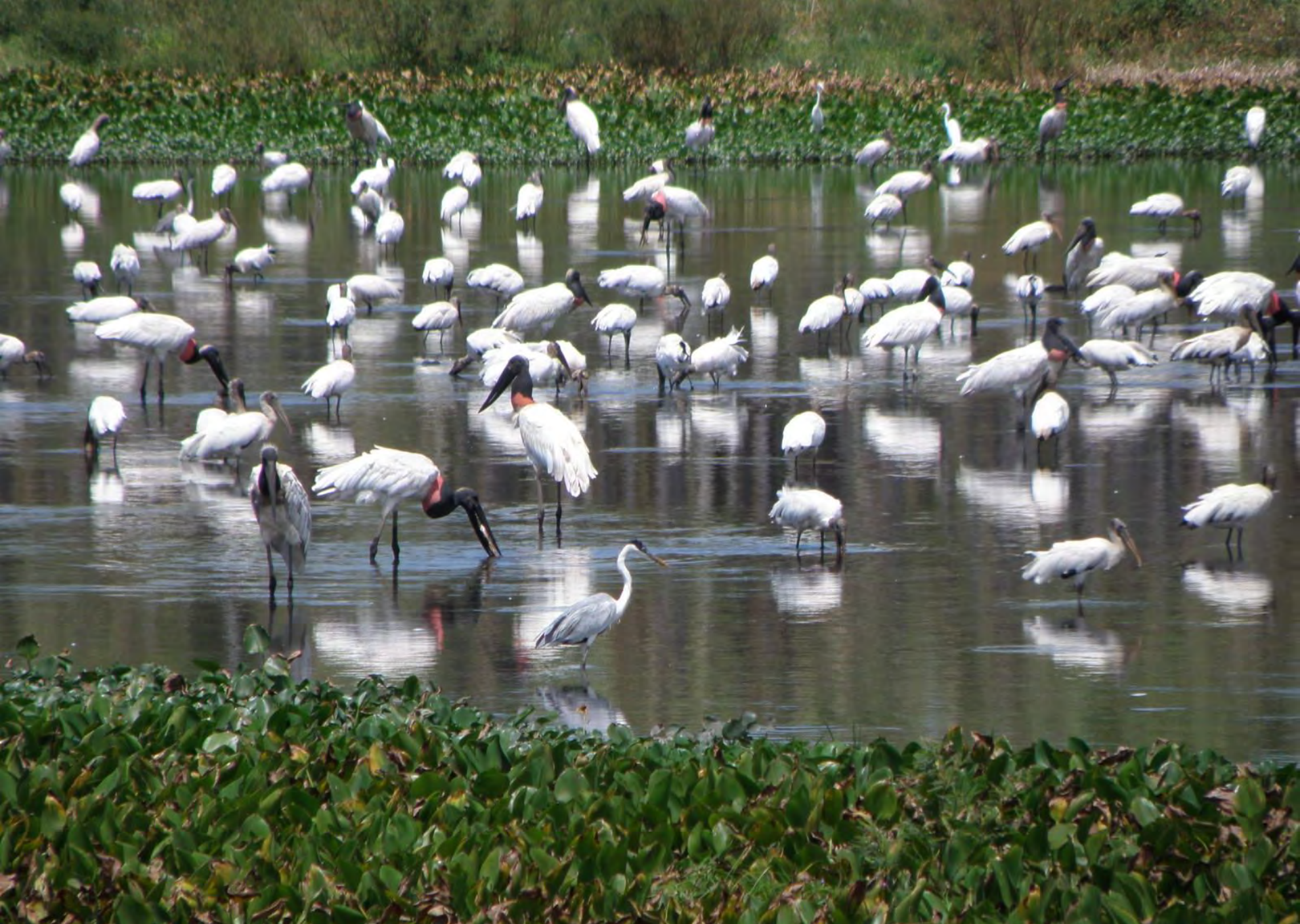
Jabiru ( Jabiru mycteria ) 투유유 裸頸鶴