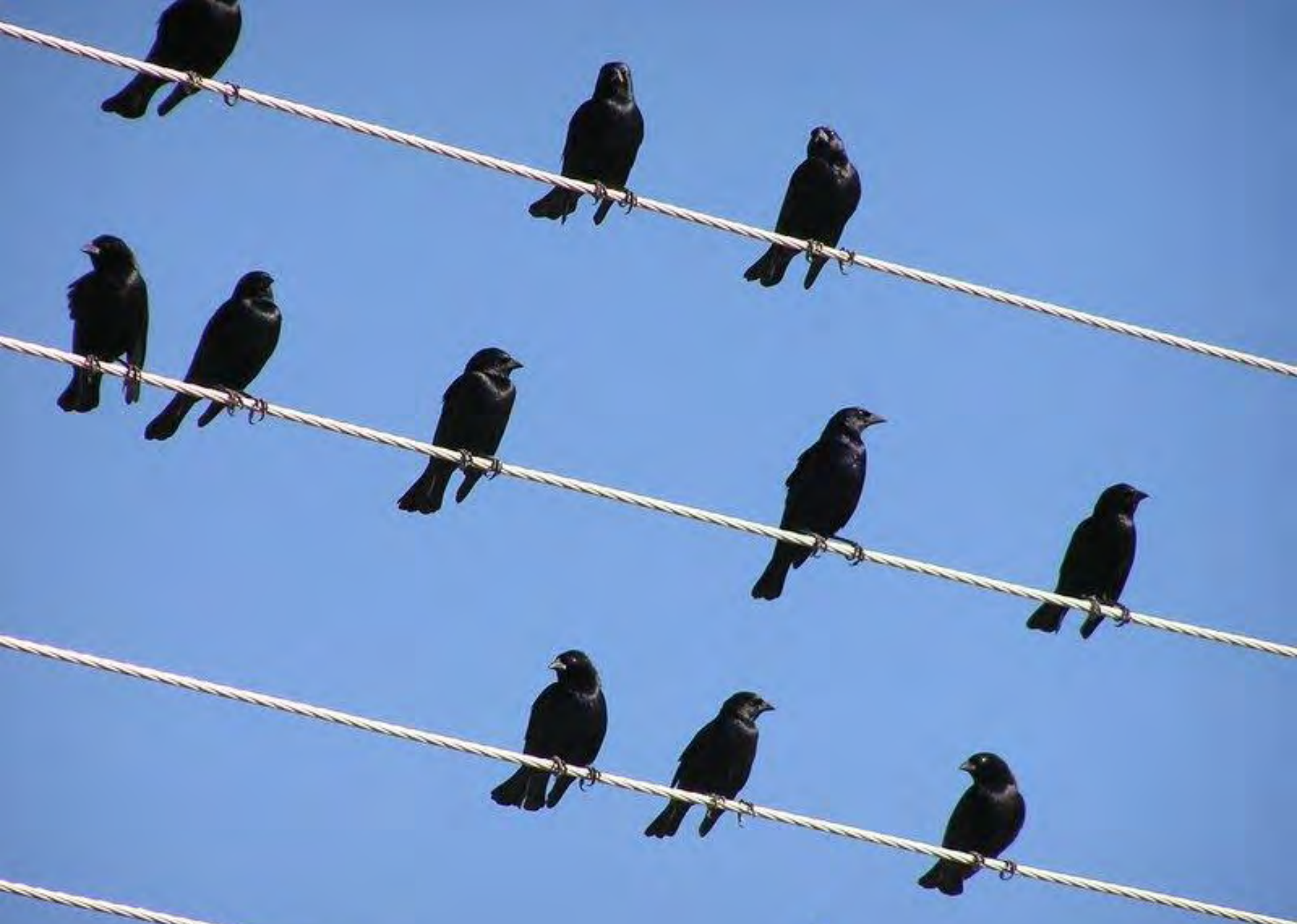
Chopi Blackbird ( Gnorimopsar chopi )