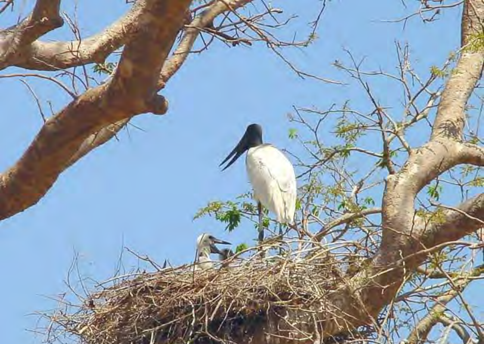
Jabiru ( Jabiru mycteria ) 투유유 裸頭鶴