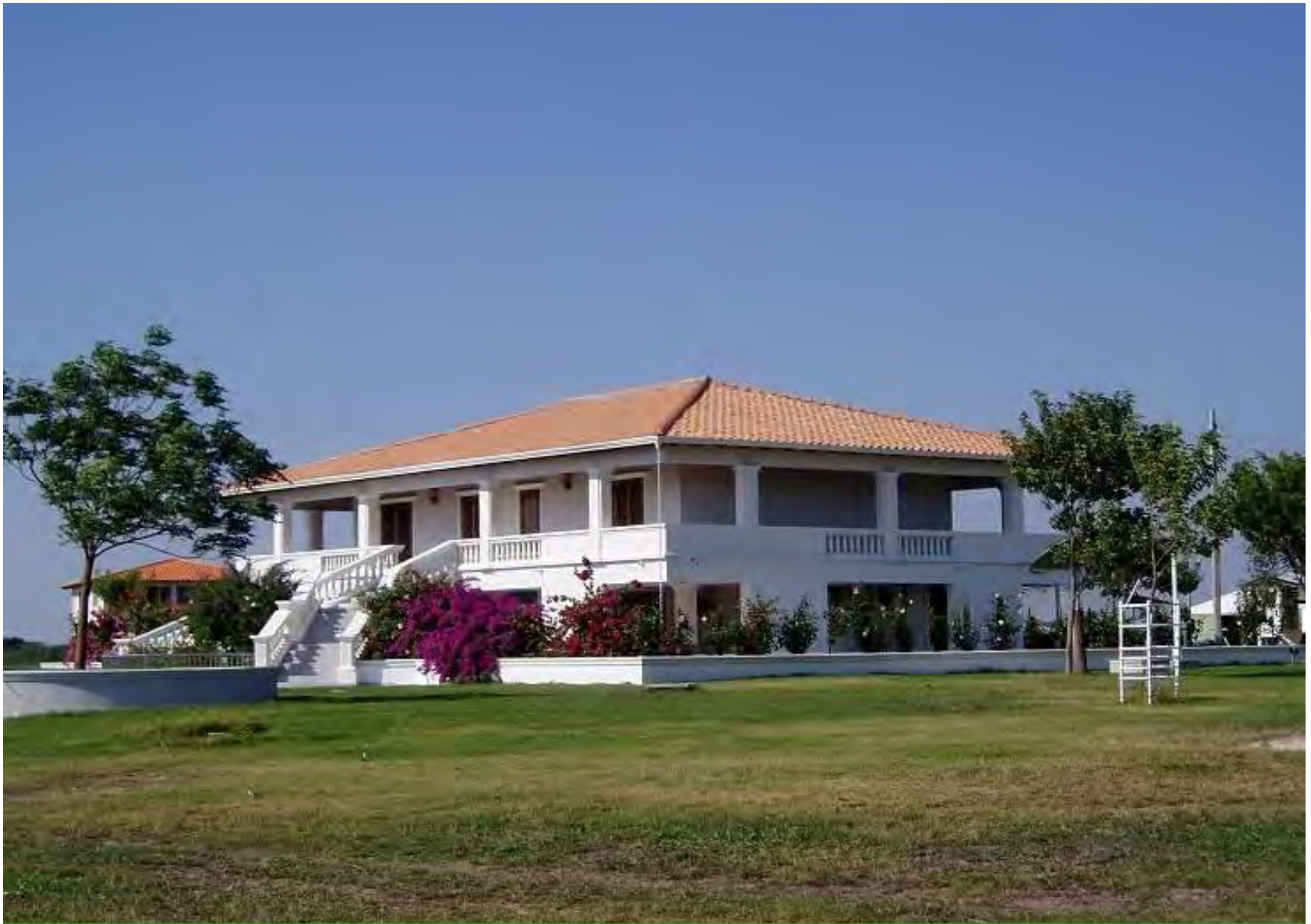
True Parents' House (公館=水一莊)