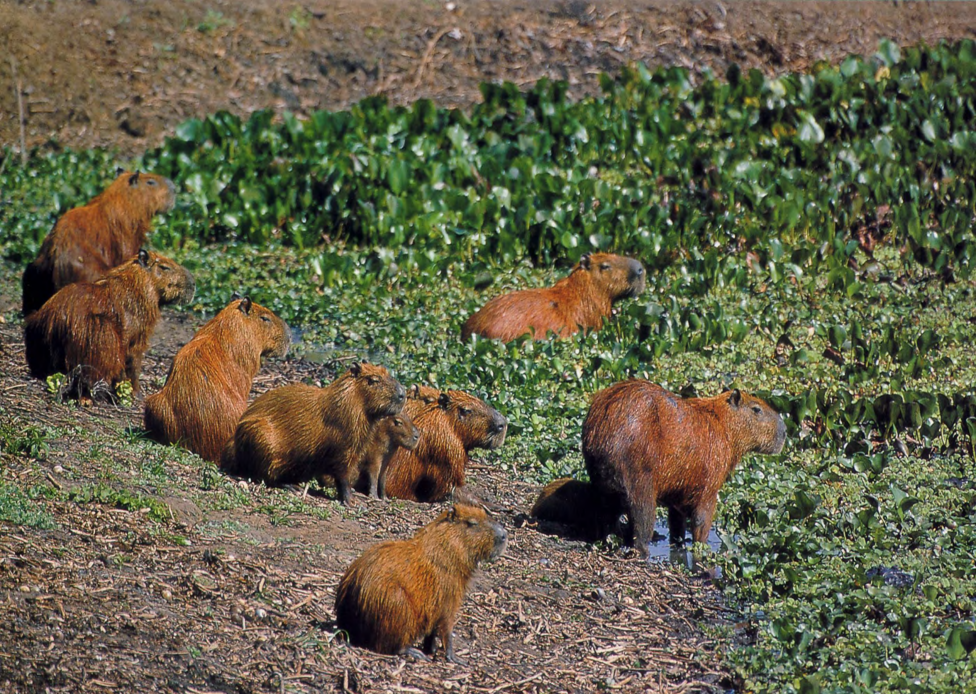
Family of capybaras 카피바라 水豚