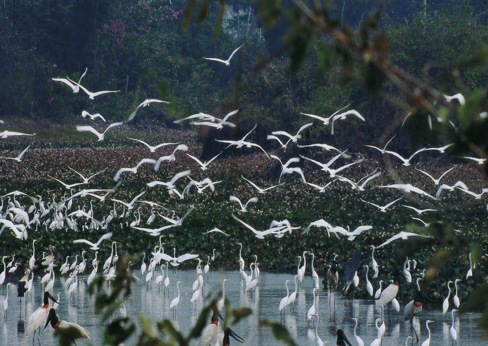
Great Egret ( Ardea alba ) 대백로 大白鹭