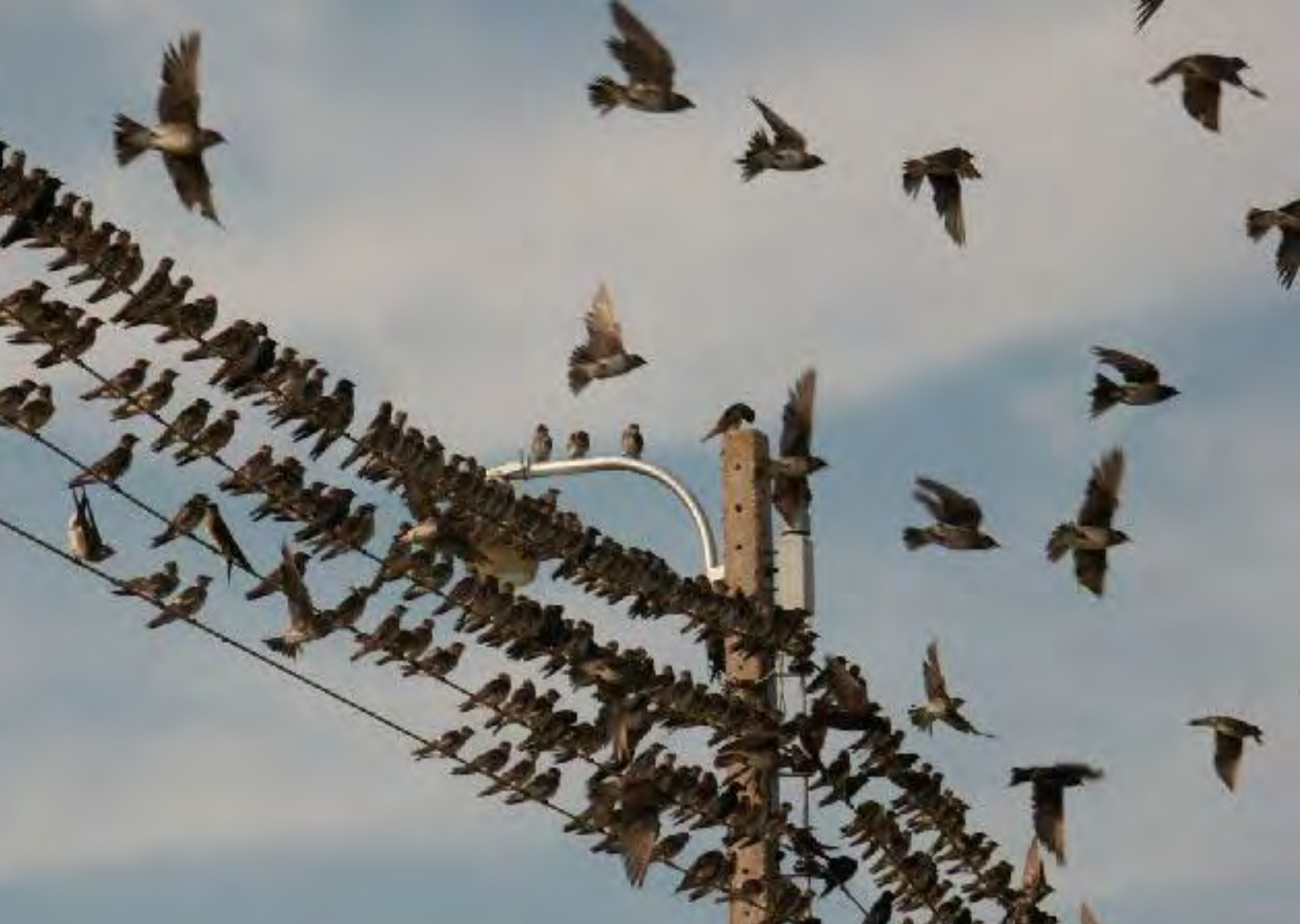
Brown-chested Martin ( Phaeoprogne tapera )