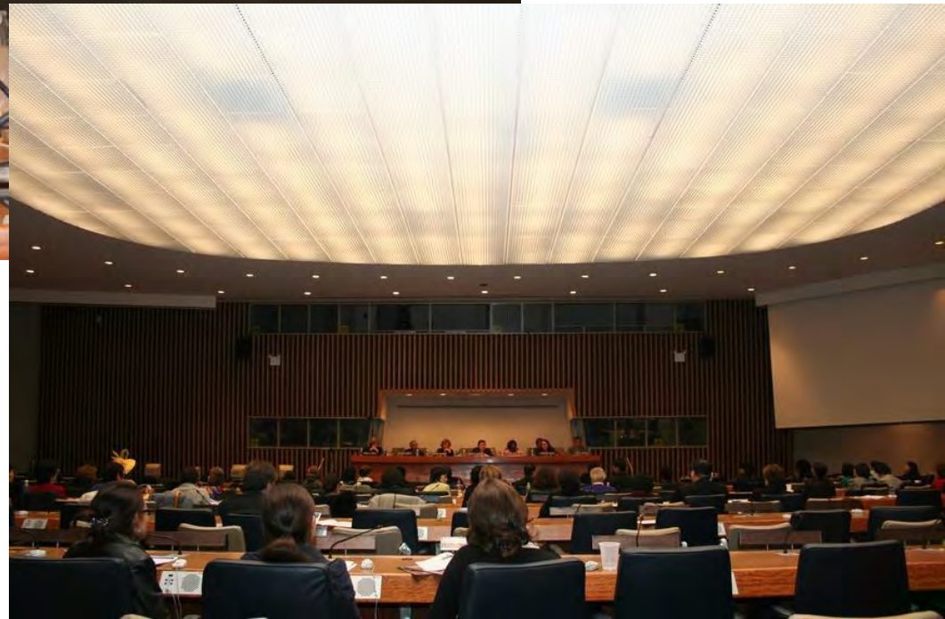
Presentation in the United Nations (Nov. 2008)