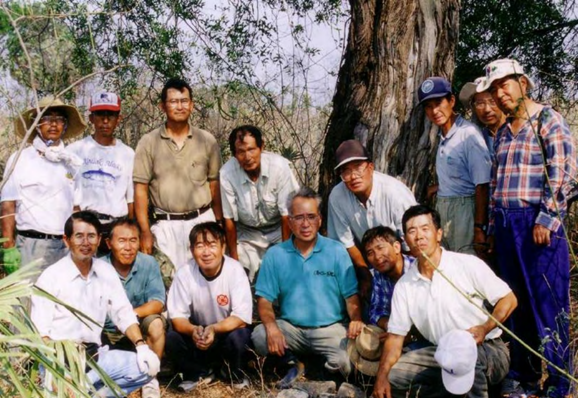
First pioneers' arrival (Oct.1, 1999)