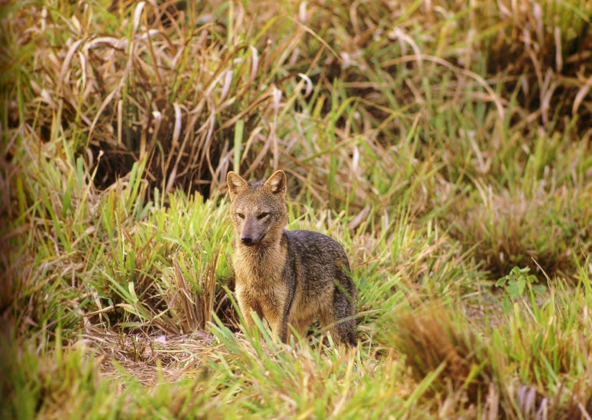
Pampas Fox ( Lycalopex gymnocercus ) 팜파스여우 河狐