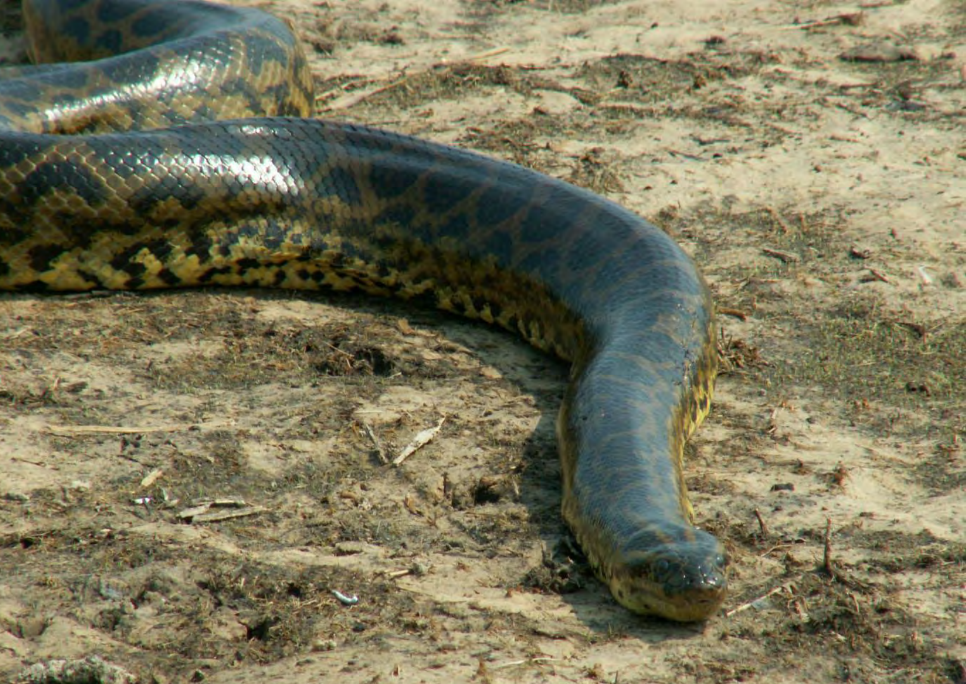
Anaconda ( Eunectes murinus ) 아나콘다 森蚺