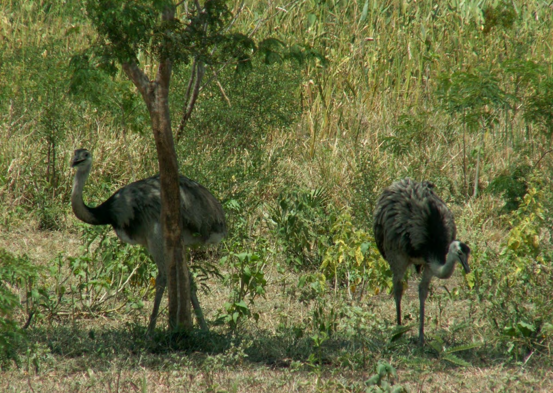
Greater Rhea ( Rhea americana ) 아메리카레아 美洲駝鳥