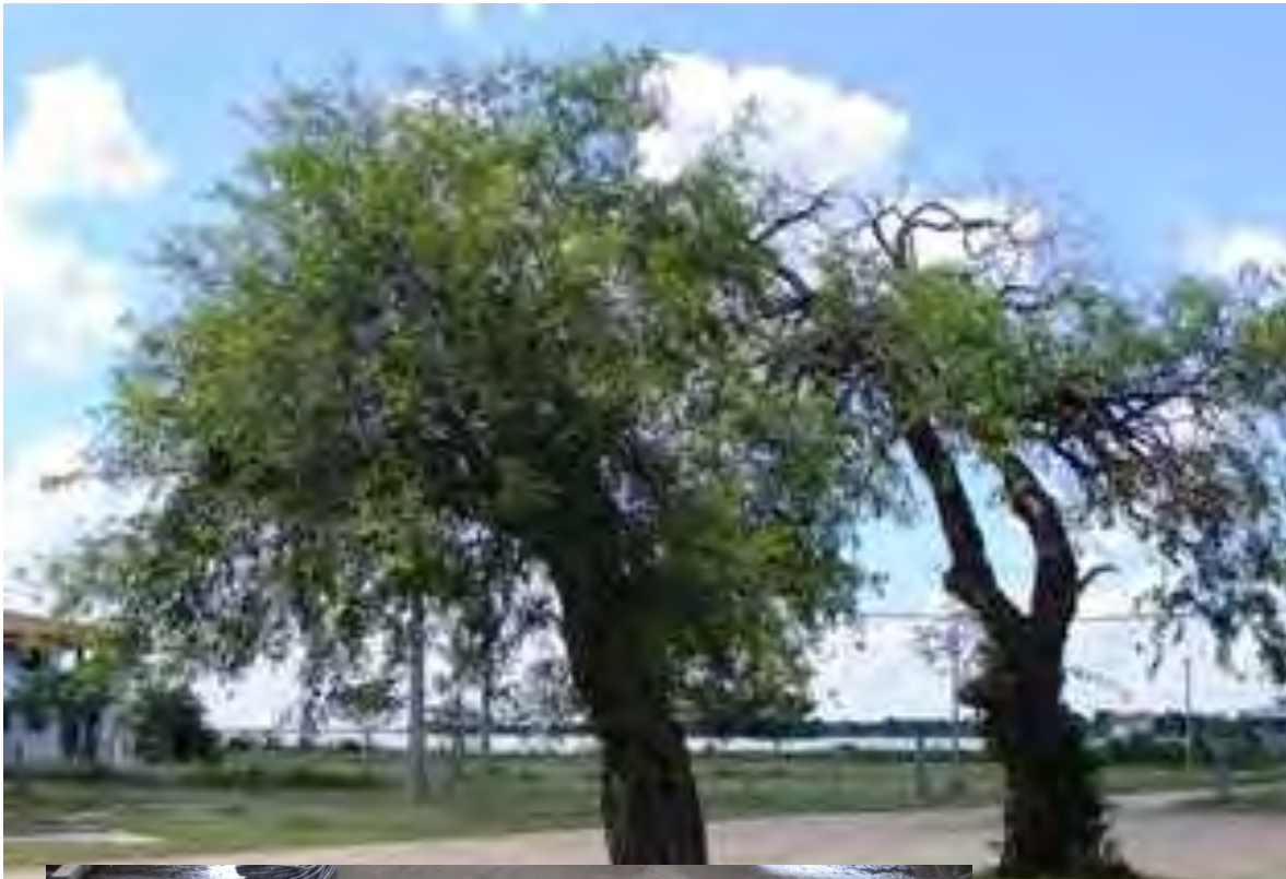
Algarrobo (honey mesquite)