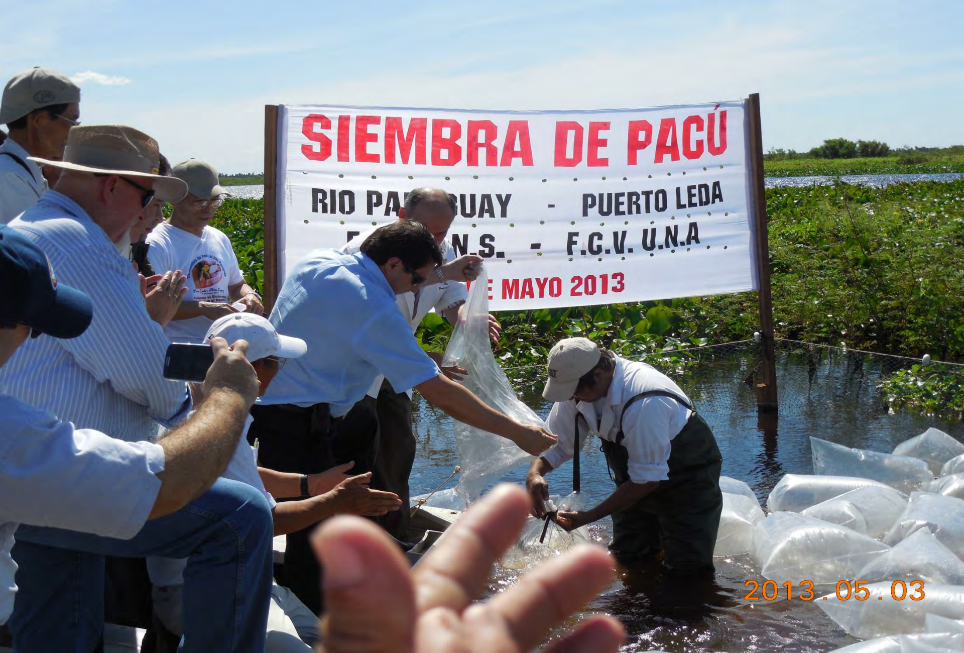
President of Paraguay plants fish. (2013)