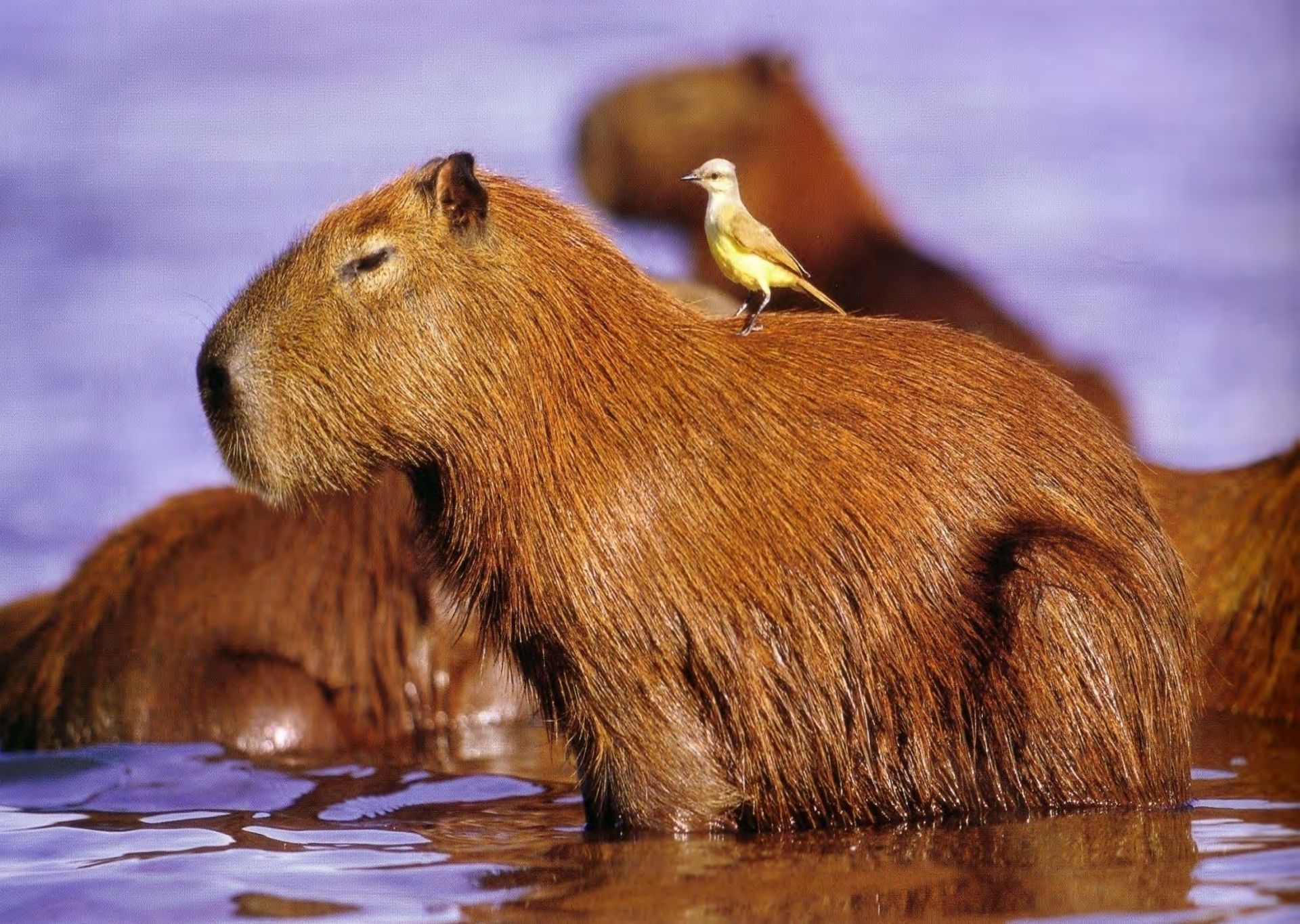
Capybara locally called Carpincho ( Hydrochoerus hydrochaeris ) 카피바라 水豚