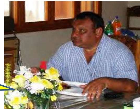
Mayor of the capital of province