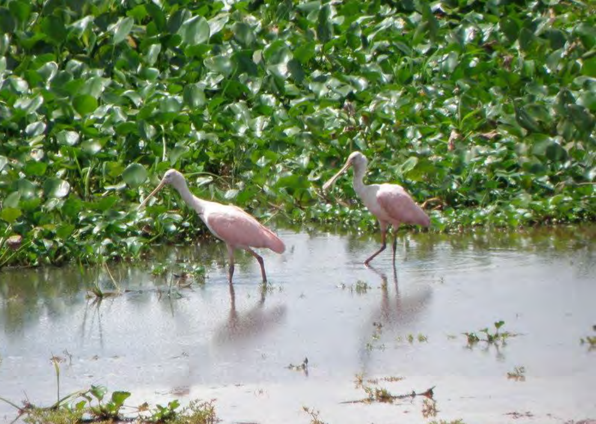
Roseate Spoonbill ( Ajaja ajaja ) 진홍저어새 玫瑰琵鷺