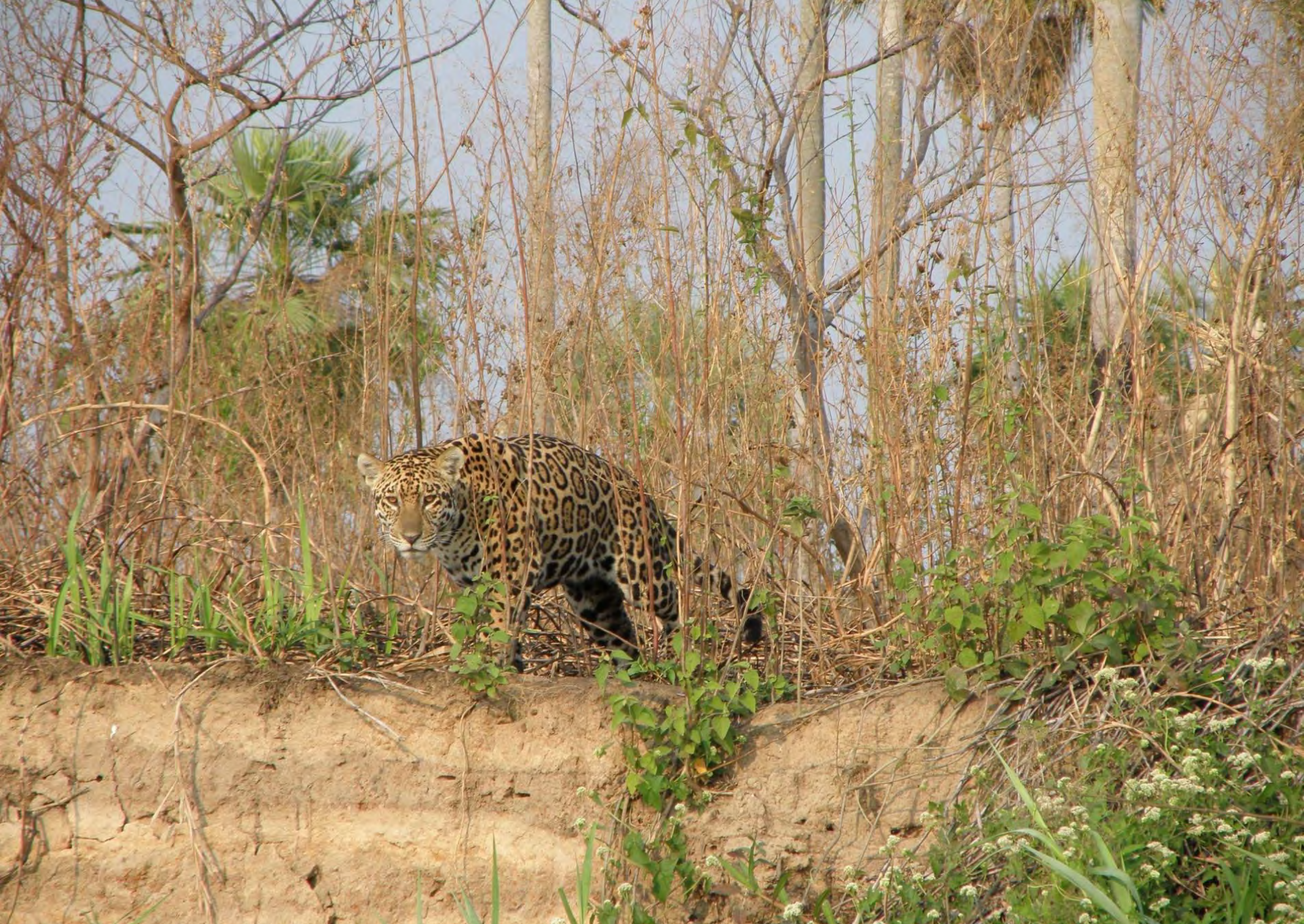
Jaguar ( Panthera onca ) 재규어 美洲豹