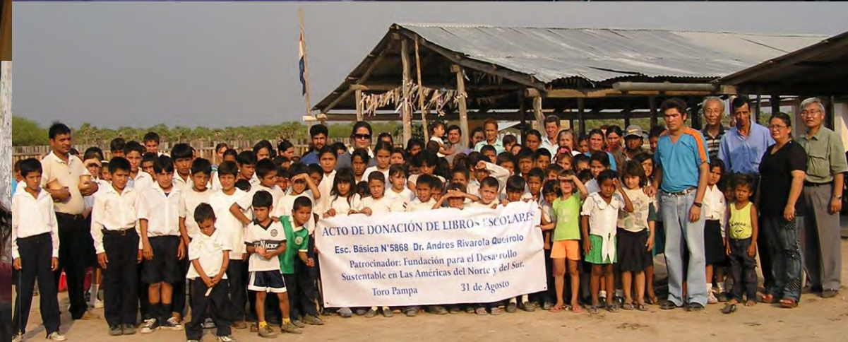
Donation of school textbooks and encyclopedias to local schools