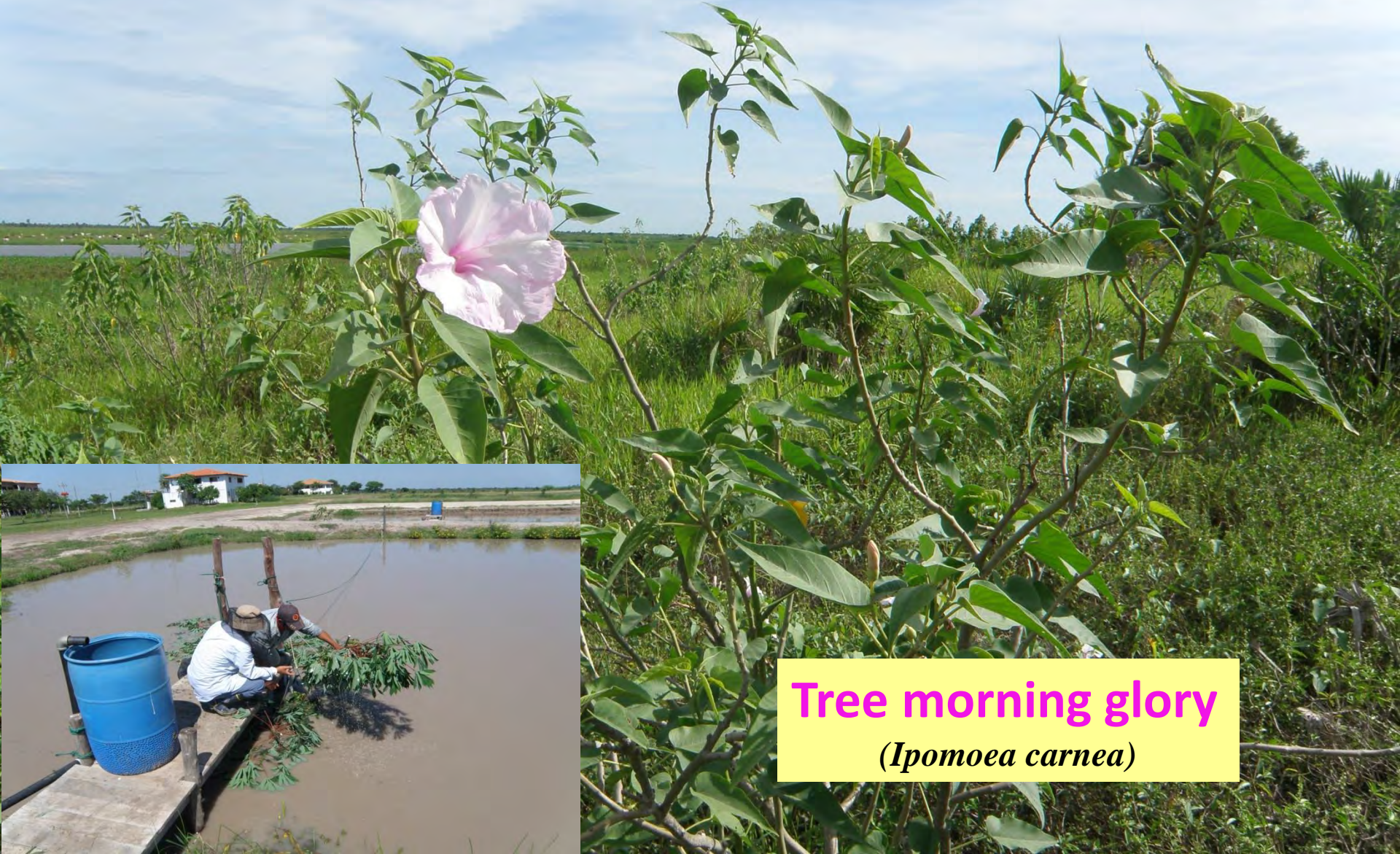
Tree morning glory ( Ipomoea carnea )