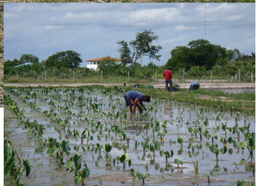
Cultivation in water