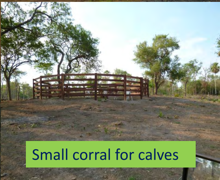
Small corral for calves