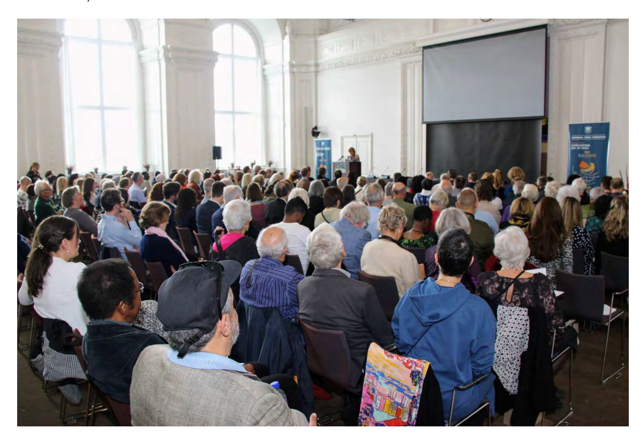
Copenhagen, Denmark -- The Danish parliament was the setting for the UPF commemoration of International Day of Peace 2022.

Over 200 leaders, Ambassadors for Peace, and peace activists attended the event on October 9, which was held under the 2022 theme, "End Racism. Build Peace."