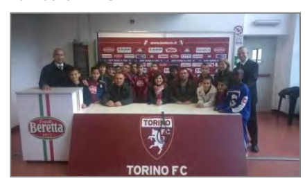
Visiting the Olympic Stadium, in the press room

Next was a visit to the sport museum at the Olympic stadium, followed by a special soccer tournament organized by the youth department of Torino FC, named CIT TURIN.