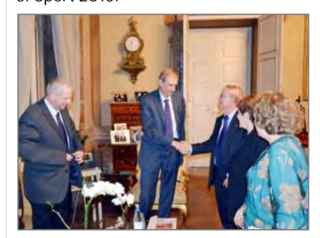
Courtesy Call in the Mayor's Cabinet – The delegation with Hon. Dr. Piero Fassino (22 September 2014)

The first act of this project was played last September 22nd when I decided to meet the Mayor of Turin with a small delegation from Israel composed, among others, of Dr. Hod Ben Zvi and Dr. Glaubach, from UPF Israel and Giorgio Gasperoni, UPF San Marino. It was decided in that moment to present the project to the Mayor who immediately accepted to sponsor the idea, considering also that Turin had been chosen as the European Capital of Sport 2015.