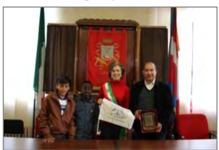
With the Mayor Chiara Borgis