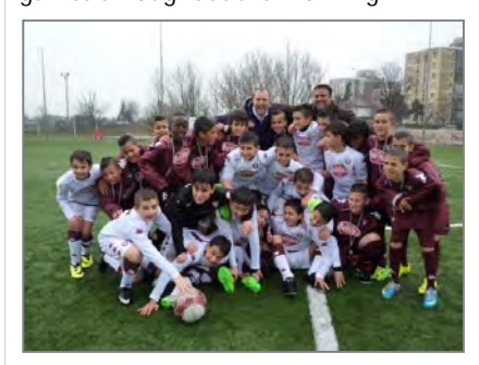
The Peace Dreamers with the children of Torino FC

were trained players in the club. The rain was pouring however it didn't prevent them from conducting friendly games throughout the morning.