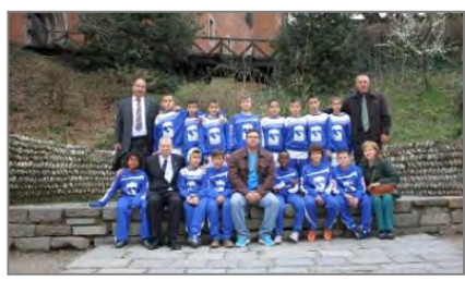
Medieval village - Park of Valentino

The Municipality of Turin offered the bus for transportation during the 8 days of the project, the free entrance at the National Automobile Museum, the National Cinema Museum and the National Sports Museum, including the visit to and use of the press room of the Olympic Stadium of Turin and played the main role for both hospitality and meeting with the management of the Juventus FC.