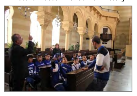
Turin\ Sinagogue-Main\ Temple

Right after, we visited the Jewish highly secure area. The community embraced the kids on short notice, providing lunch which was followed by a spontaneous soccer game with almost the entire school... The visit concluded with going through the impressive synagogue that serves as a miniature museum for Jewish history.