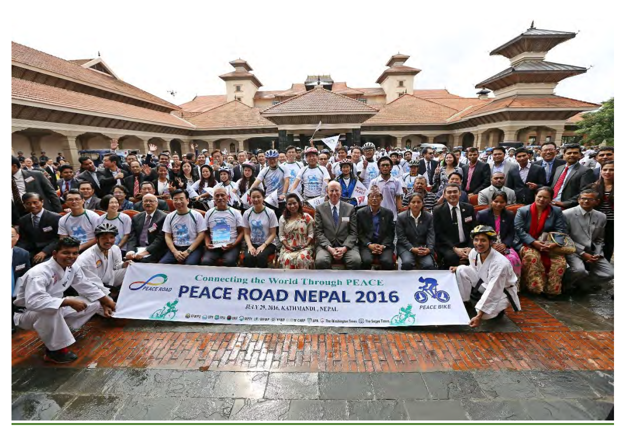
Peace Road 2016 in Nepal (July 29, 2016)