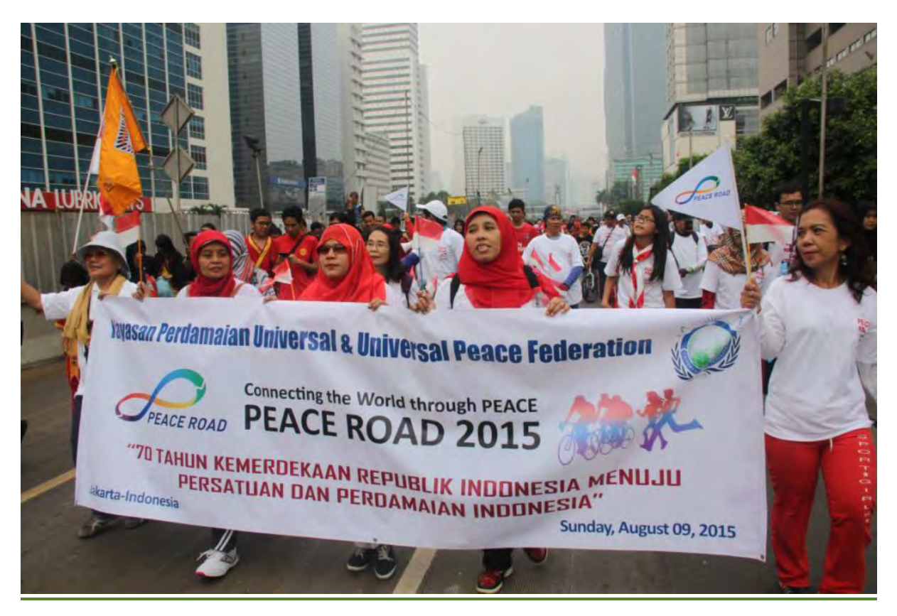
Peace Road 2015 in Indonesia (August 9, 2015)

We earnestly hope that with each step we take, more people can join us and be hopeful. Then, that earnest desire for peace amongst people can go beyond just hope and become reality.