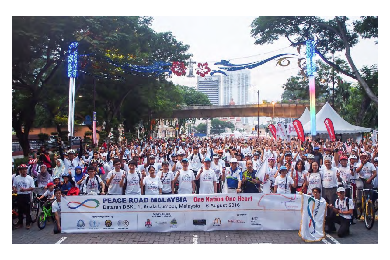
Peace Road 2016 in Malaysia (August 6, 2016)