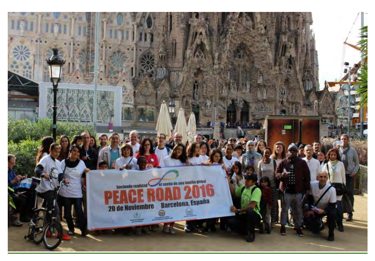
Peace Road 2016 in Spain (November 20, 2016)