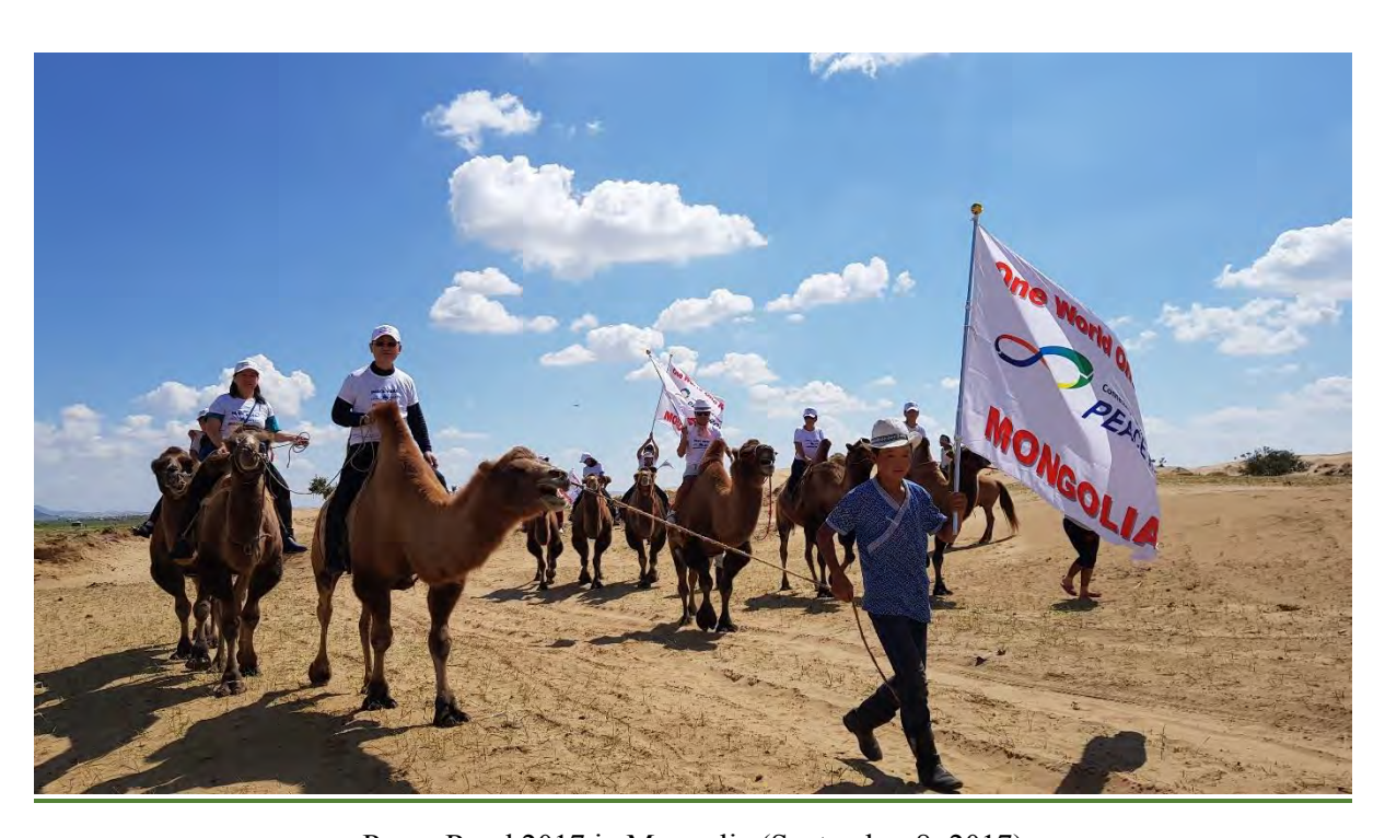
Peace Road 2017 in Mongolia (September 8, 2017)