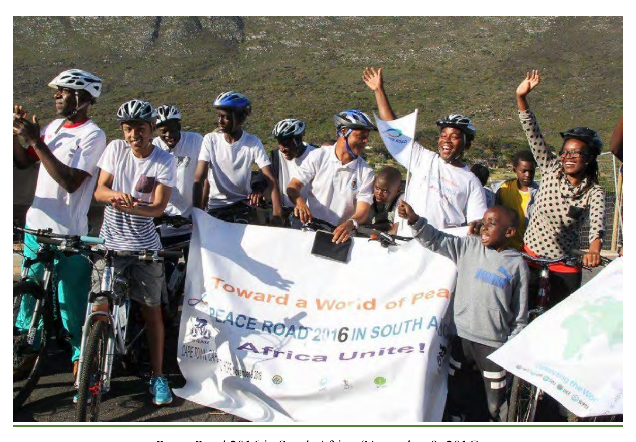
Peace Road 2016 in South Africa (November 9, 2016)