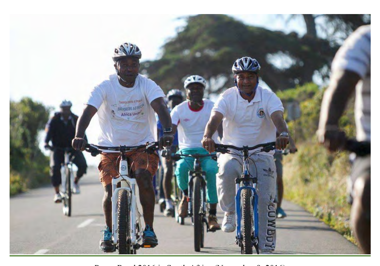
Peace Road 2016 in South Africa (November 9, 2016)