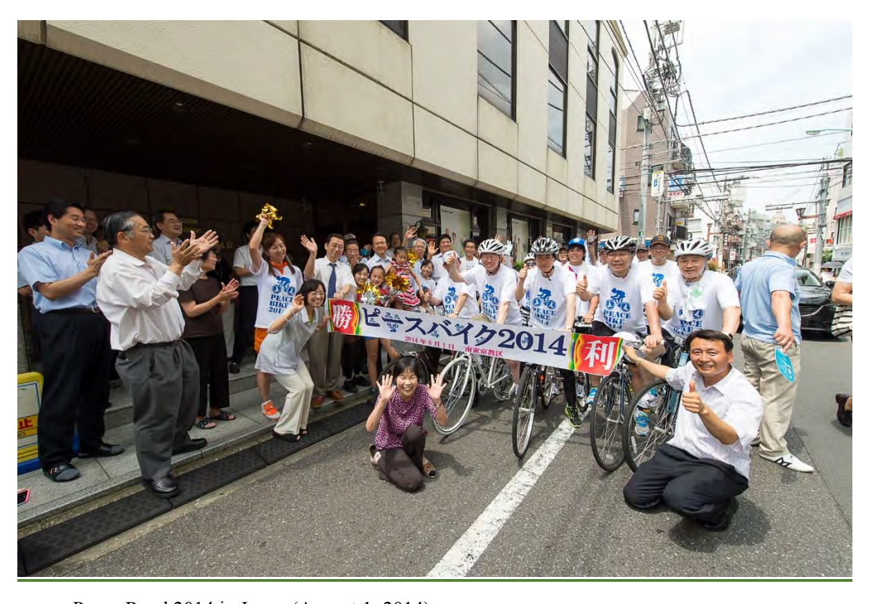
Peace Road 2014 in Japan (August 1, 2014)