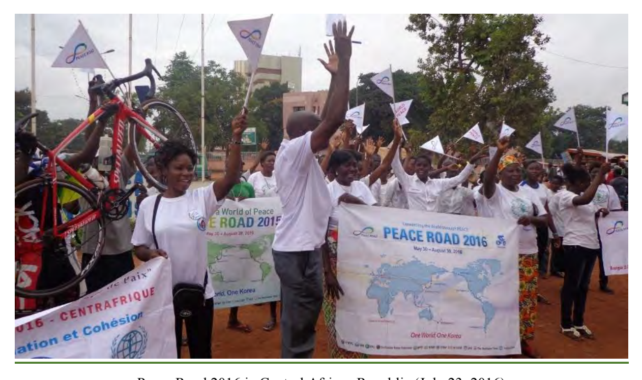
Peace Road 2016 in Central African Republic (July 23, 2016)