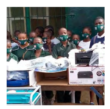
Peace Hana School in Liberia thanks WFWP USA donors for support Read More →