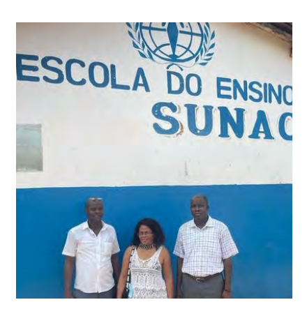
WFWP Maine Chapter Takes Initiative to Support School in Guinea-Bissau