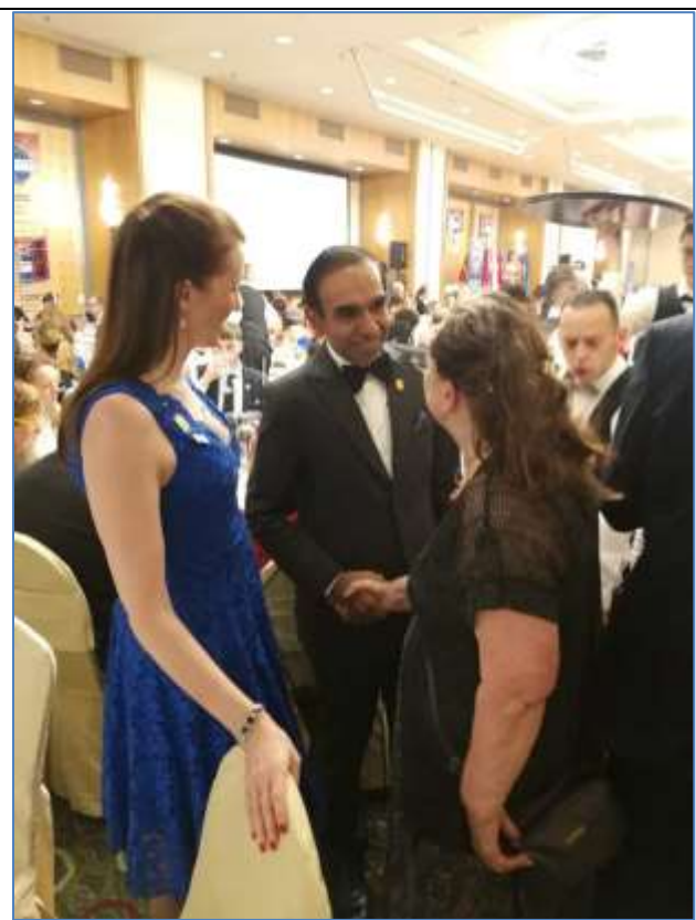
I met the international president of Toastmasters.