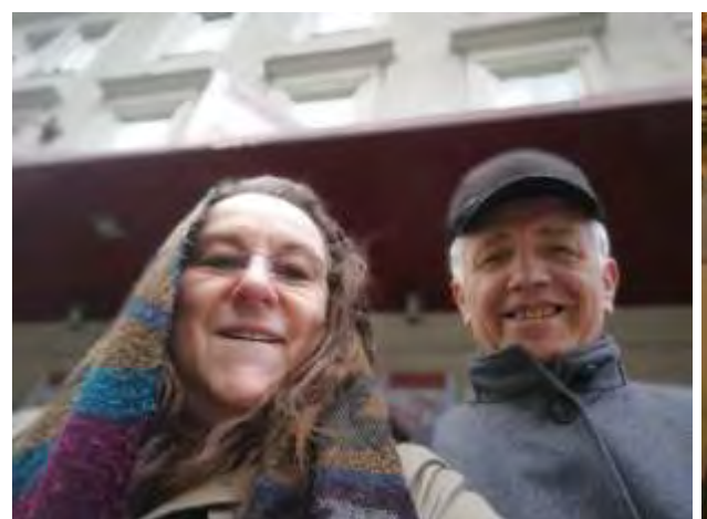
Baby it's cold outside