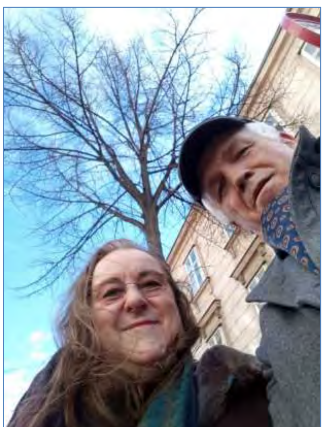
Starting the new year together