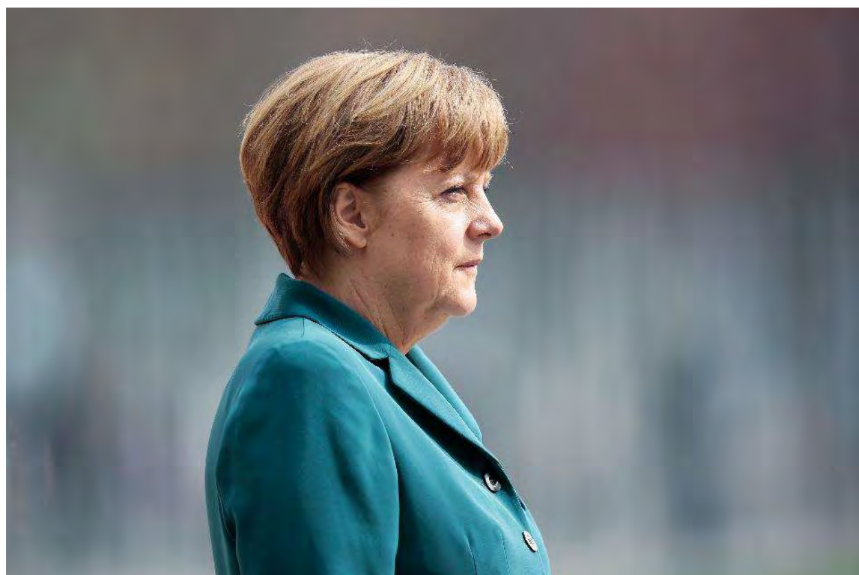
German Chancellor Angela Merkel is the world’s #1 most powerful woman in 2016

Ban Ki Moon’s statement talks about women as a “ largely untapped potential for development and peace ,” referring to the untapped potential of women in the developing world especially. It is true in the developed world as well. Women bring the soft skills that can be an effective solution to the historically conflict-ridden circumstances in this world.