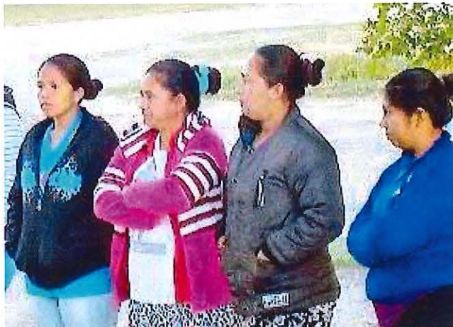
Women workers are attending a morning service. They cook meals and do cleaning. Their roles are very important and precious.