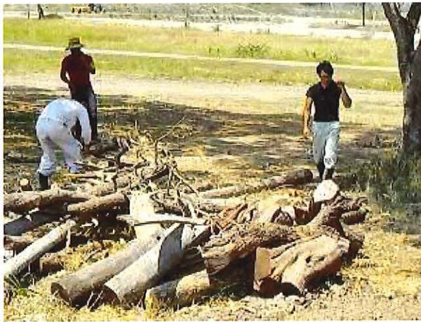
Young volunteers are chopping wood for the workers' dining hall.