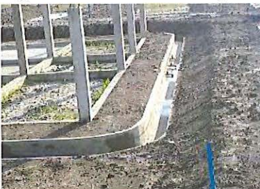
Drainage is set around the pond.

Mr. Maekawa and the young volunteers are working together to select pacu fish from the first pond and move them to a different pond. (Below)