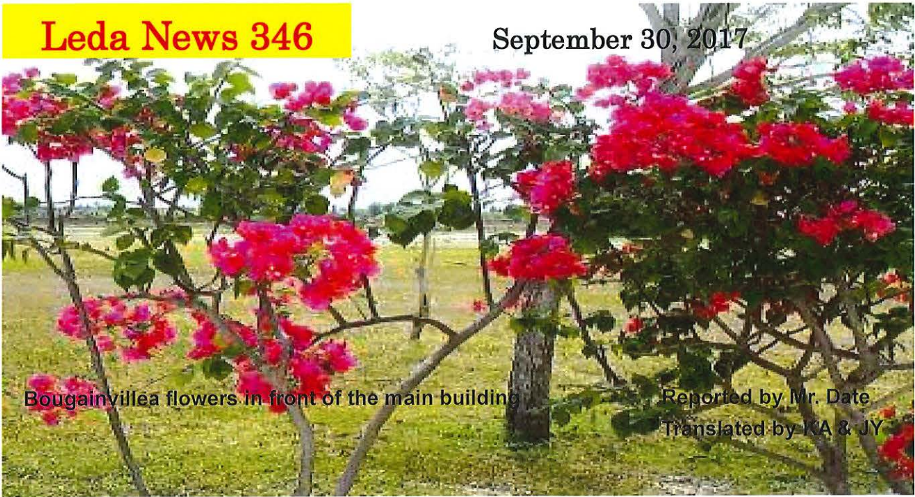
Bougainvillea flowers in front of the main building