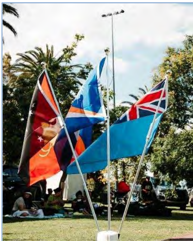
Partners And Supporters

Hosted by: Women's Federation for World Peace Australia