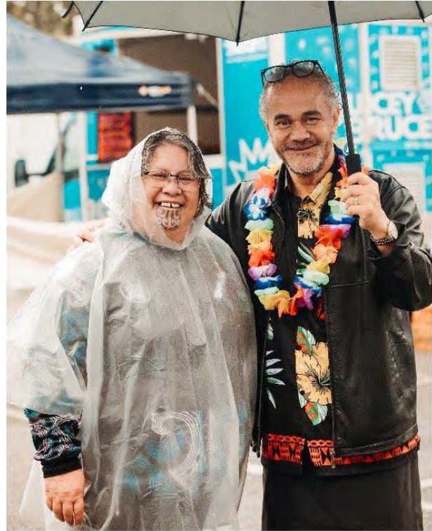
Cranbourne Star News Group