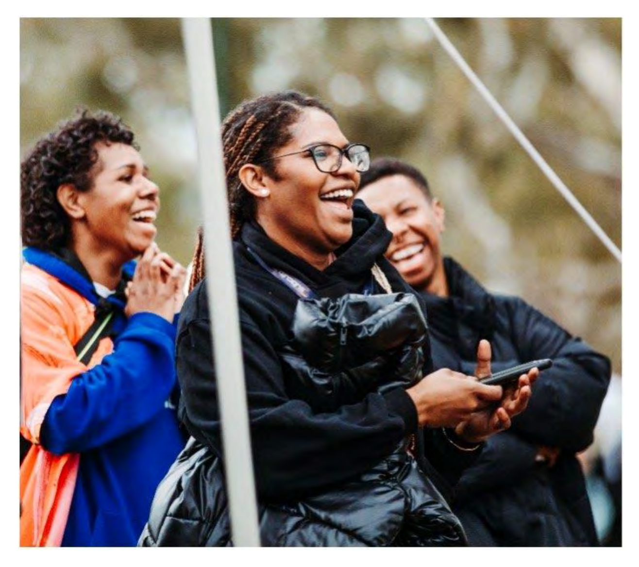
ABC Asia Pacific Newsroom City of Casey

With Support from: (in alphabetical order)