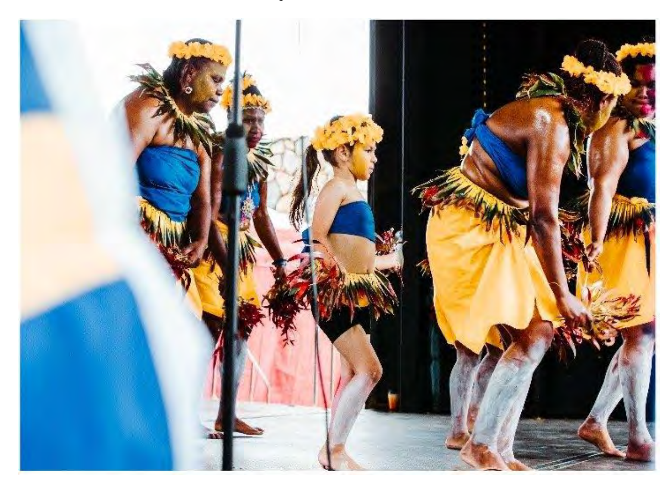
Another big thank you goes to the Melbourne Pasifika Festival Committee members, and volunteers who put in many long hours. Together, we made the festival a fun day of dancing in the rain, despite the poor weather.

Presenters/Producers both shared the microphone as MCs.