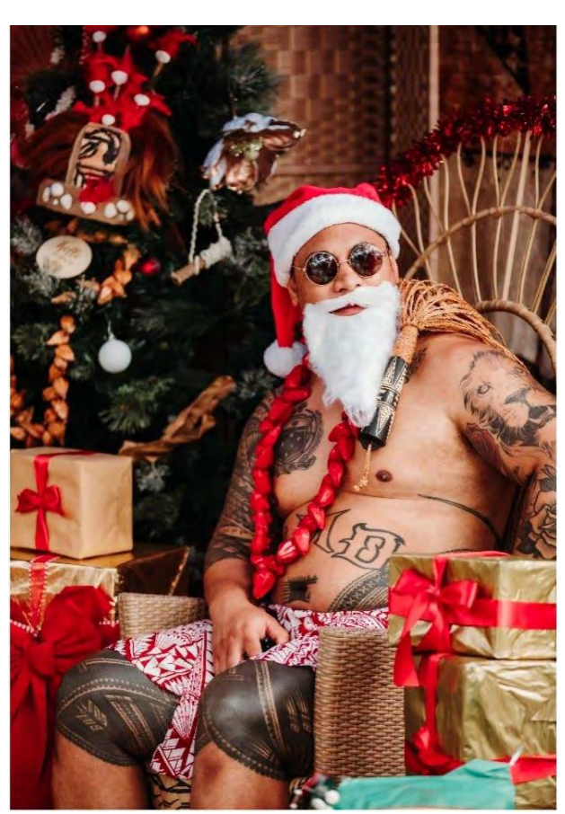
First National RE Finning real estate