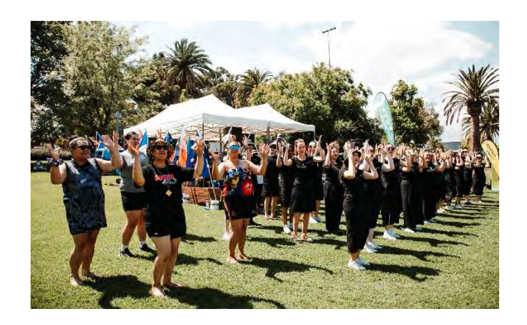
New Zealand Youth Choir