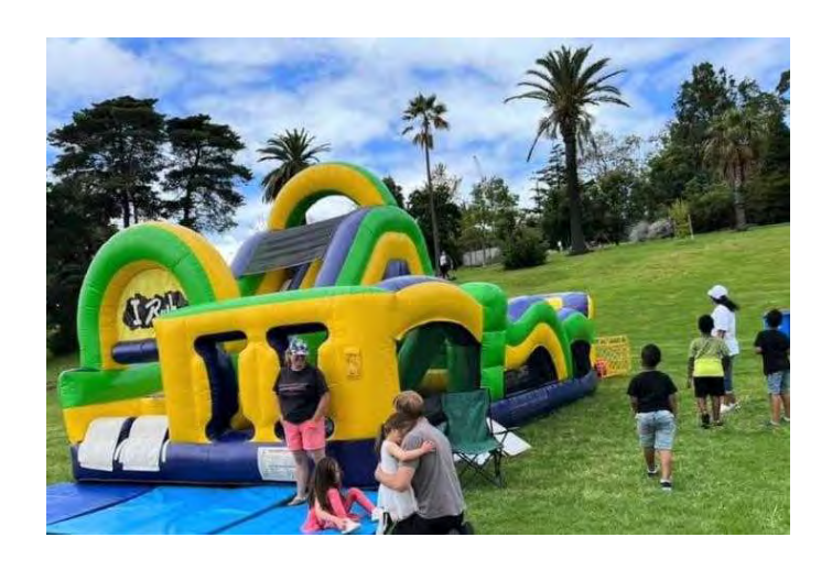
Families appreciated the Children's activities