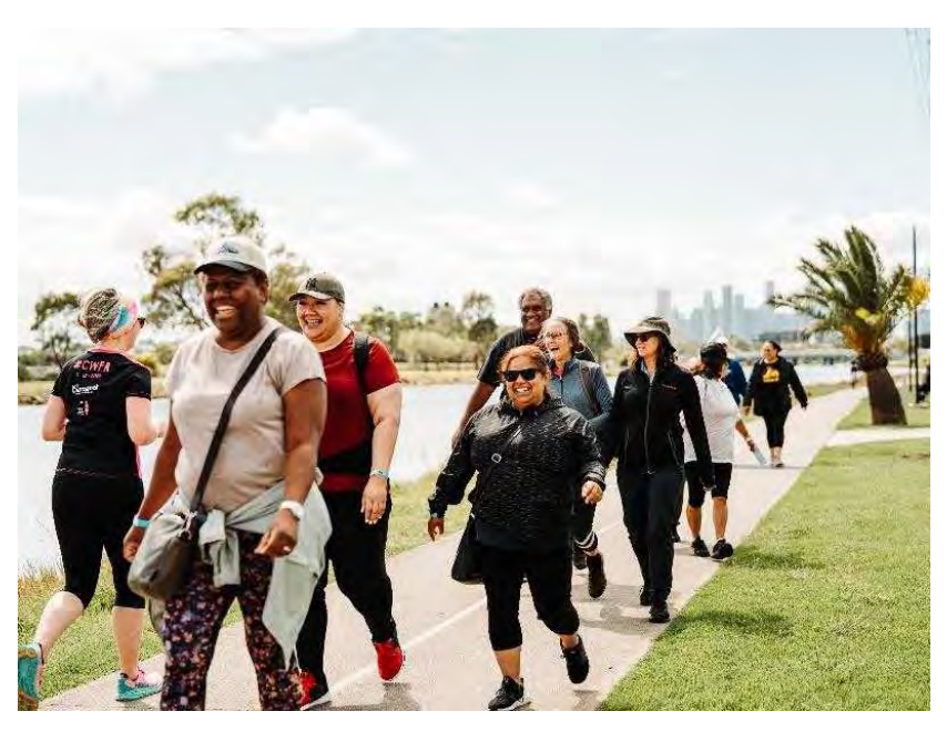
the wider community a window into all things Pasifika.

The Charity Walk raises muchneeded funds to support Humanitarian Projects located within the Pacific Islands run by the festivals organiser, Women's Federation for World Peace Australia (WFWP).