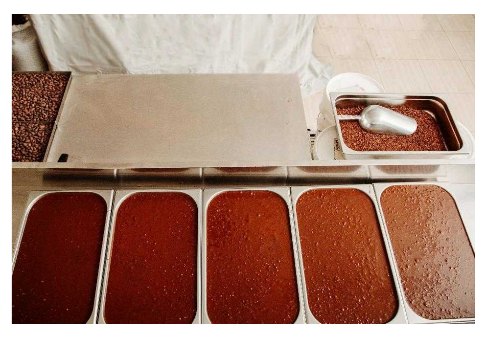
nurturing our ideas.

As a woman pushing this canoe forward, I felt like a canoe on the open seas being susceptible to the tidal changes and environments. I wanted to work with what my definition of being a women meant and honour it. Within my business I consider my own circular monthly rhythms and schedule my meetings and work schedule accordingly.