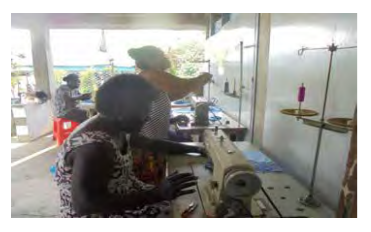
June 2018 - Proposed plan for month of June:

December 2018 - Closing and Exchange programs