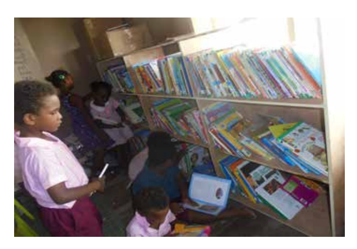
Your continuous support is of great value to our team (WFWP SI & NHA).

On the 12th of April 2018, we were delighted to receive a total of 49 boxes from Melbourne containing materials which will be of great assistance to the NHA School and WFWPSI. The New Hope Academy School is so fortunate to have these additional learning materials which will contribute to a favourable learning environment for our young students. Now, the school is finally equipped with a school library which will enhance and boost the learning environment of the school.