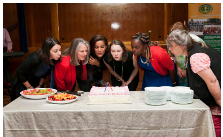
WFWP Vic. Board