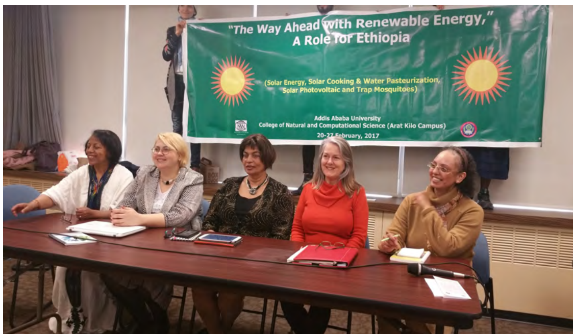
CSW61 Parallel event on Climate Change and its effect on Families

According to climate modelling, Kiribati will be un-inhabitable in 30-60 years and has a population of 100 000 people. I was surprised to realise how most people did not know about the fate of Kiribati.