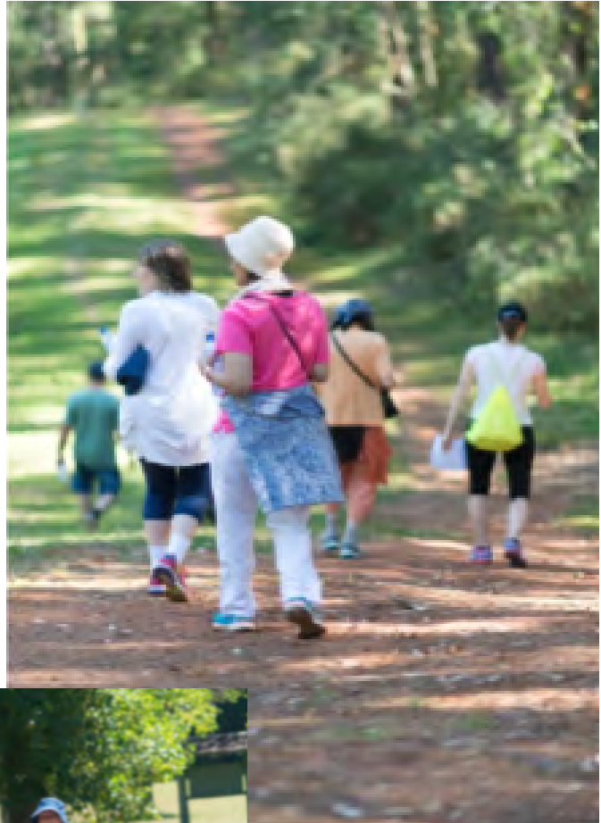
Walking the track

We all had lots of fun and are looking forward to coming next year again!