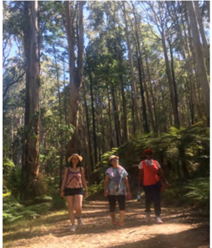
Walking the track