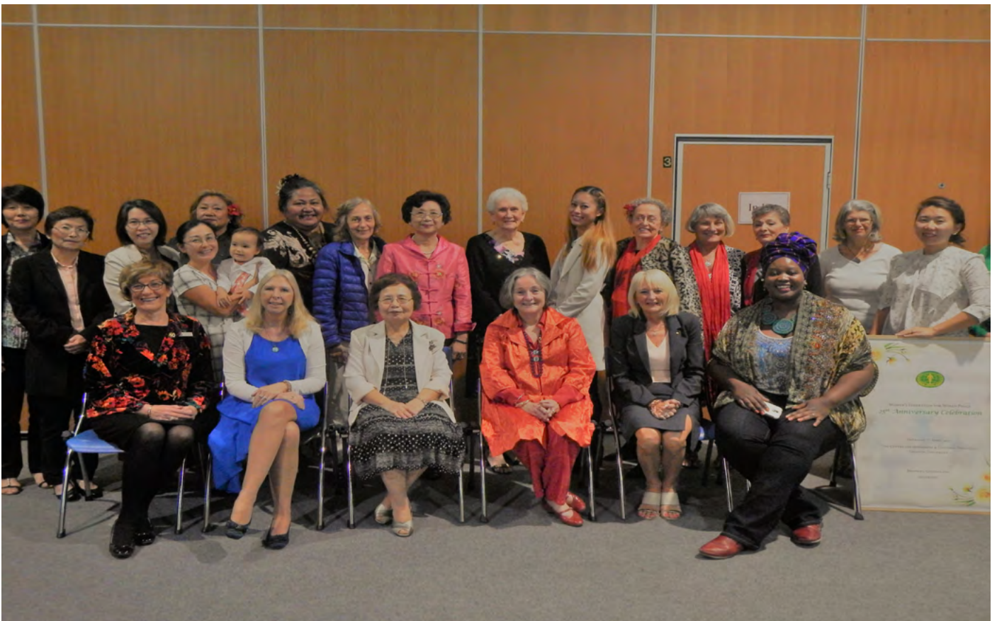
Participants celebrating WFWP 25th Anniversary

She feels we need to work harder to improve the situation of women in the world even though it has been 45 years since the UN has started to host CSW.