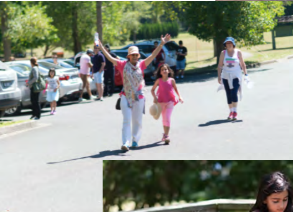
We are back!