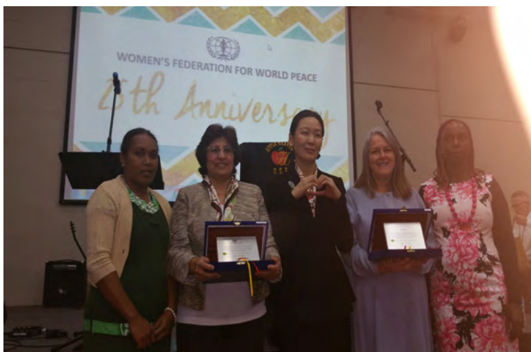
Presentation of long service & dedication awards

A WFWPI Anniversary party was held on the Friday evening at West 43rd Street. We had the chance to unwind in a relaxed atmosphere and dance to upbeat music performed by 'Apple Heaven USA', as they entertained us wearing modern day cowboy costumes.