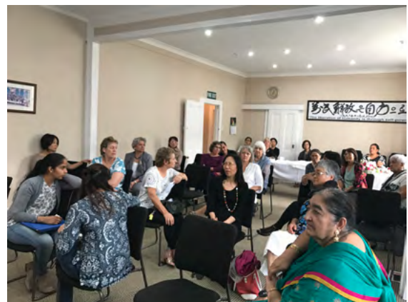
Question and Answer session

The spiritual atmosphere was very much alive at this event, and all the women appreciated the great sacrifices made by the coordinators and their volunteers. It was a great opportunity to network and make lasting friendships.