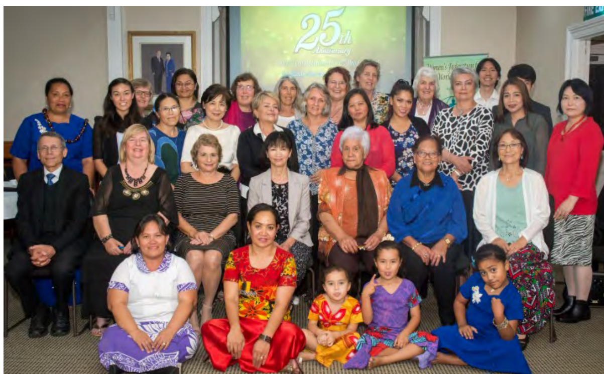
Participants celebrating WFWP 25th Anniversary