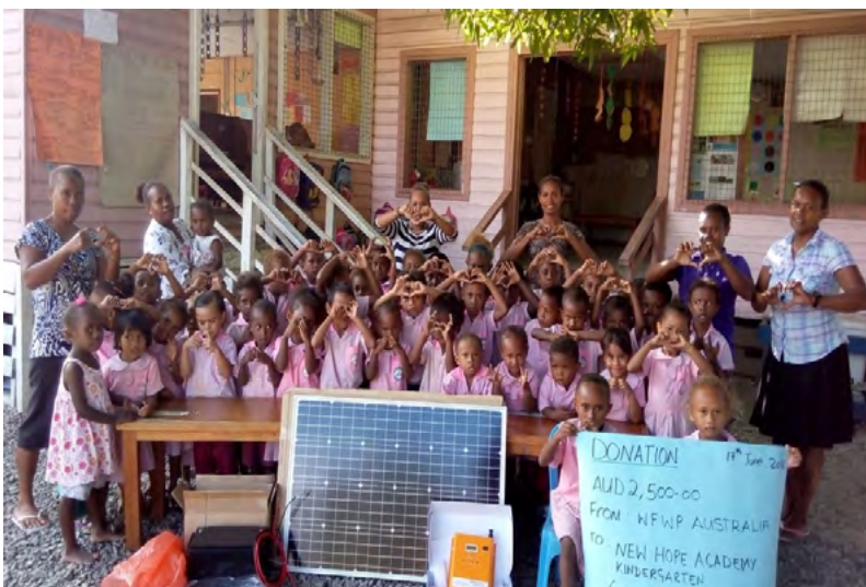
Staff and students receiving the Solar Panels Donation (2016)

Thanks to our efforts and our donors, the classrooms can now be cooled down with the help of fans during the hot summers, while teachers can make use of computers to read their emails and prepare their lectures. The school is now expanding into a primary school.