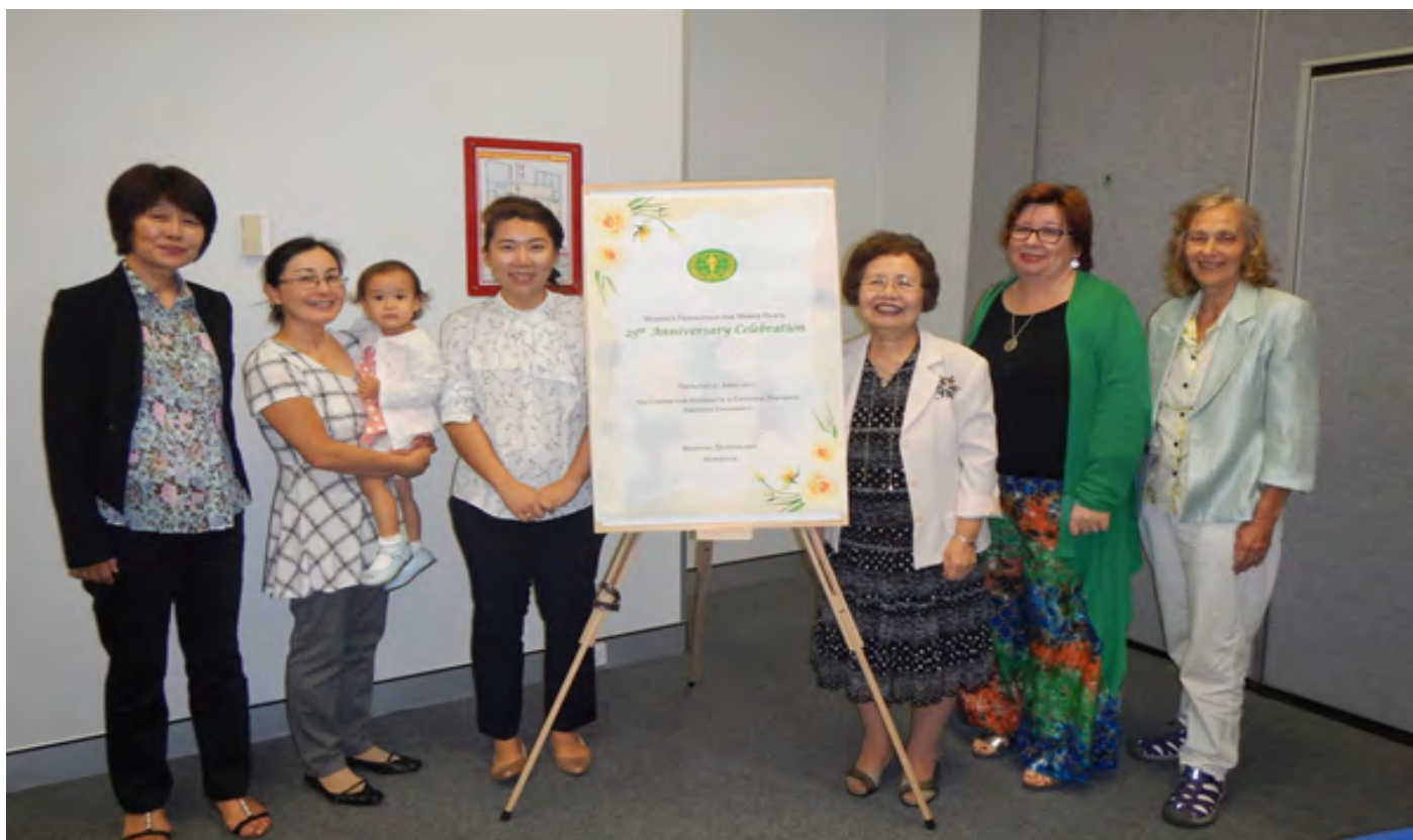
Management Committee Members

*United Nations Commission on the Status of Women 61st Session