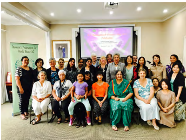
After the discussion, the meeting concluded with a group