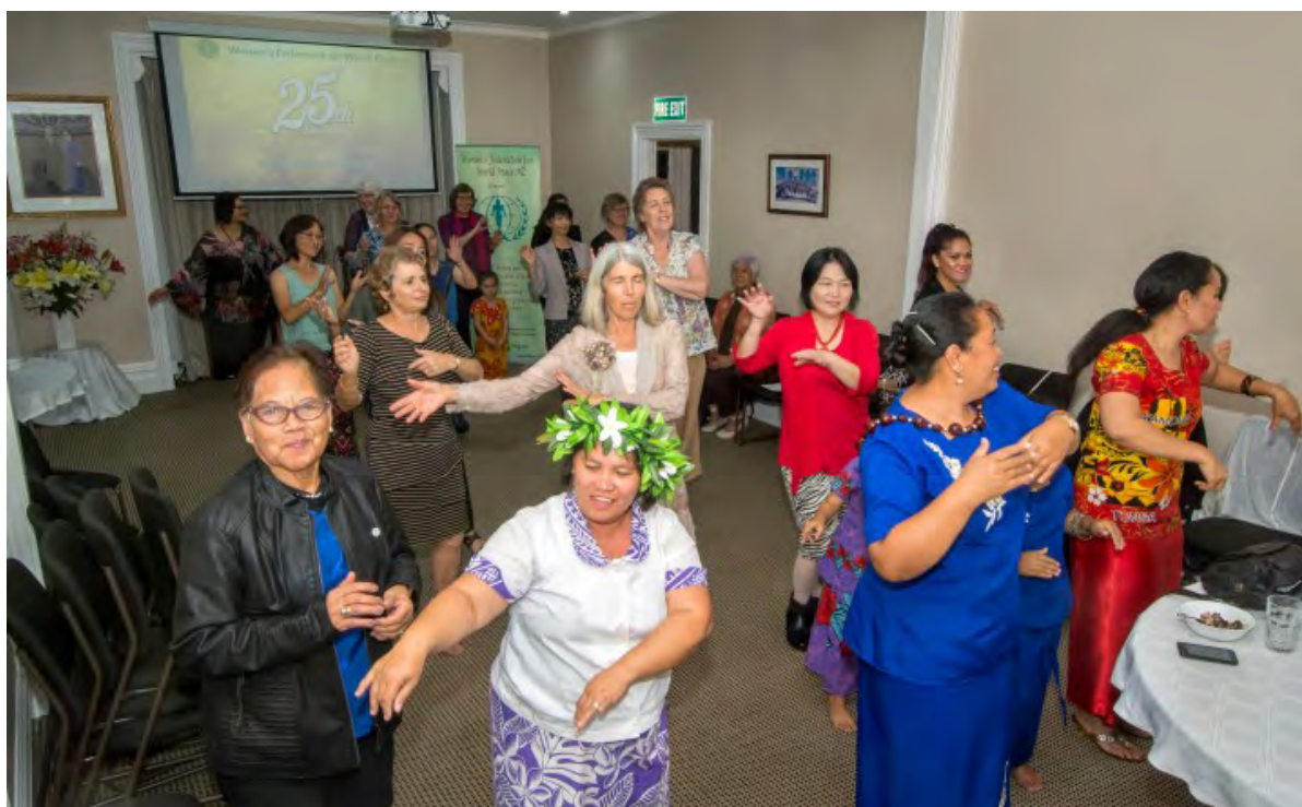
Everyone else joined in the dancing and enjoyment.