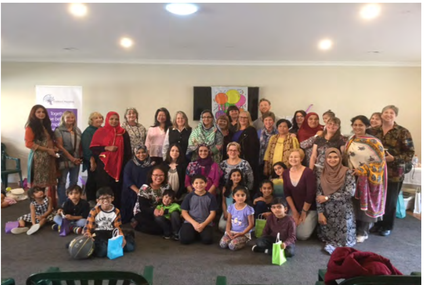
Birthday participants celebrating UMSLV 4th Birthday

This exciting interfaith event of 'Conversations and Story Telling' will help to dispel some of the misunderstandings held by the Australian community about our Muslim Australians.