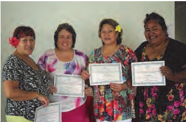
4 leaders from the Logan Samoan Advisory Council

In 2013 we presented this program to leaders of Logan Samoa Advisory Council and 4 of them received certificates of completion. We also gave the introductions to staff of ACCESS and leaders at the Logan Police & CALD community meeting.