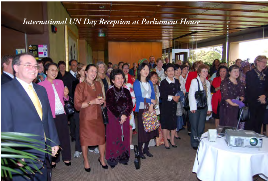
International UN Day Reception at Parliament House