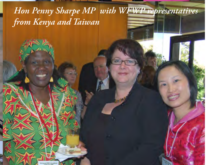
Hon Penny Sharpe MP with WFWP representatives from Kenya and Taiwan