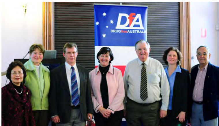
WFWP leaders and DFA directors