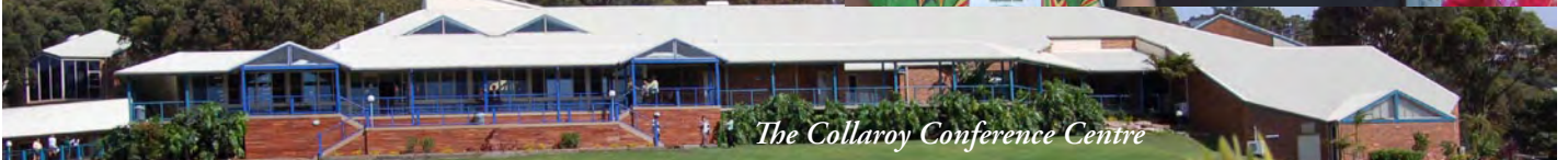
The Collaroy Conference Centre