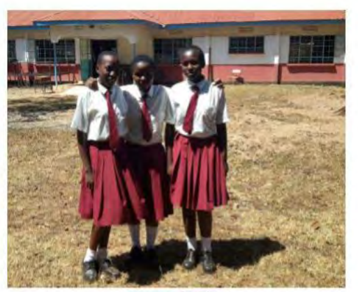
Mourene with 2016