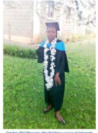
October 2017 Mourene after finishing a course at University