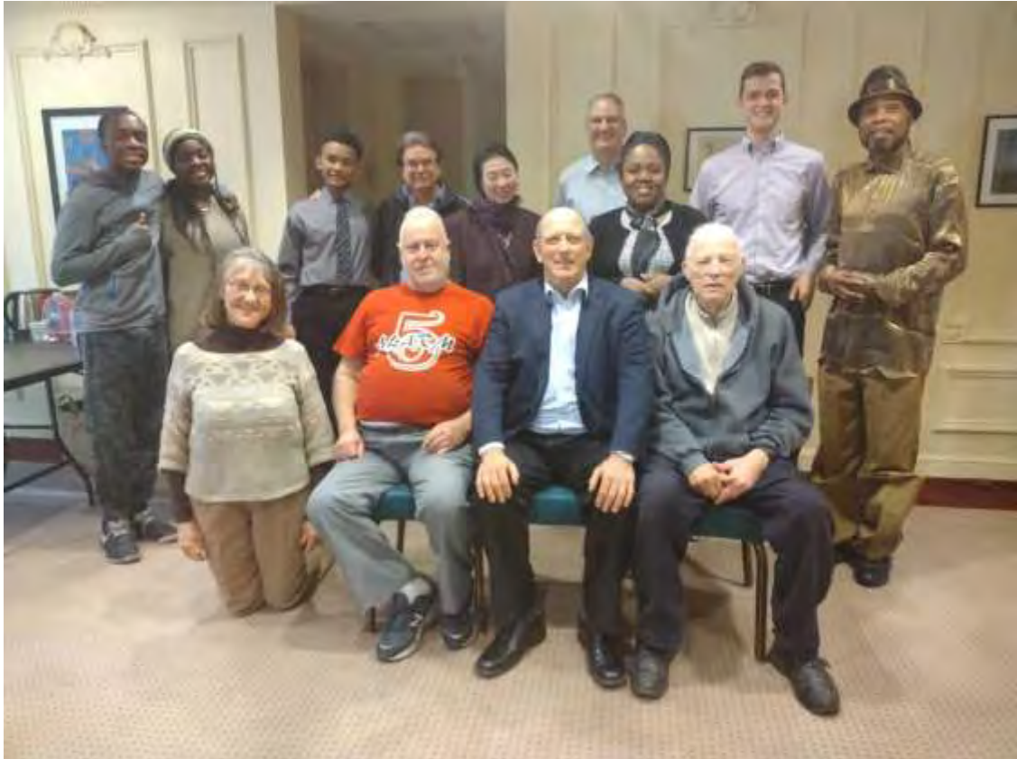
1-Day English Divine Principle Seminar on Saturday

📷 Send your pictures to robertabendroth7@gmail.com