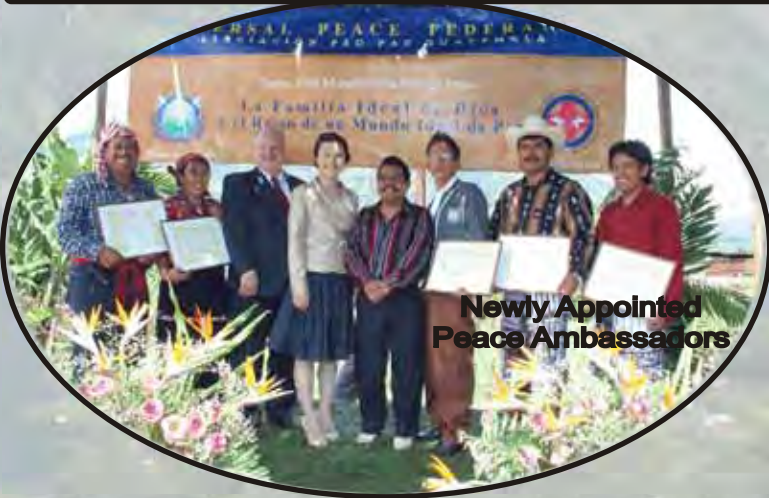
Newly Appointed Peace Ambassadors