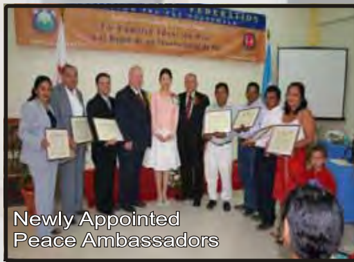
Newly Appointed Peace Ambassadors