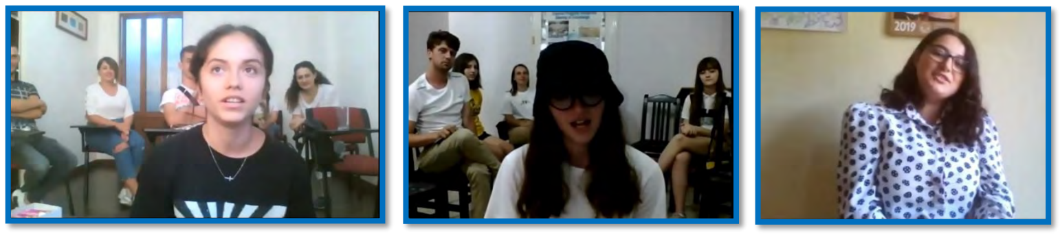
"I am very glad that after many difficulties that we are going through, the technology for which we would complain that was dividing us, now was used to unite us and to transmitt the Principle. The workshop was even more meaningful after the Rally of Hope, which was a great inspiration for us all in these difficult pandemic times."

"This workshop was very special for me, filled with emotions through which my heart felt closer to True Parents. I reflected a lot and tried to understand and feel more. The lectures got a special meaning for me, such as the Formula Course. It impressed me a lot the fact that the main focus of True Father for fund raising, is education."