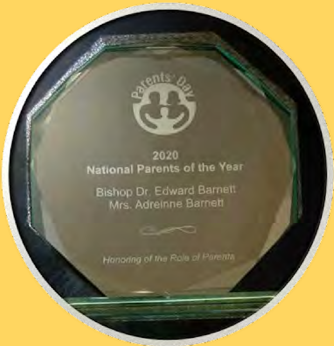
2020 National Parents of the Year Award