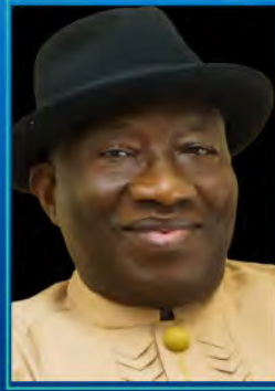
H.E. GOODLUCK JONATHAN

14th President of the Philippines from 2001 to 2010.