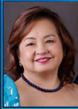
H.E. GLORIA MACAPAGAL ARROYO

14th President of the Philippines from 2001 to 2010.