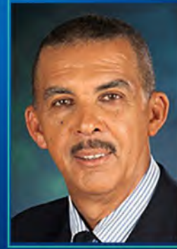
H.E. ANTHONY CARMONA

5th President of Trinidad and Tobago from 2013 to 2018.