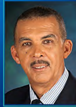
H.E. ANTHONY CARMONA

5th President of Trinidad and Tobago from 2013 to 2018.