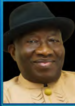
H.E. GOODLUCK JONATHAN

14th President of the Philippines from 2001 to 2010.