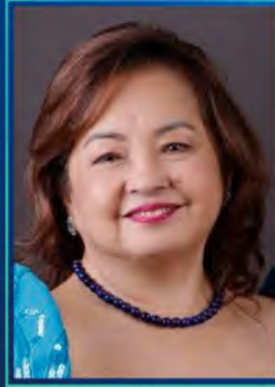
H.E. GLORIA MACAPAGAL ARROYO

14th President of the Philippines from 2001 to 2010.