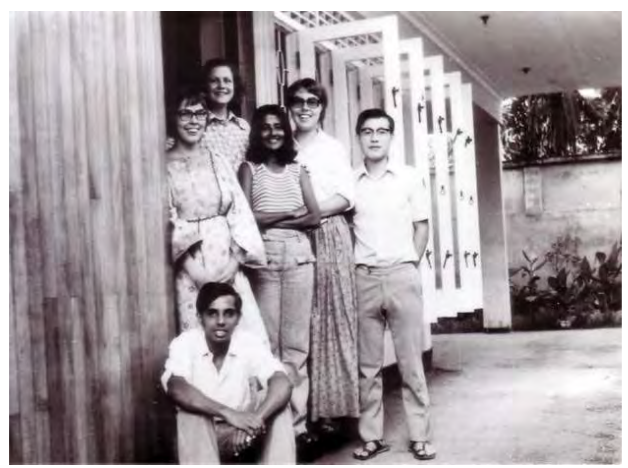
The center in Sri Lanka that we moved into just after I and a Sri Lankan couple joined the 3 original missionaries to Sri Lanka in 1975

It was on August 16, 1975 that I had a powerful spiritual experience: After listening to Chapter 16 of the Divine Principle, I started to fast and pray telling God that I would not eat unless He told me whom I should follow, True Parents or my Yoga teacher. On the 5th day of my fast, while I was praying in a Catholic church, a marriage ceremony began. At that moment God told me that it has been His dream from the beginning of human history to build an ideal family and that I should follow True Parents and get blessed in the future. In utter excitement and joy, I ran to the center and told the missionaries that I was ready to join them giving up my dream of being a Yoga nun for the rest of my life.