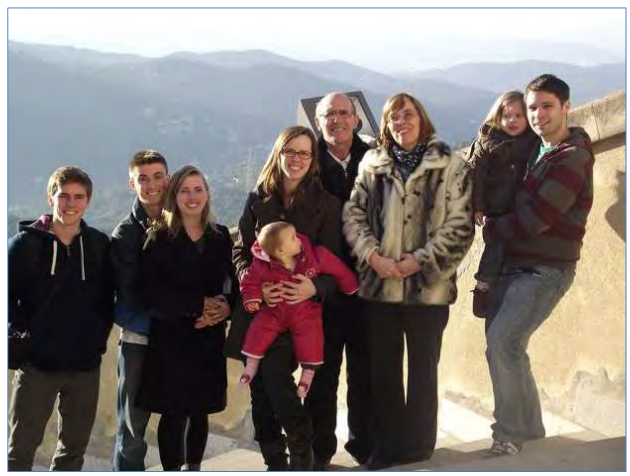
A three-generational family