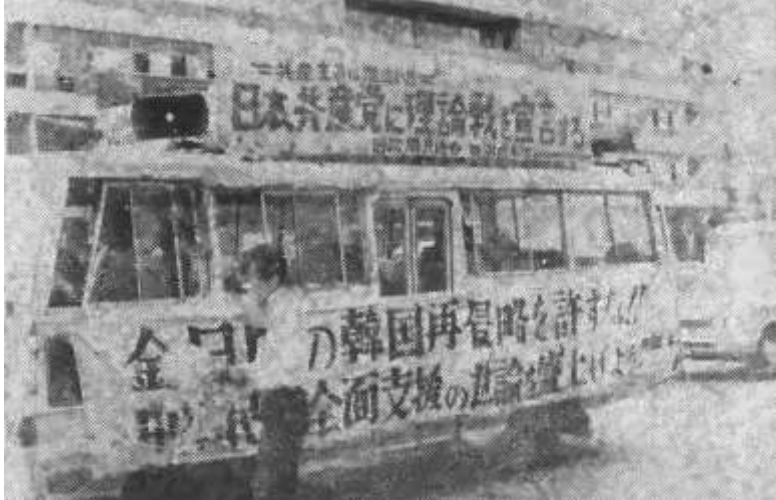
The sign says, "Don't let Kim Il Sung invade South Korea"

Marx said that Communism is the death blow to religion, but the fact is, conversely, that religion is the death blow to Communism. All of the world's great religions are essentially antithetical to Communism, because they can see a higher reality than simply material relationships; and they emphasize positive, cooperative ideals and respect for human dignity and life, rather than contradiction and conflict. Strong religious faith immunizes one against Communist ideology and enables one to withstand even physical torture and brainwashing.