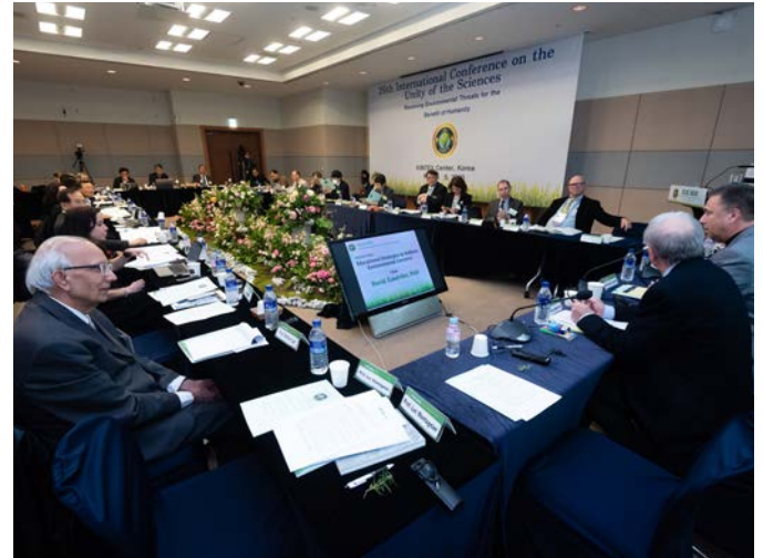
The 26th International Conference on the Unity of the Sciences (ICUS)

On February 1-3 at the Mayfield hotel in Seoul, was held the first Conference on Science and God on the theme “Exploring New Pathways to Resolve Environmental Challenges”. The conference was co-chaired by Nobel Laureate Professor Luc Montagnier.