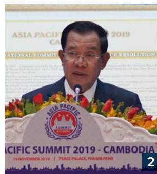
1 The summit was held inside the Peace Palace 2 Cambodian Prime Minister H.E. Hun Sen