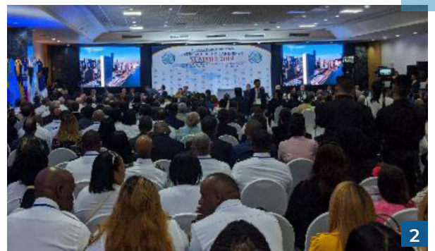
1 Speakers and dignitaries at the summit 2 The 2-day event was held at the Santiago Government Hall and Hodelpa Gran Almirante Hotel