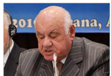
Former Albanian President Alfred Moisiu reviewed some of the challenges faced by his own country and Balkan nations. He pointed to nationalistic trends and outside influence, recalling the Balkan history and regretting a lack of will to find common solutions.