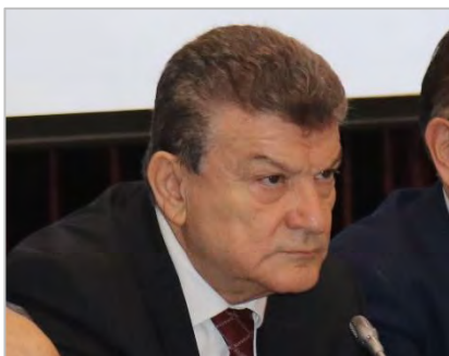
The first session was moderated by Hon. Gaqo Apostoli , former Minister of Transport and current chairman of UPF in Albania.

The presence of former Balkan heads of state and the gathering of Albanian parliamentarians from both ruling and opposition parties, at a time of enduring conflict in the Albanian Parliament, raised the interest of the local media which covered live the whole event.