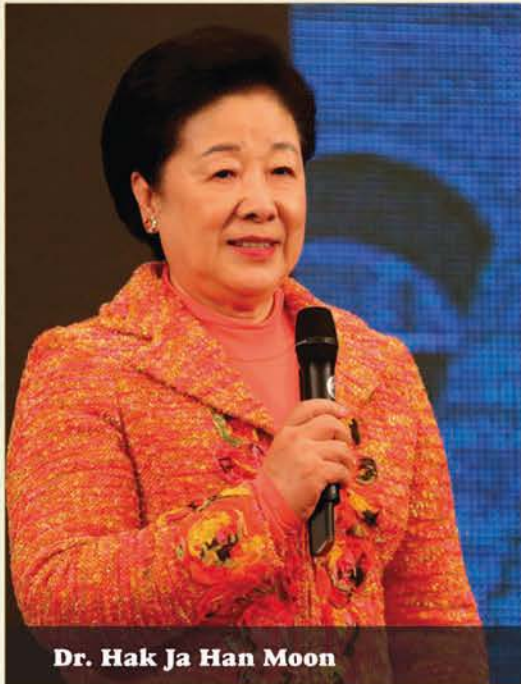
Dr. Hak Ja Han Moon

ILC PROGRAMS HAVE BEEN HELD THROUGHOUT THE WORLD, BRINGING TOGETHER THOUSANDS OF LEADERS FROM ALL WALKS OF LIFE