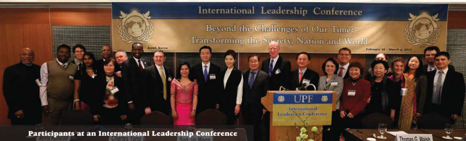
Participants at an International Leadership Conference

The ILC program introduces essential, universal values, principles and practices that are necessary to create a world in which people of every region, race, nationality, culture and religion live together in peace. We will consider the root causes of conflict and the ways we can move together from states of conflict, inequality, poverty and enmity toward reconciliation, cooperation and prosperity as one human family under God.