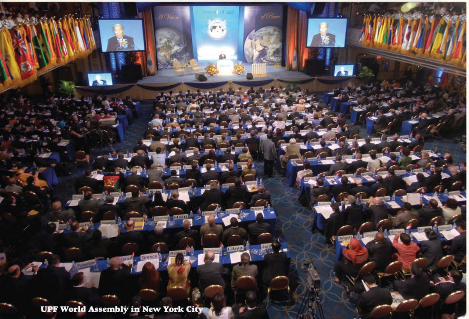
UPF World Assembly in New York City

UPF is an NGO in Special Consultative Status with the Economic and Social Council of the United Nations. We support and promote the work of the United Nations and the achievement of the Sustainable Development Goals.