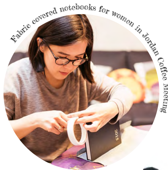
First coffee meeting, “High Tea”

The very beginnings of Women’s Federation started with these informal get-togethers and in the same way have been beneficial by doing something small and regular, no matter what the size. It has been important to start gaining momentum and meeting together as young women regularly to learn each other’s interests, concerns and ideas.