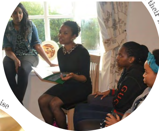
Kyora sharing in one of their meetings