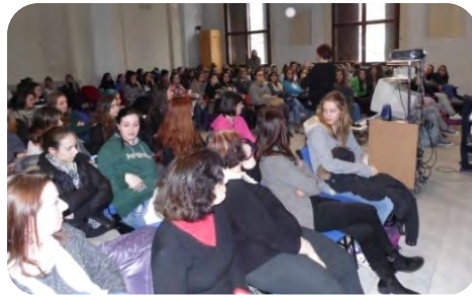
Education in schools