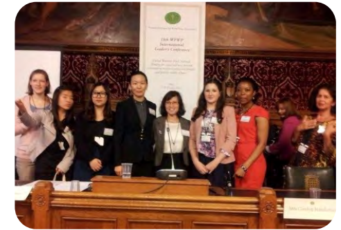
Session at Houses of Parliament