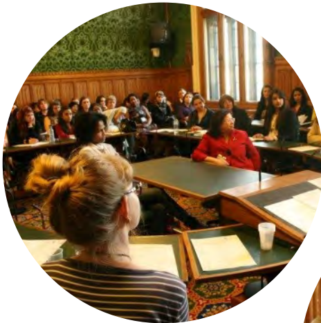
Young Women’s Global Voices event

Nov 26th 2013 - “Importance of Education for the Elimination of Violence Against Women”