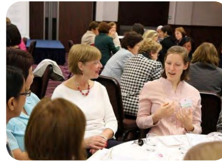
World Café discussion