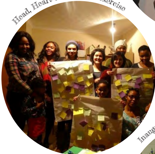
Head, Heart and Hands" exercise