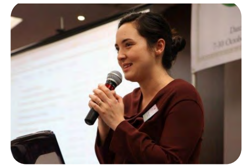
Young women moderators