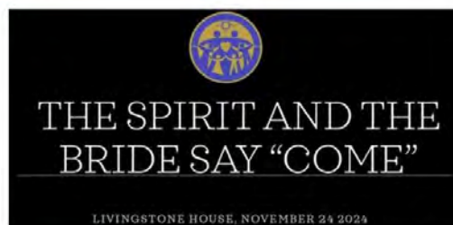
Illustration used on 24th Nov. 2024. Screenshot

As you can see, my title is "The Spirit and the Bride Say, 'Come!'"