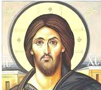
Jesus of Nazareth.

"Come to me all you who labour, [...] and I will give you rest." (Matthew 11:28)