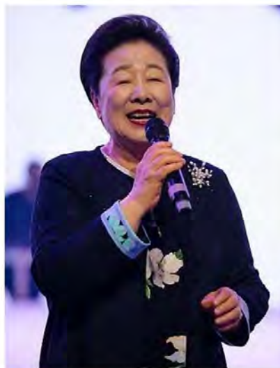
Mother Moon speaking in Munich, Germany 19th May 2024.

"Let's go back for a moment to spring and that very happy day when True Mother came to speak to us in Munich."