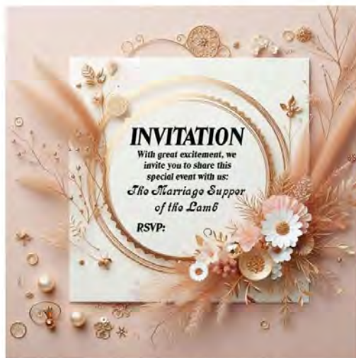
You are invited! Illustration: Microsoft Designer Image Creator, 30th Nov. 2024

Even more, related to extending an invitation: Gender-Balanced Understanding of God and Christ