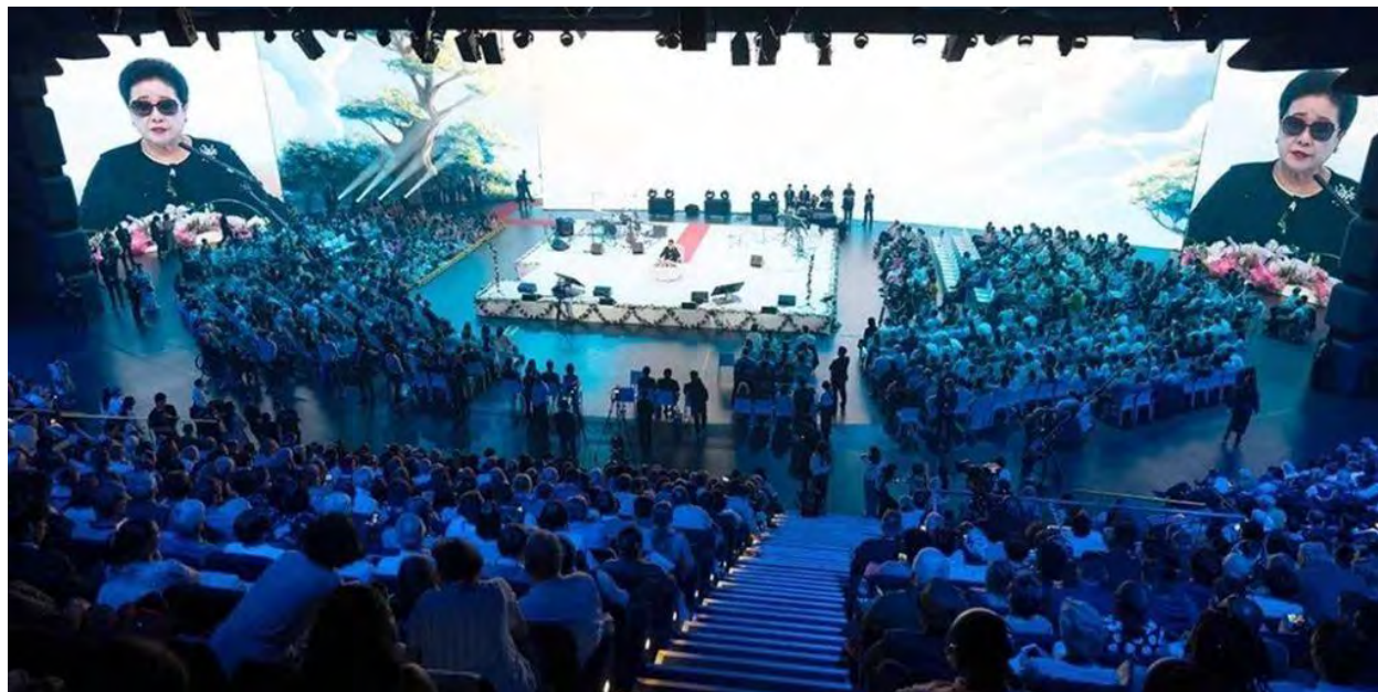
Mother Moon on stage during the Bloom Festival, in Showpalast, Munich, Germany 19th May 2024

I remember when Mother came to Munich. Did any of you go to Munich for the Bloom festival?