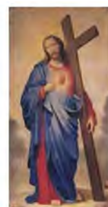
Public domain image. Cropped