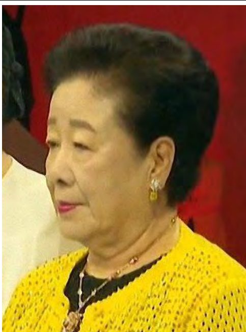
Mother Moon August 23, 2024

When we think about coming to know the heart of God , probably the heart that we most readily associate or think of is God's suffering heart. And sometimes we refer to this as God's heart of the fall.