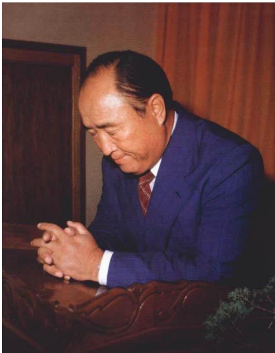
Father Moon in prayer

In order for us to reconnect our relationships , we should always strive to make these connections ourselves. If we do not have the attitude to make connections with others, we cannot improve the environment in which we live."