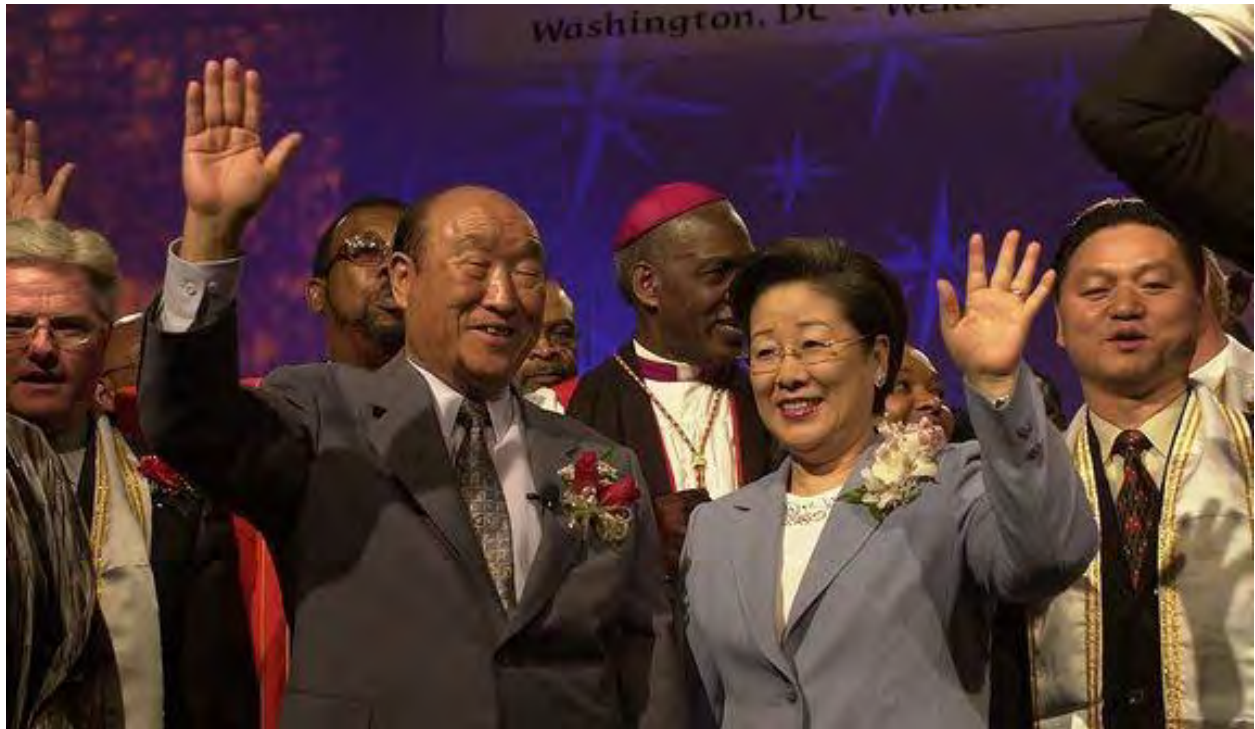
God is our Parent. Father and Mother Moon proclaim a simple message. Here in Washington DC, USA April 16, 2001

"Did we make the right choice? Are we really heading for the Cheonilguk (Kingdom of Heaven) ?"