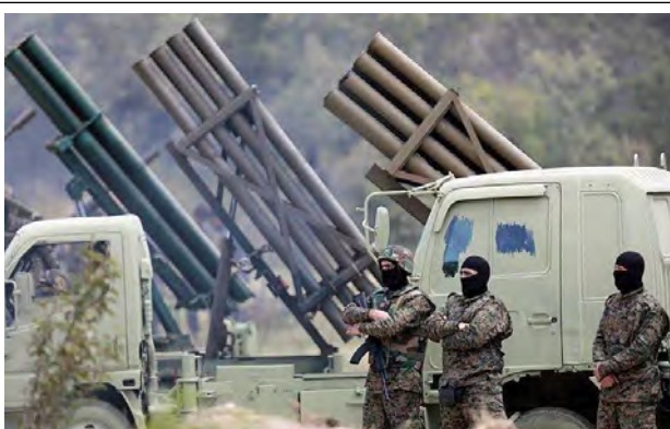
Fighters from the Lebanese militant group Hezbollah carried out a training exercise in Aaramta village in the Jezzine District, southern Lebanon, on Sunday, May 21, 2023

But of course, as we know through the Divine Principle , this dream was lost. And it's always been lost. There's never been any human being ever who saw the dream of God .