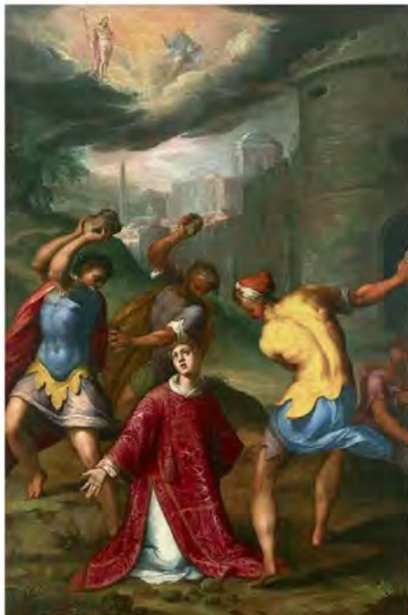
The stoning of Saint Stephen, the first Christian martyr. Painting by Hans von Aachen (1552-1615). Painting is now in Church of St. Stephen, Krakow, Poland.

But then they entered the second stage , and the second stage was much more difficult because they started to receive persecution and attacks .