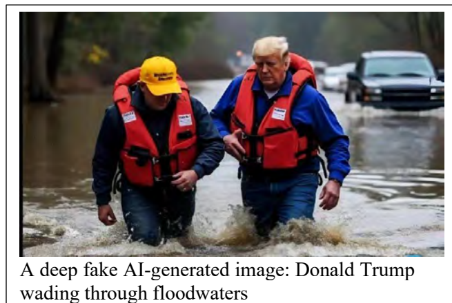
A deep fake AI-generated image: Donald Trump wading through floodwaters

Of course, this spread. And very quickly there was an uproar, and the police had to be called to protect the principal. Pretty soon the whole community was asking, "Hey, how can this be?"