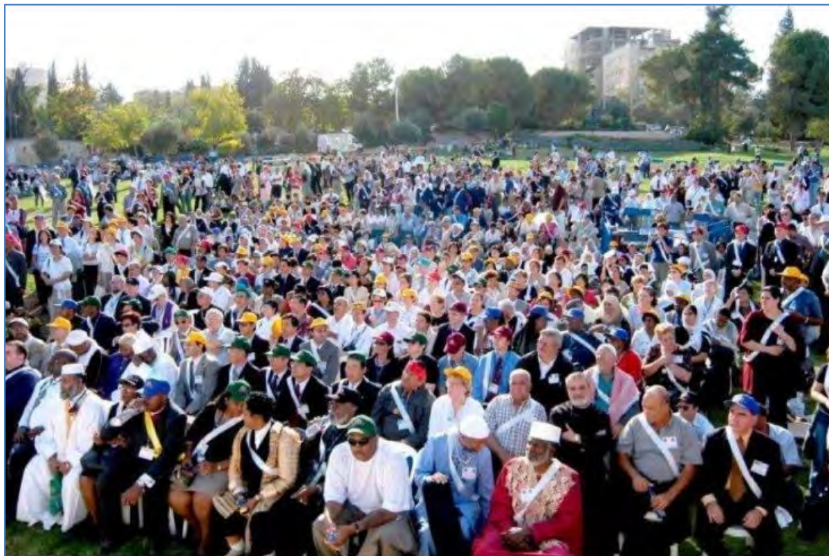
From a peace rally in Independence Park in Jerusalem in October 2003

I can't help remembering when I was working in Israel and Palestine 20 years ago, and the kind of easy, cordial relations - despite everything - that we had with Jewish, Christian and Muslim leaders - how peaceful it was and how we managed to fill up the park in the middle of Jerusalem with people to crown Jesus. It's astonishing.