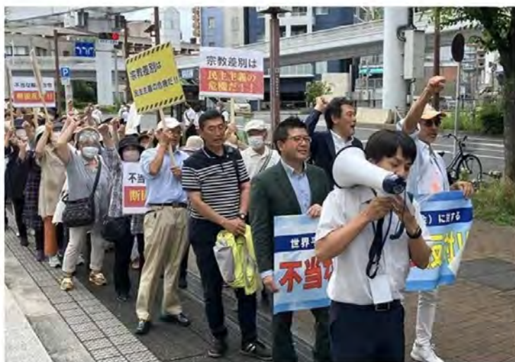
From the demo in Kitakyushu City 30 th June 2024.

Prime Minister Shinzo Abe on 8 th July, followers of the Family Federation for World Peace and Unification (formerly known as the Unification Church ) held rallies and marches across the country, calling for freedom of religion.