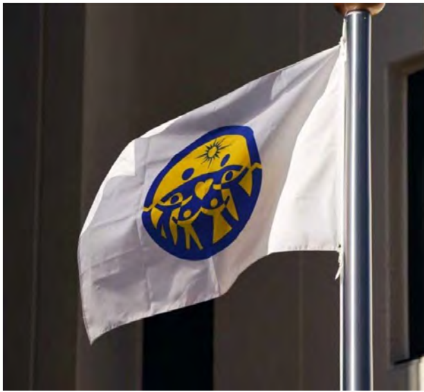
Members of the Family Federation protesting against the unjust dissolution of their movement. Here, the flag of the federation waving in Japan

On the afternoon of 6th October 2024, the "Fukuoka Citizens' Association for the Protection of Fundamental Human Rights and Freedom of Religion", organized by volunteers from the Family Federation for World Peace and Unification (formerly the Unification Church ), held a demonstration march through the busy streets around Fukuoka City Hall. About 400 people participated in the demonstration.