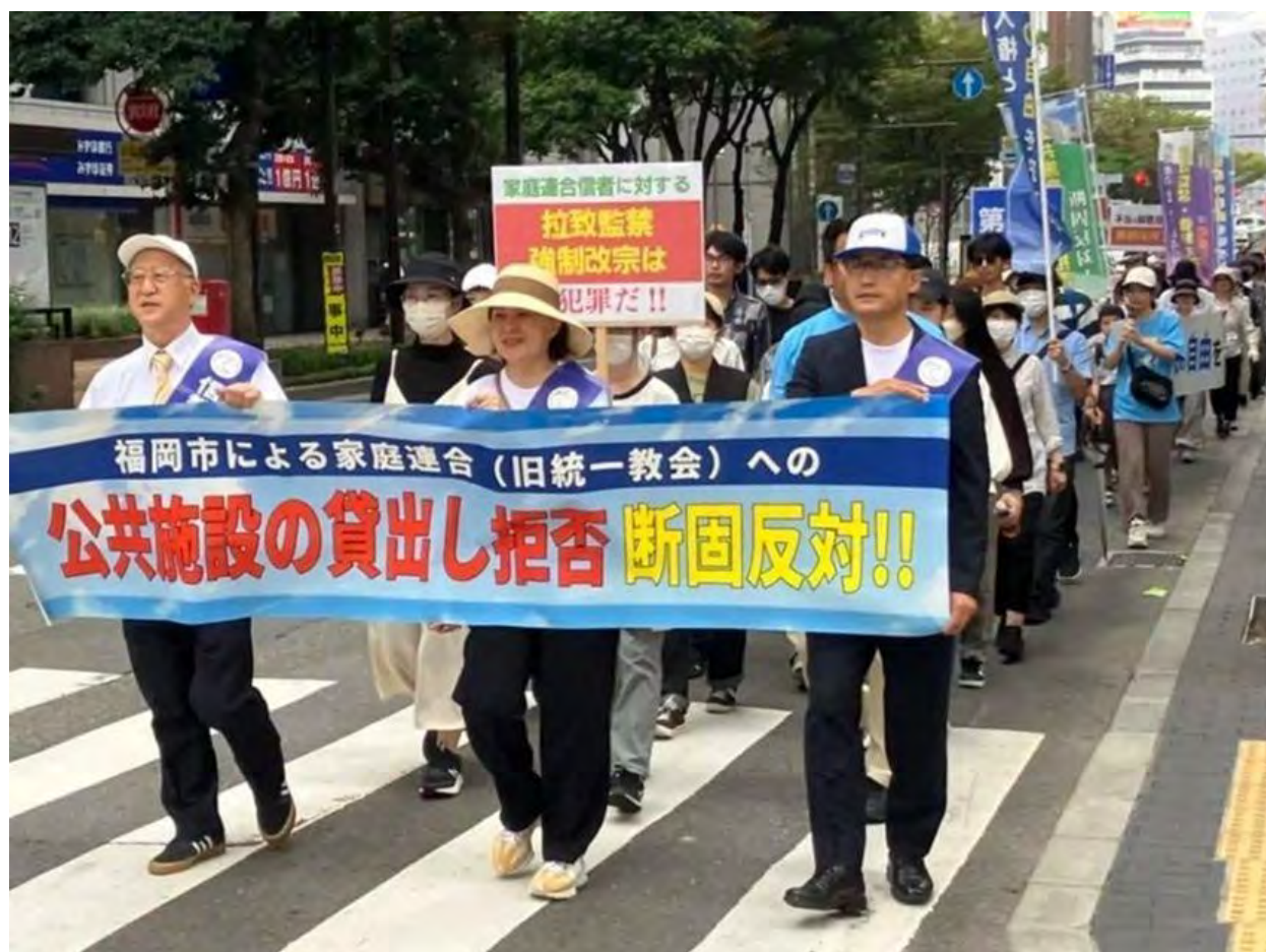
Participants in the demonstration that started in front of Fukuoka City Hall and marched through the downtown area of Fukuoka City, on the southern Japanese island of Kyushu on 6th October 2024