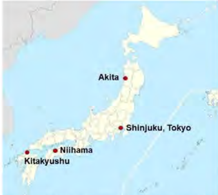
Location of the cities mentioned. License: CC ASA 3.0 Unp