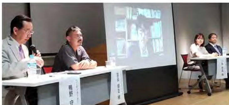
Discussions about faith experiences and social contributions were held at the 'Akita Rally to Protect Freedom of Religion' on 30 th June 2024, in Akita City.

In Shinjuku Ward, Tokyo, on 30 th June, about 100 followers held a protest march, claiming that the declaration by the Liberal Democratic Party to sever ties with the Family Federation was infringing on the followers' human rights. They chanted slogans such as "Protect freedom of religion".