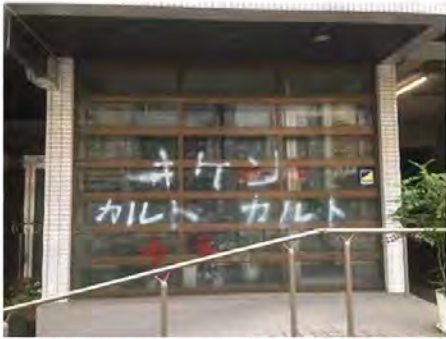
Graffiti sprayed on Family Federation facilities in Japan after the Abe assassination in July 2022.

The huge number of open hostilities against the Family Federation include graffiti sprayed on cars, and windows of church facilities being broken during prayer sessions.