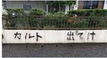
Graffiti sprayed on Family Federation facilities in Japan after the Abe assassination in July 2022.

The Family Federation announced that it will present these details in writing to Tokyo District Court during the hearings for the dissolution order requested by the Kishida administration. The religious organization also reported recurring incidents of graffiti with messages like "Traitor cult" and "Cult, get out," along with nuisance phone calls at churches in various locations across the nation.