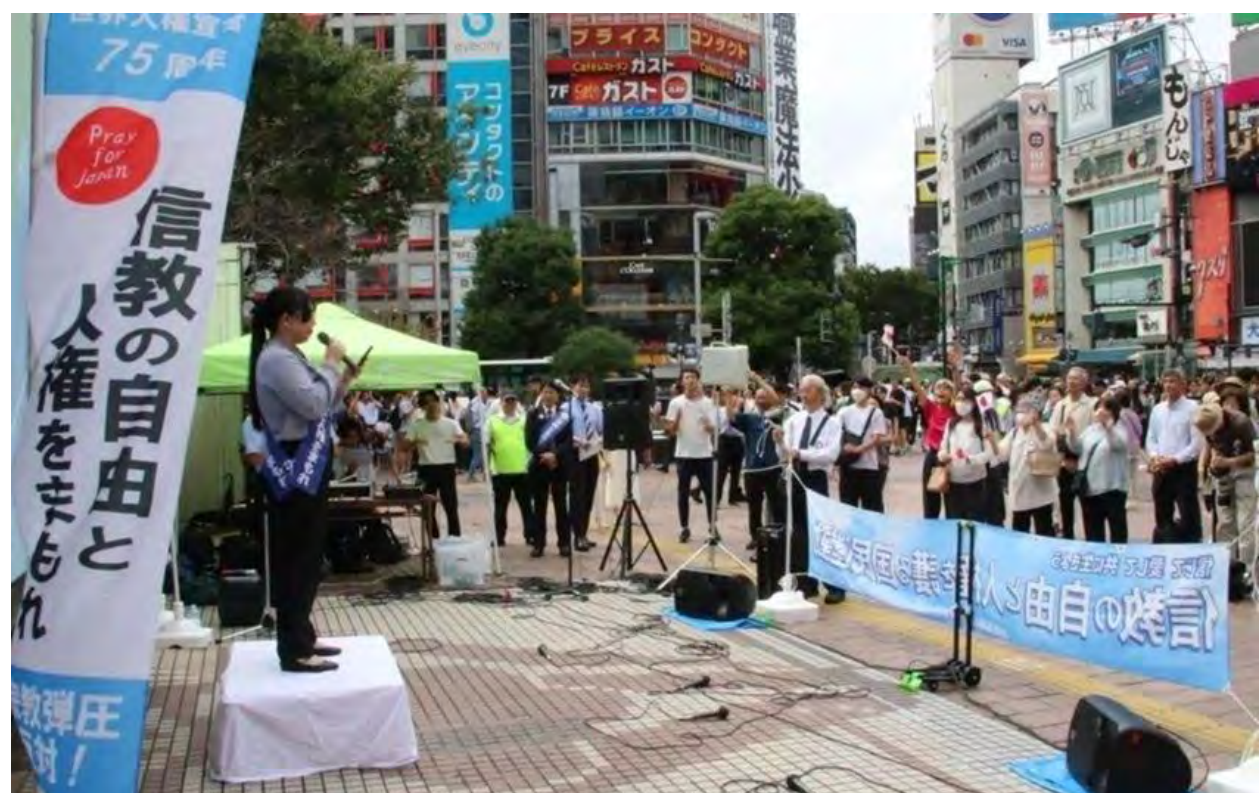
A second-generation member of the Family Federation appeals for the protection of religious freedom and human rights, afternoon September 16, 2024, Shibuya, Tokyo

by the editorial department of Sekai Nippo