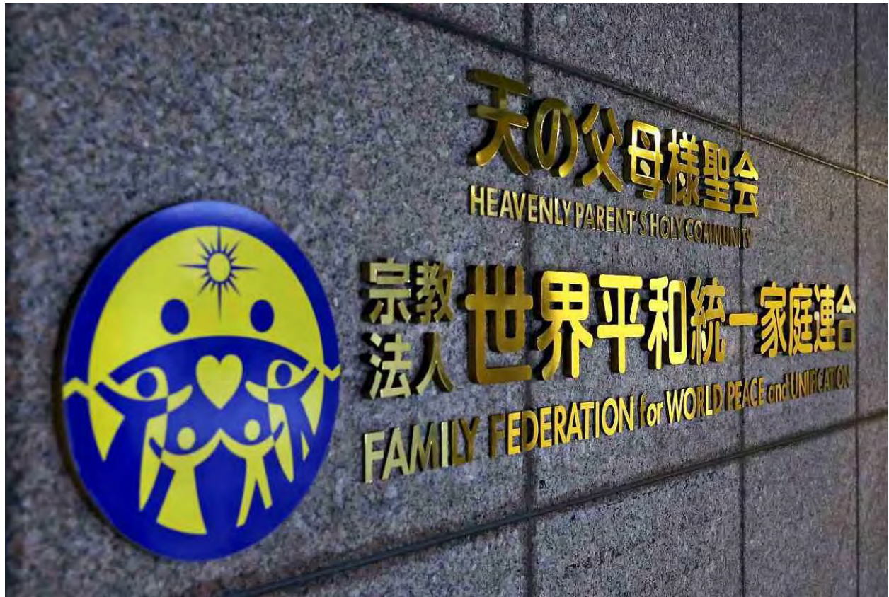
Sign at the entrance of the headquarters of the Family Federation of Japan in Shibuya, Tokyo