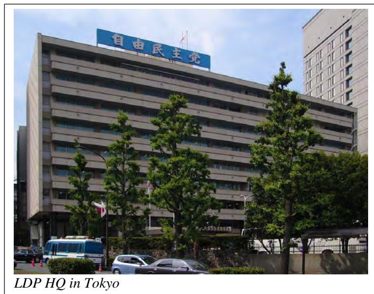
LDP HQ in Tokyo

"Firstly, there's no reason for the LDP to reject a visit from an organization made up of citizens with voting rights who express support for the party. Political parties exist to gather public support in order to realize their policies, and providing information to groups that align with their policies is a normal part of political activities. Voting rights are equally granted to all citizens, and criticizing people for exercising these rights based on their personal affiliations is a violation of basic human rights."