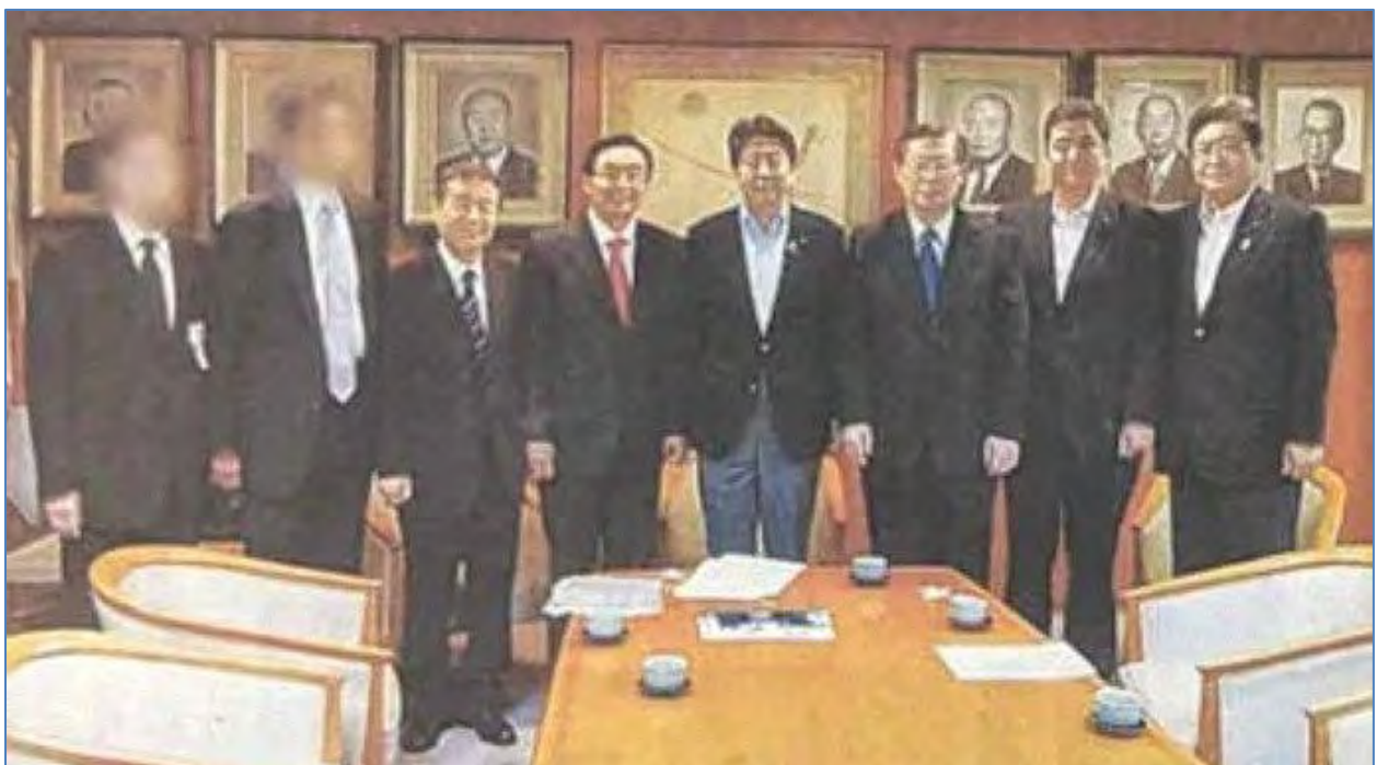
Asahi Shimibun 17th September 2024

In the Sankei Shimibun, one of Japan's top 5 dailies, 29th September 2024, Kazue Fujiwara (藤原かずえ) spells out an accurate criticism of the constant leftwing allegations of ties between the governing Liberal Democratic Party (LDP) and the Unification Church , now called the Family Federation .