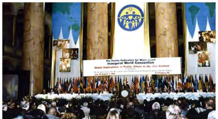
The Inaugural World Convention of the Family Federation 31st July 1996

"While the world's finest athletes test themselves in Atlanta, this gathering is sort of a spiritual Olympics. Like the Olympians, you have assembled from all over the world to further the cause of peace among nations.