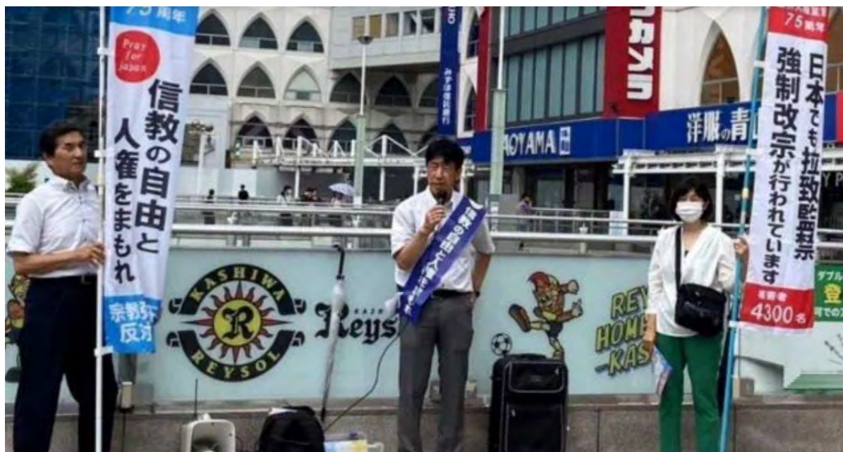
Demonstration against the horrendous persecution and human rights violations that members of the Family Federation suffer in Japan. Here, from a demonstration in Chiba, a large city east of Tokyo

Those lawyers, organized as National Network of Lawyers against Spiritual Sales, employed legal concepts hard to define like "brainwashing" and "undue influence" to challenge the legitimacy of donations made by members of the Family Federation . Japanese courts, adopting the narrative of these lawyers, viewed the practices of the faith society as solely profit-driven and ruled that its religious activities were anti-social and harmful to public welfare.