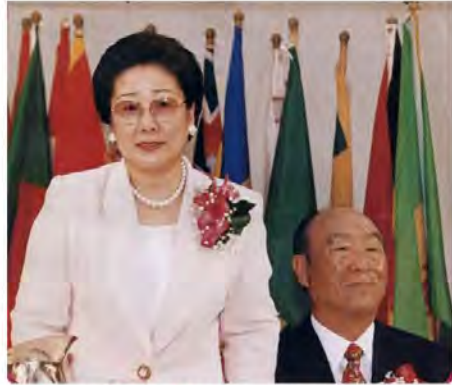
Mother and Father Moon 31st July 1996

The chronicle "40 Years in America" describes the event,