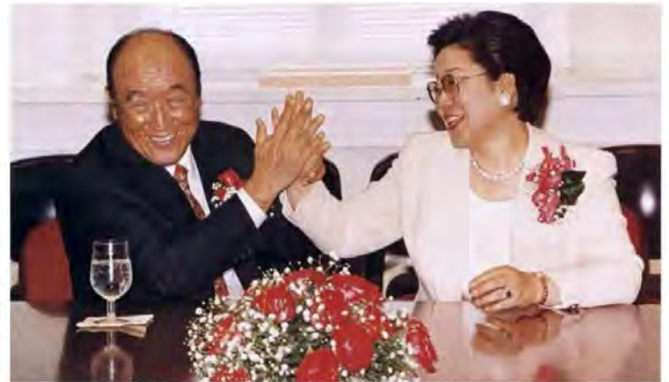
Father and Mother Moon 1st August 1996.