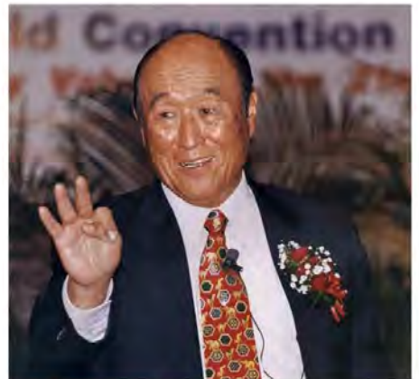
Sun Myung Moon 1st August 1996