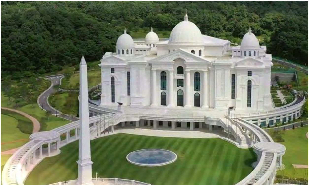
Cheonwon Gung starting to take shape. Here, in August 2024

"I've done it, I'm great. I've built the temple of God that my father promised to."