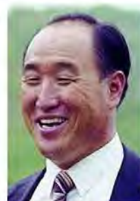
Sun Myung Moon, 1972.

"Why did God create Adam and Eve ? God is an incorporeal being, so unless He becomes the Parent in substantial form, He cannot directly love His children. Hence, He created them so He could have a form. Thus, the incorporeal God's purpose in creating Adam and Eve was, first, to assume a form." (From a speech Sun Myung Moon gave 6 th July 1992. Quoted from the English version of the speech collection Cheon Seong Gyeong , 2014-version, p. 89)