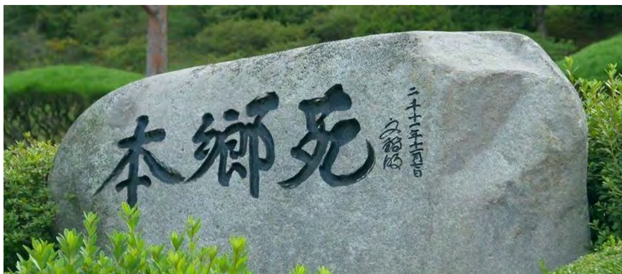
From Father Moon's gravesite in Gapyeong, South Korea