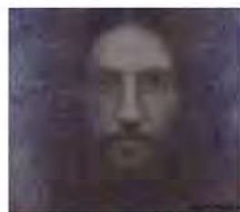
Jesus. License: CC ASA 4.0 Int