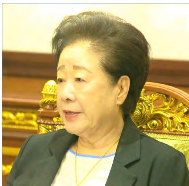
Mother Moon at international leaders' meeting in Gapyeong, South Korea 6th September 2024

We turned around in 20 hours, and went back to Korea. "Why?" you may ask. Well, that's what I want to share with you this morning.