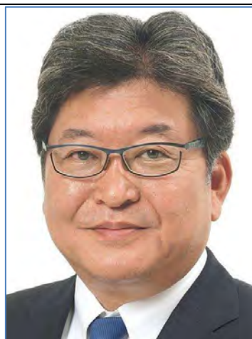
Koichi Hagiuda (2020)