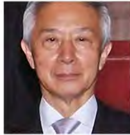
Masahito Moriyama, Minister of Education, Culture, Sports, Science and Technology (MEXT).

technology Masahito Moriyama (森山正広), who filed a request for a dissolution order with Tokyo District Court, had exchanged an "endorsement-affirming form" with a Unification Church-related organization in Hyogo Prefecture ahead of the 2021 House of Representatives election. Believers had actively made phone calls to support his election.