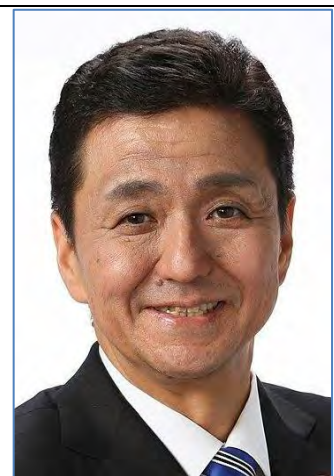
Nobuo Kishi (2014)

However, the article mentioned that at the time, before the House of Councillors (Upper House) election, there was talk of "supporting candidate Tsuneo Kitamura (北村経夫)", but it cannot be definitively said that the Liberal Democratic Party and the former Unification Church "exchanged an agreement document as organizations to cooperate in the election". Also present were former Minister of Economy, Trade and Industry Koichi Hagiuda (萩生田光一) - then Special Assistant to the President - and former Defense Minister Nobuo Kishi (岸信夫元) - who had switched from the House of Councillors (Upper House) to the House of Representatives (Lower House) in the previous year's election. None of the top three party officials were there, however, so it cannot be said that the LDP members present were officially representing the 'party' as a whole.