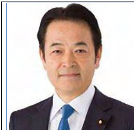
Parliamentary Vice-Minister of Economy, Trade and Industry Tsuneo Kitamura

The article that day aimed to demonstrate that the "organizational relationship" between Abe's Liberal Democratic Party and the former Unification Church was "almost proven". As the LDP presidential election entered its final stages, they likely wanted to challenge the LDP, which had declared it would "cut ties", by saying, "What about this?"